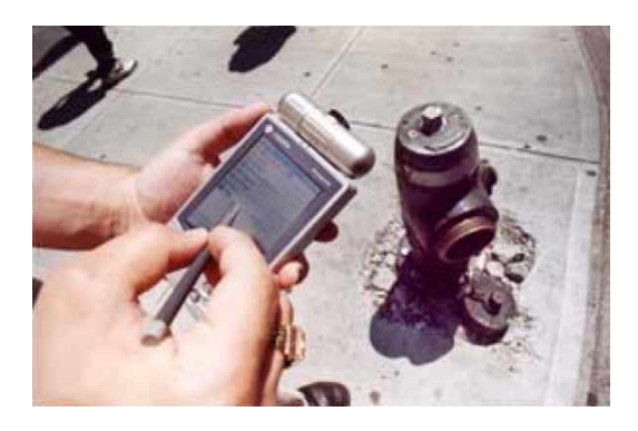
Figure 4. The ComNET handheld device.

residents are asked to use the vocabulary of 'features' and 'conditions' to describe what is 'wrong' in the scene. After spending about two minutes on the scene, the staff member would