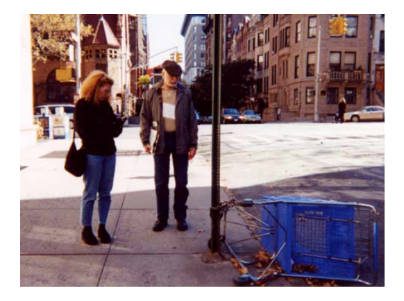
Figure 1. Two concerned residents, one with a clipboard of the ComNET data model and the other with the ComNET handheld device, inspect the 'abandoned shopping cart'.

In partnership with The Fund, Sustainable Seattle organized community residents to walk and code objects on their neighborhood streets, using software called ComNET (Computerized Neighborhood Environment Tracking) on a mobile device (see Figure 1). This surveying of