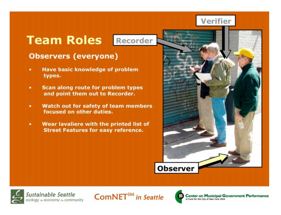
Figure 2. During the 'Training the Eye' presentation, surveyors would review their roles on the survey team.

Streetlights, benches, sidewalks, curbs, alleys, etc., are all physical features of the urban; all are things that fall into disrepair and require some governmental entity to either fix or replace. I argue that these three other featureconditions indicate directly or indirectly the presence of certain bodies as features which require governmental intervention. Furthermore, the feature-condition called 'People', also codes bodies, but in a qualitatively different way. Here the 'conditions' of People are positively flagged in bold and italics-as 'civically engaged/activism' and 'active/healthy'. This qualification of certain bodies as 'assets' or 'deficits' needs underlined: that in the mapping of objects of the city street, urban bodies are also mapped.