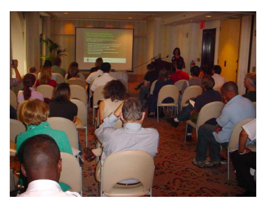
Figure 7. The training of geocoding subjects.

The training of geocoding subjects happens in moments where community residents interface with handheld technologies and neighborhood assessment endeavors. The photograph in Figure 7 captures one of these moments in the makings of urban space. The resident in the back of the room, scratches his head. To his left, another resident shifts to her side to better see the speaker, the trainer. In front of her, a resident leans forward to read the