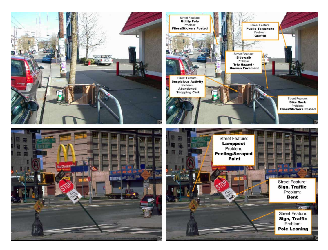
Figure 6. Residents would be asked to use their feature-conditions sheets to practice identifying things in the urban scene that need to be recorded in the handheld device.

streets in the ownership that comes with data collection and to follow orders from their centralized data model. However, cyborgs are resistant to standardization. These geocoding subjects have a body, and as such they embody their cyborgian apparatus differently. The surveyors who participated in the ComNET program were of different ages, ethnicities, and socio-economic backgrounds. Their concerns about the city street differed, although these differences were less reflected in the data model of the handheld devices. Their subjectification meant that their bodies were to become altered—their way of seeing and