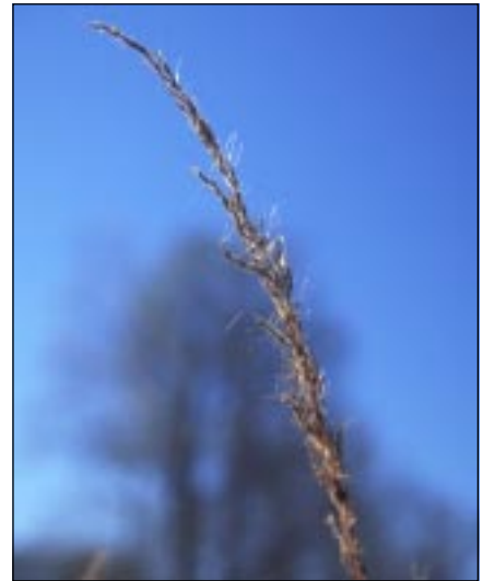
Indiangrass plants and seed heads take on a golden color in the fall.