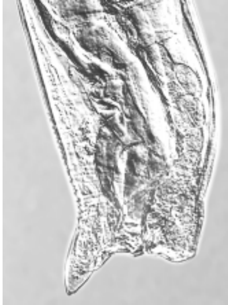
Figure 17B Female tail