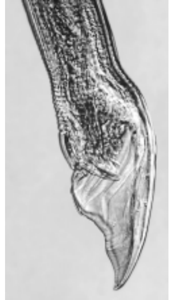
Figure 17C Male tail

This is one of the easiest species to identify because of two characteristics: the extremely short, thick, and stubby buccal capsule walls that fan out away from each other and the very heavy internal leaf elements . The walls are bullet-shaped , but are dented in the middle. Rising out of the tips of the mouth walls are the leaves of the internal crown , which are so broad that they resemble the teeth of a comb .