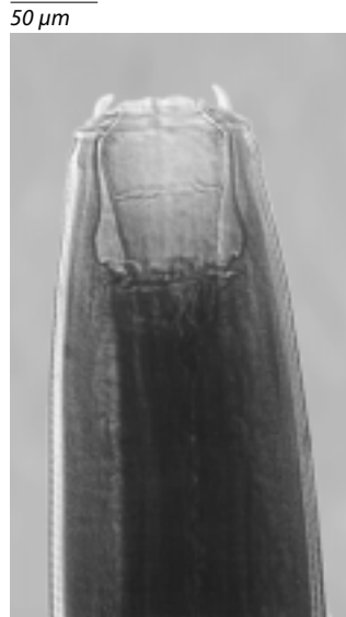
Figure 25B Head