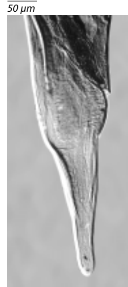
Figure 25C Female tail