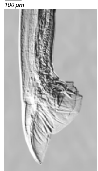
Figure 25D Male tail

This species is one of the easiest to identify. It is a small worm , but has a very large buccal capsule , which is almost a complete square ; if anything, it is a little deeper than wide. The walls are quite large at the base and taper sharply as they rise to the anterior end. They resemble the dangling legs and feet of a dead duck . Running horizontally near the middle of the capsule is a conspicuous ledge or line