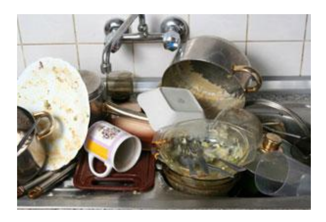
Food, moisture, and shelter for cockroaches

Successful cockroach control requires a combination of techniques. Cockroaches flourish where food, moisture, and shelter are readily available so sanitation is an important step in preventing problems. Crumbs, spills, grease, and other food debris should be cleaned. Unwashed dishes, kitchen utensils, and food should not be allowed to set overnight. Loose food should be stored in tight-fitting containers, and garbage, cardboard boxes. Paper bags should not be allowed to accumulate. Items in food storage areas should be removed from cardboard boxes and stored off the floor on stainless steel racks. Moisture leaks should be repaired and floor drains routinely sanitized.