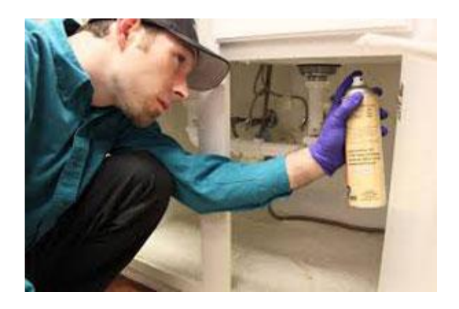
Using pyrethrins aerosol to flush cockroaches during an inspection

Cockroaches may hide in many places so a thorough inspection is essential to locate as many of these sites as possible. During inspections, consider the unique habits and preferred harborage sites of the different species. A bright flashlight, inspection mirror (for inspecting underneath, above and behind construction elements), and a set of screwdrivers, pliers, etc., to access equipment and other potential hiding places, are essential tools for conducting a professional cockroach inspection.