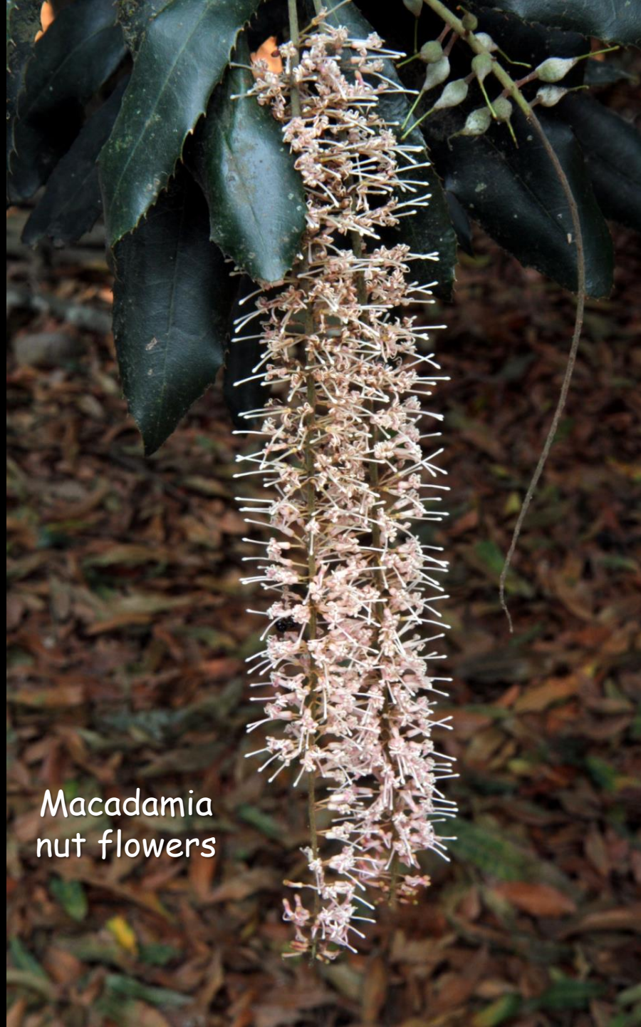
Macadamia nut flowers