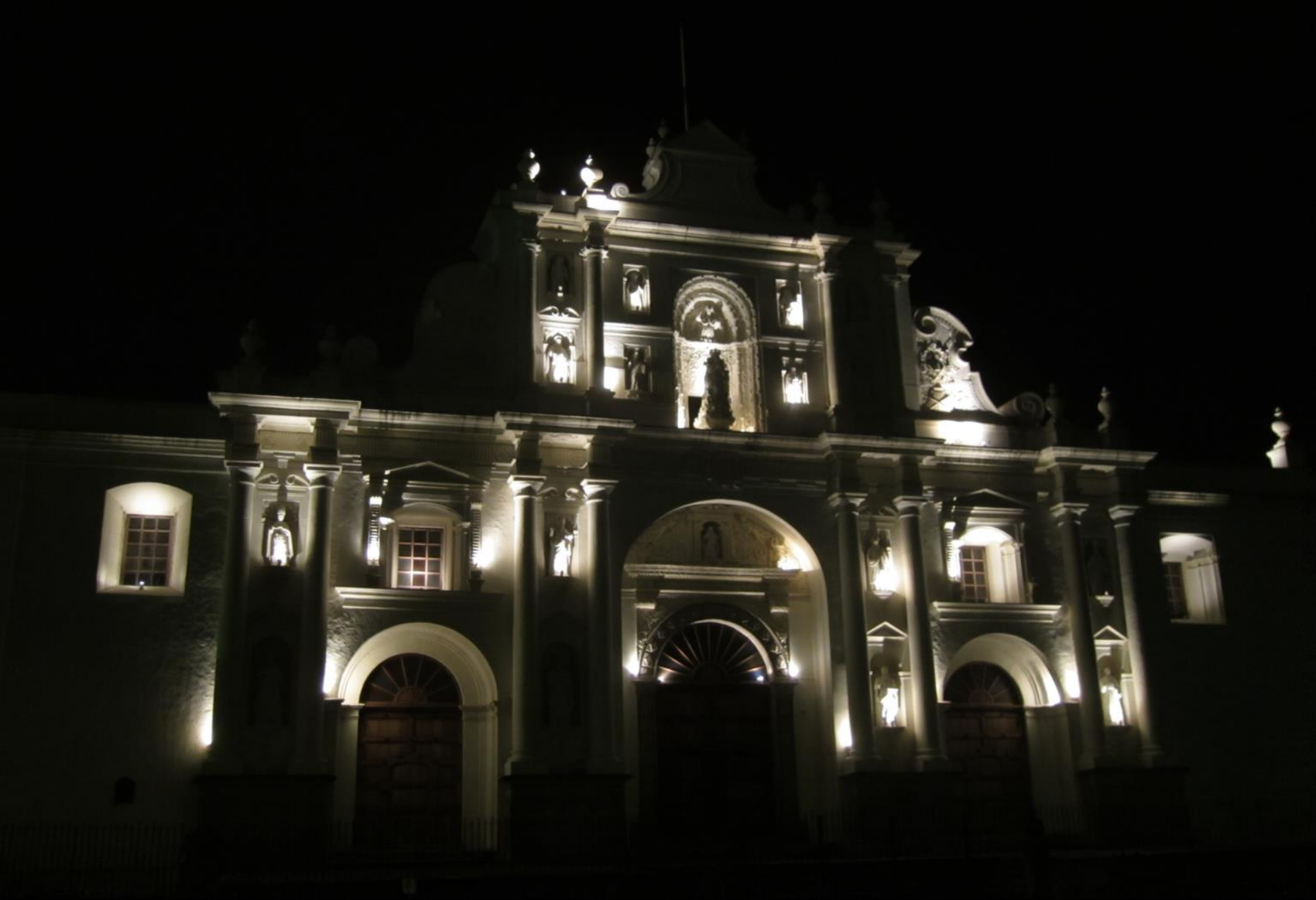
We had an evening work before dinner - Cathedral of San Jose