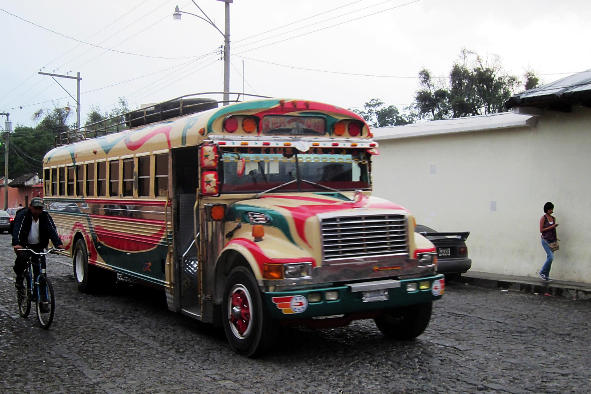
A colorful "chicken" bus