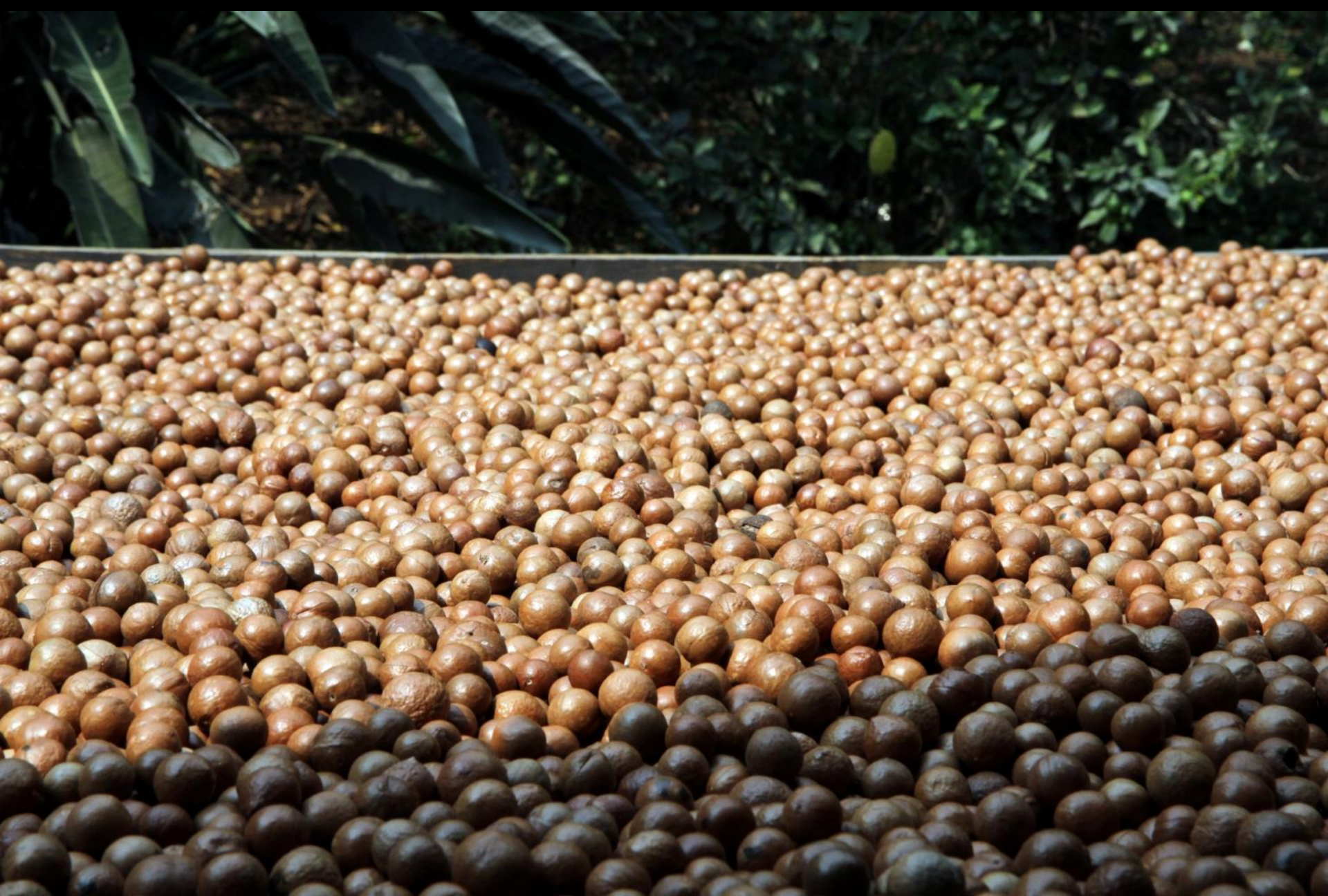
Macadamia nuts drying