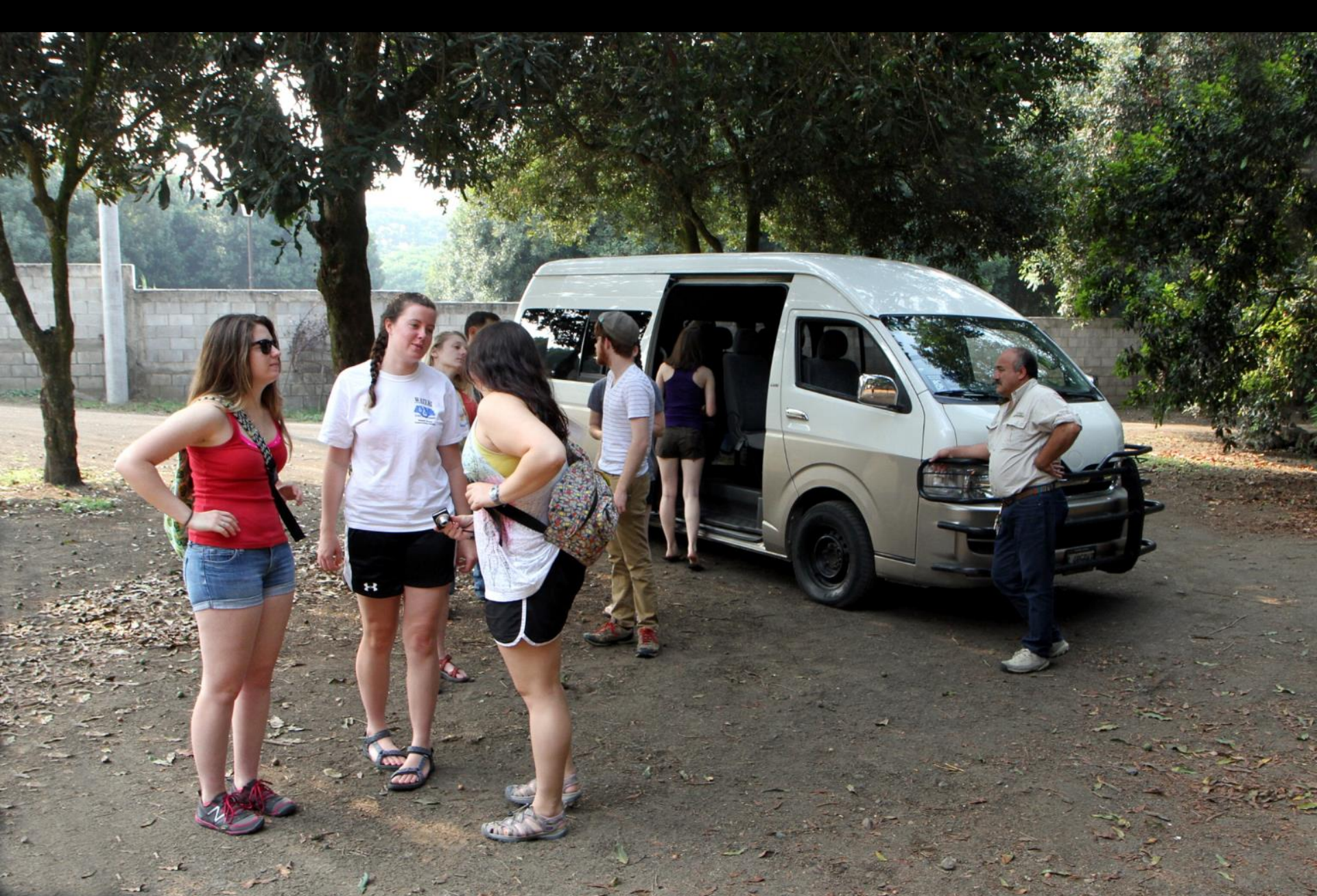
Driving to Macadamia nut farm