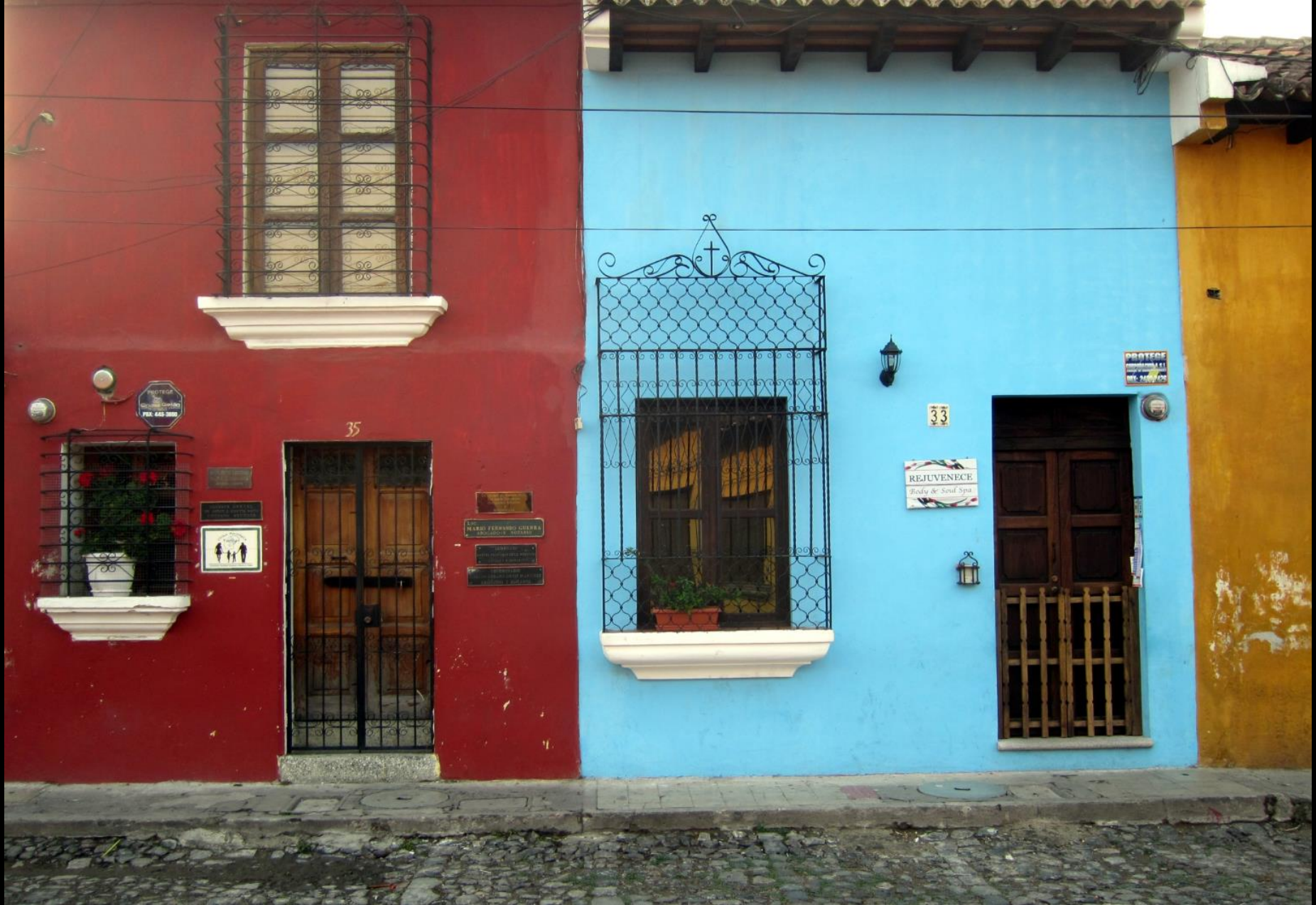
Antigua is a World Heritage site noted for its colorful Spanish Baroque-style buildings