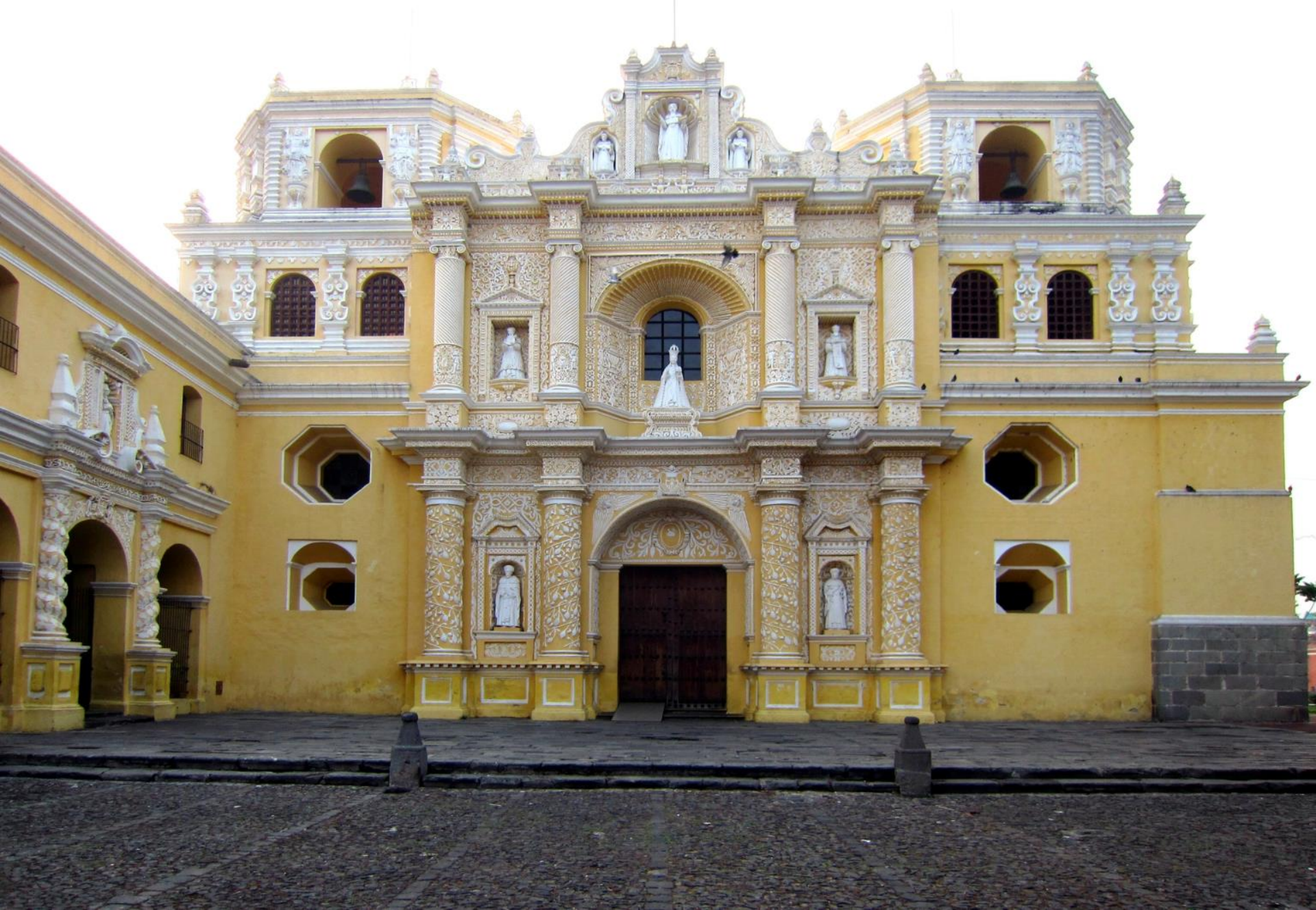
La Merced Church