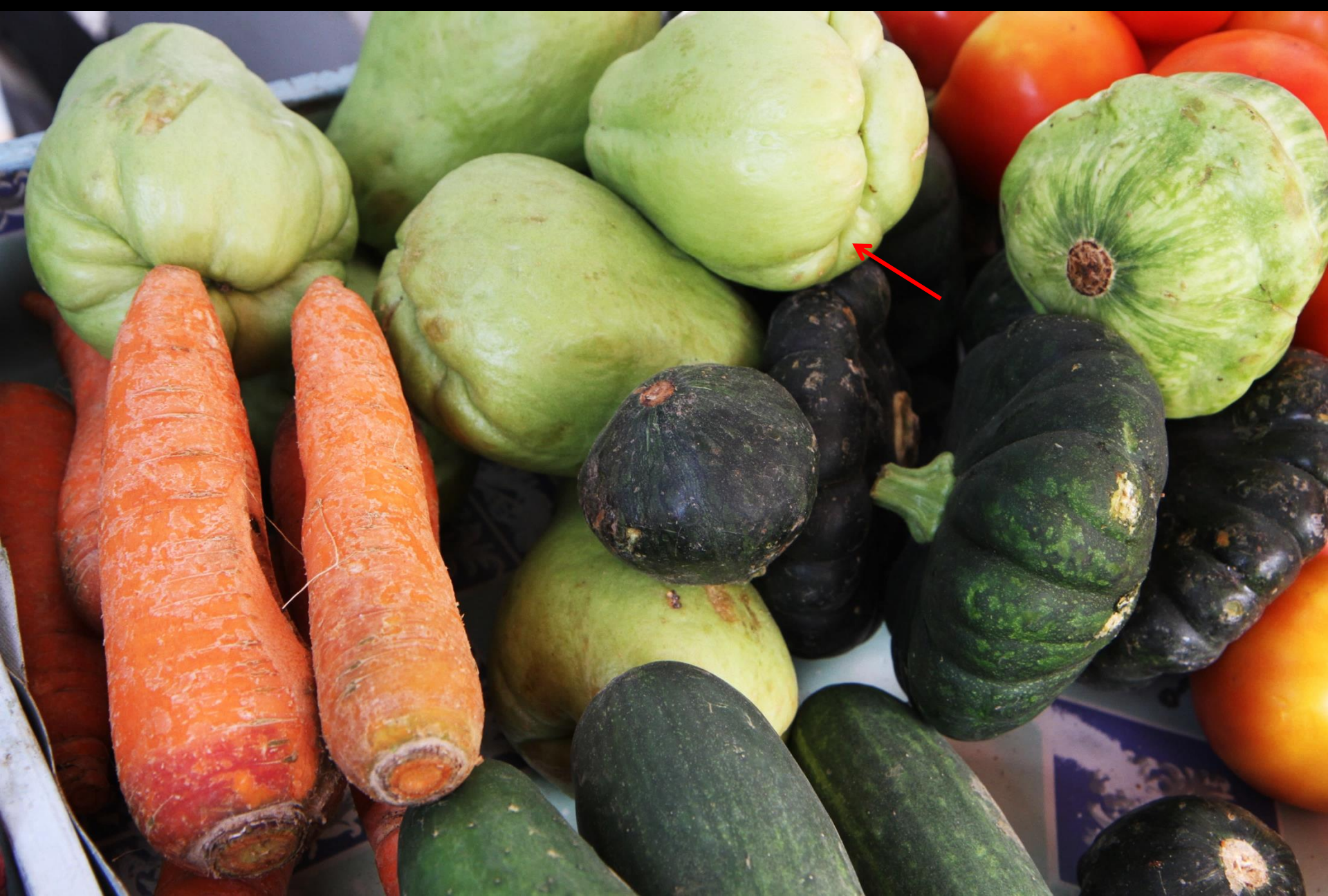
Water squash or Chayote ( Sechium edule ) is a common food in Guatemala