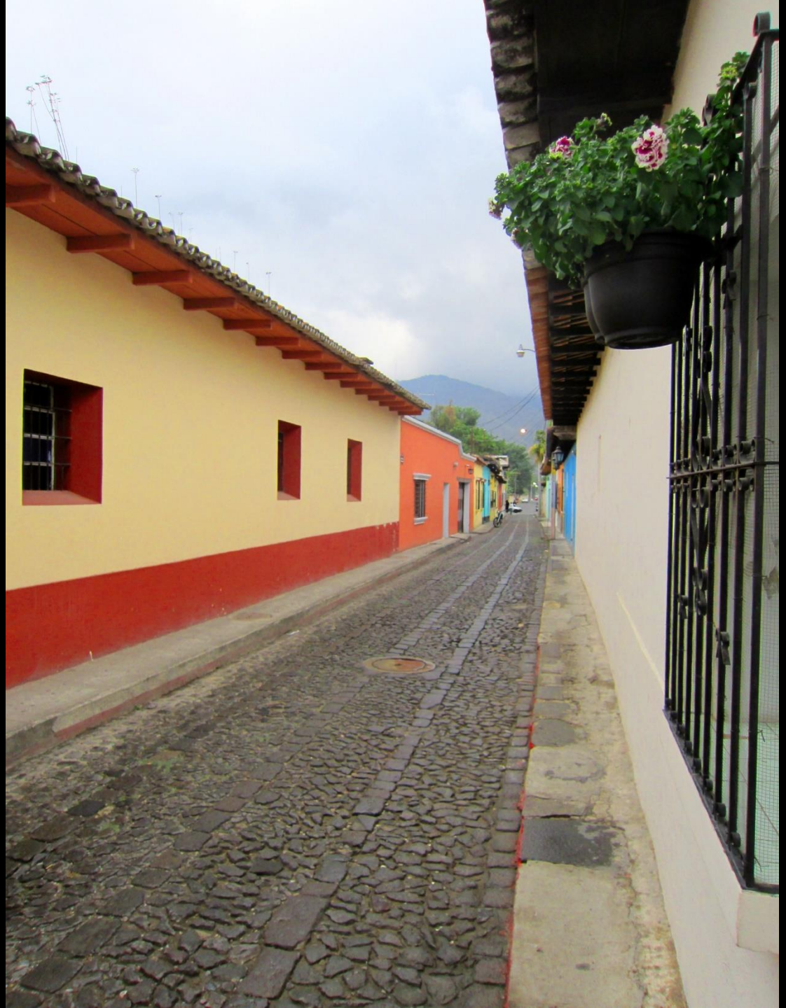
Cobble stone streets