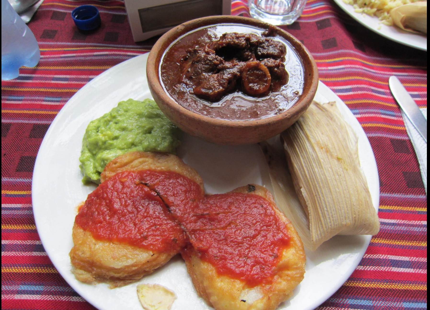
Lamb stew with guacamole, tamale and Chayote root