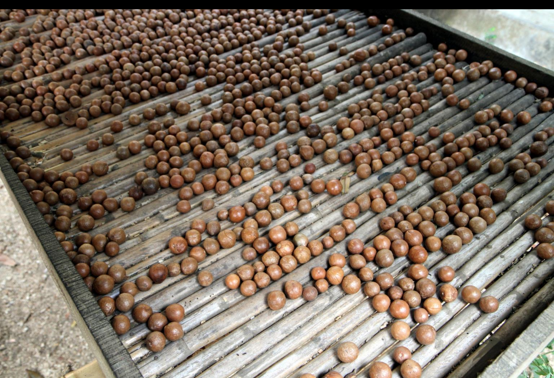
Macadamia nuts waiting to be sized