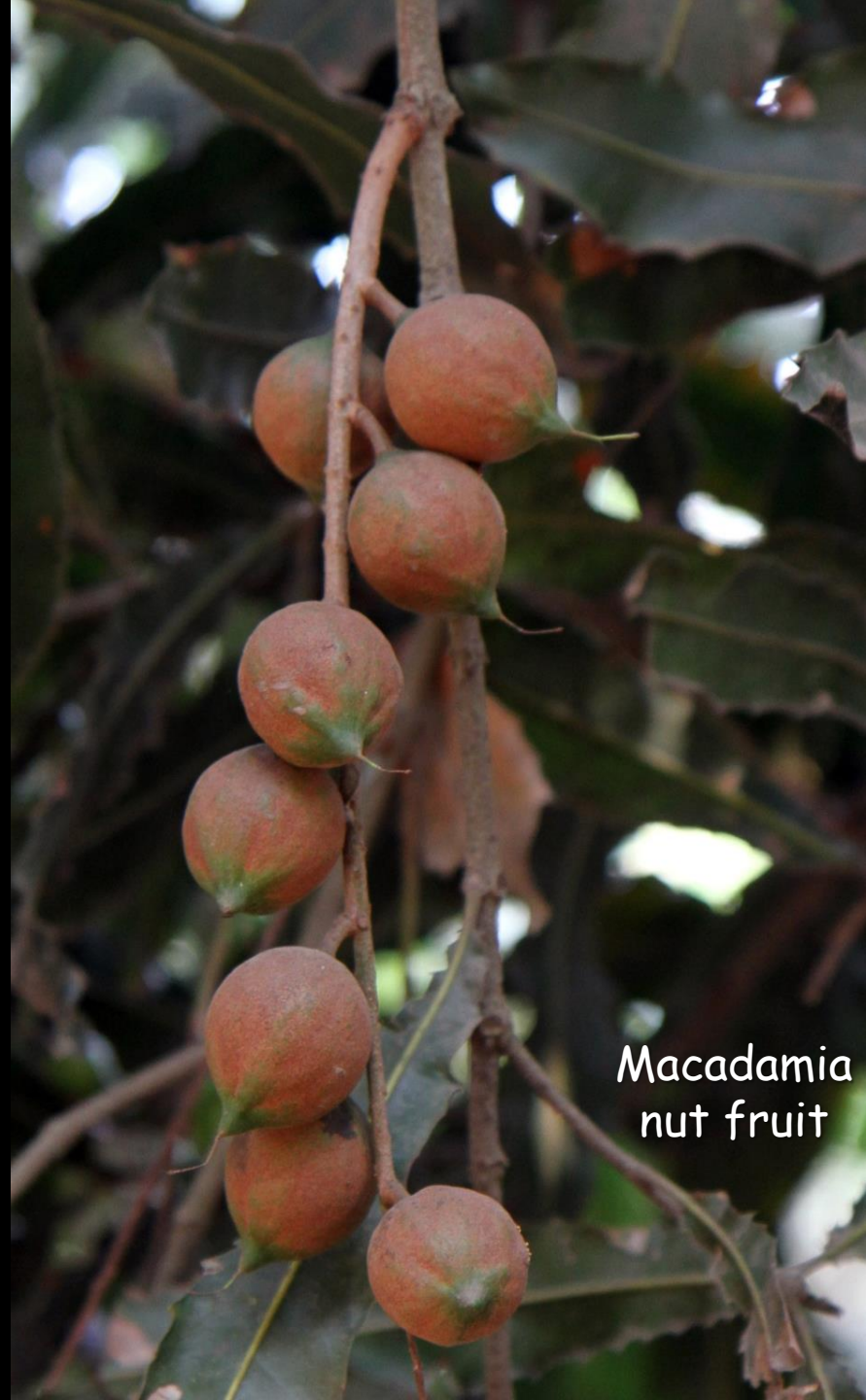
Macadamia nut fruit