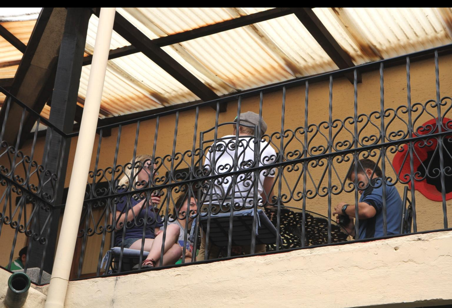
Drinking Hibiscus punch (Rosa de Jamaica) enjoyed on the hotel balcony