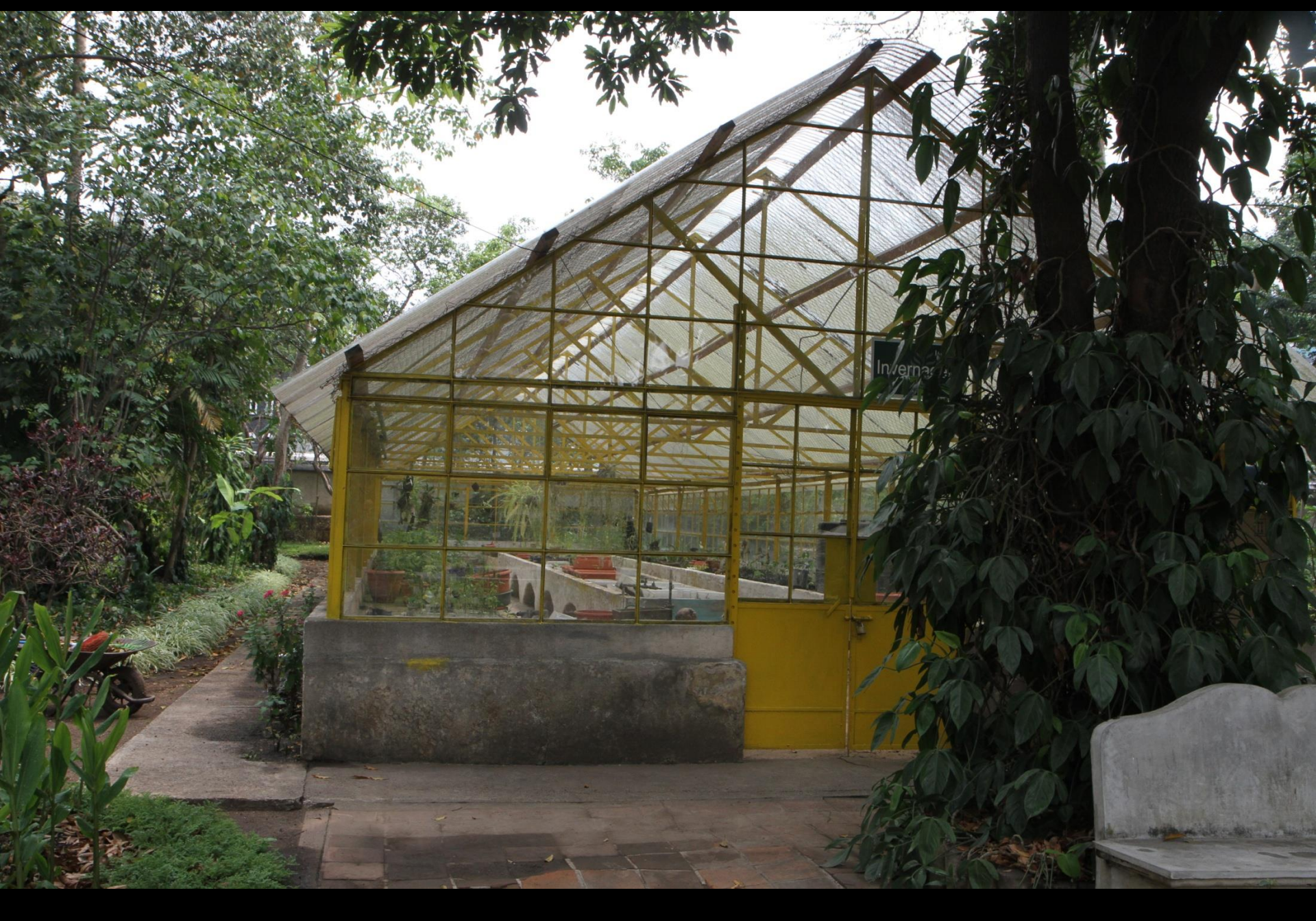
Greenhouse for arid plants