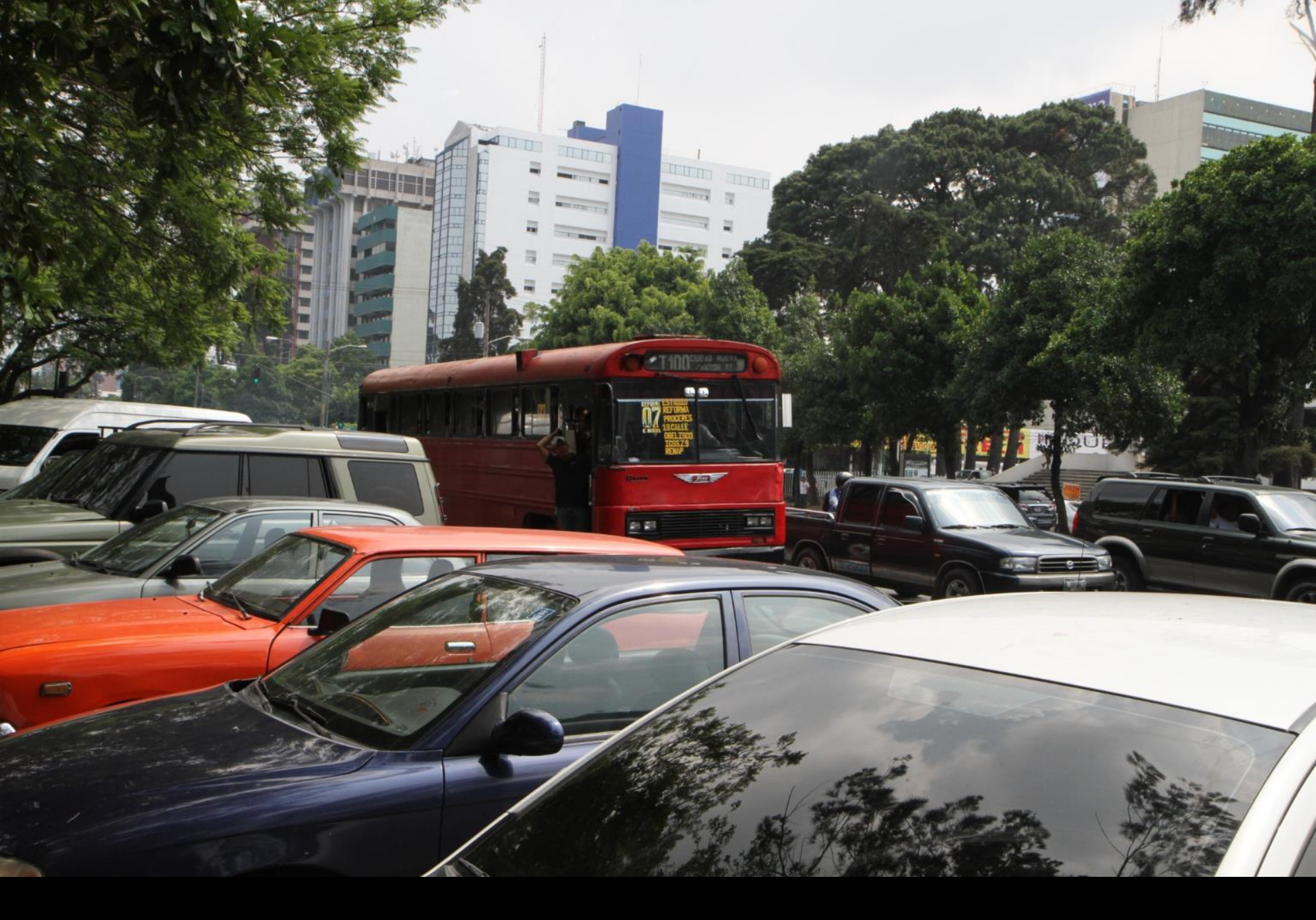
We spent only a brief time in Guatemala City to see the Botanic Garden.