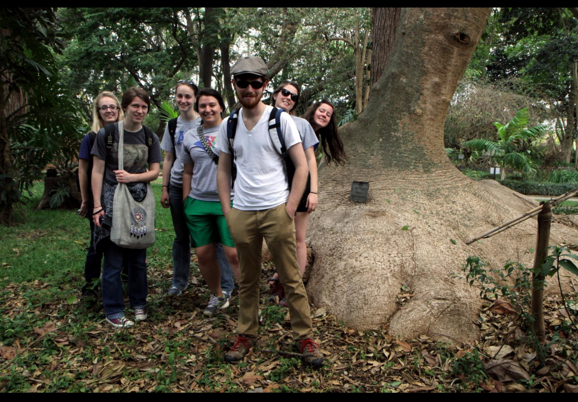
Group picture next to Ombu (Phytolacca dioica)