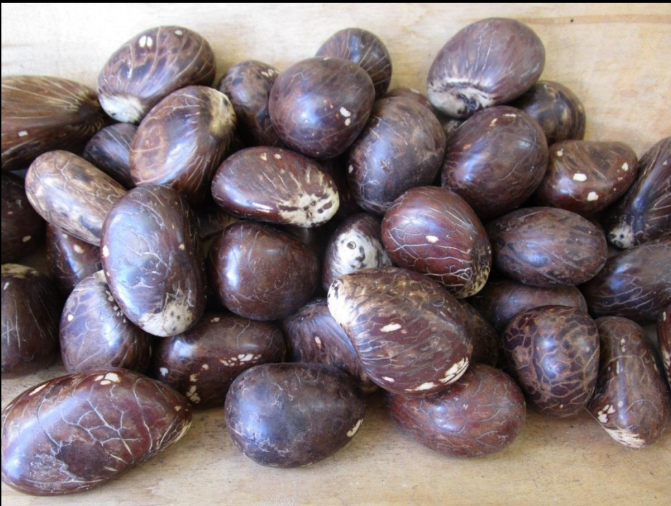
Palm fruits containing tagua nuts