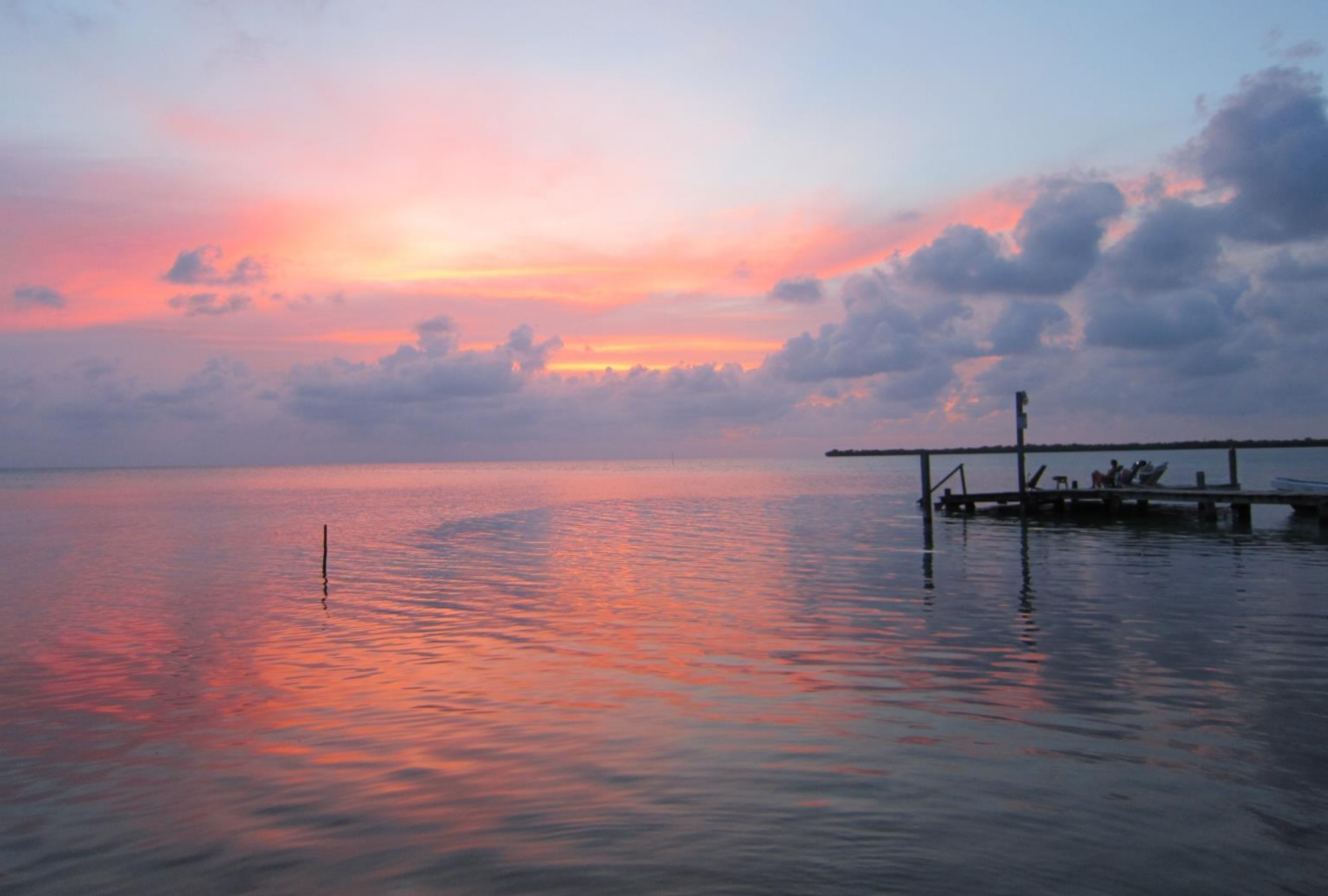
Evening walk to the "Split" to see the sun set