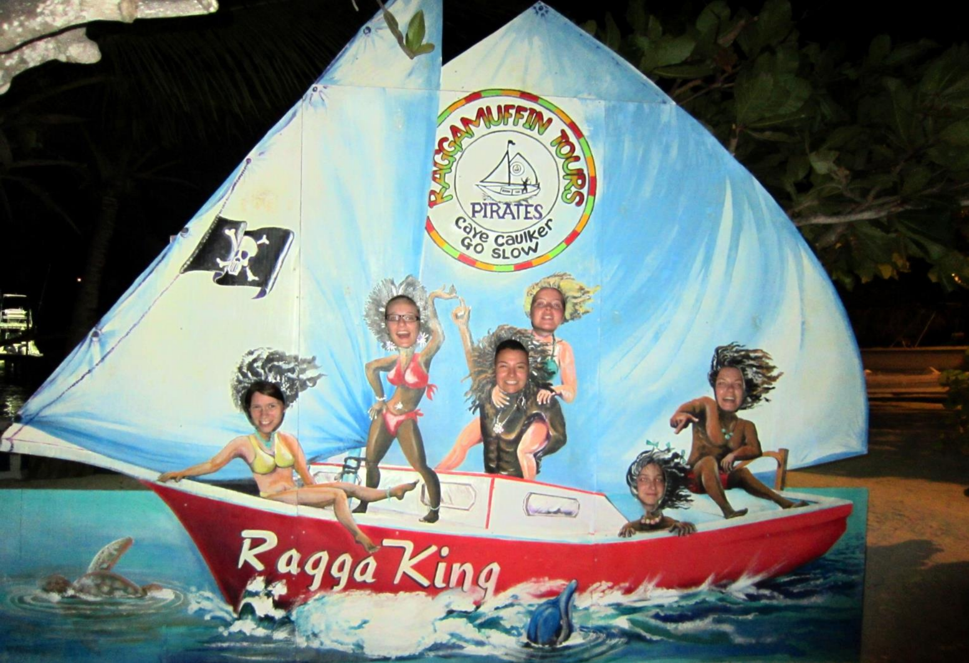
Prelude to sailing to the reef next day