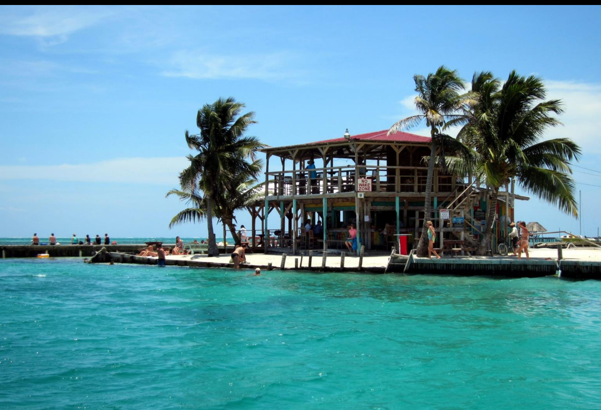
Caye Caulker is a small island off the shore of Belize