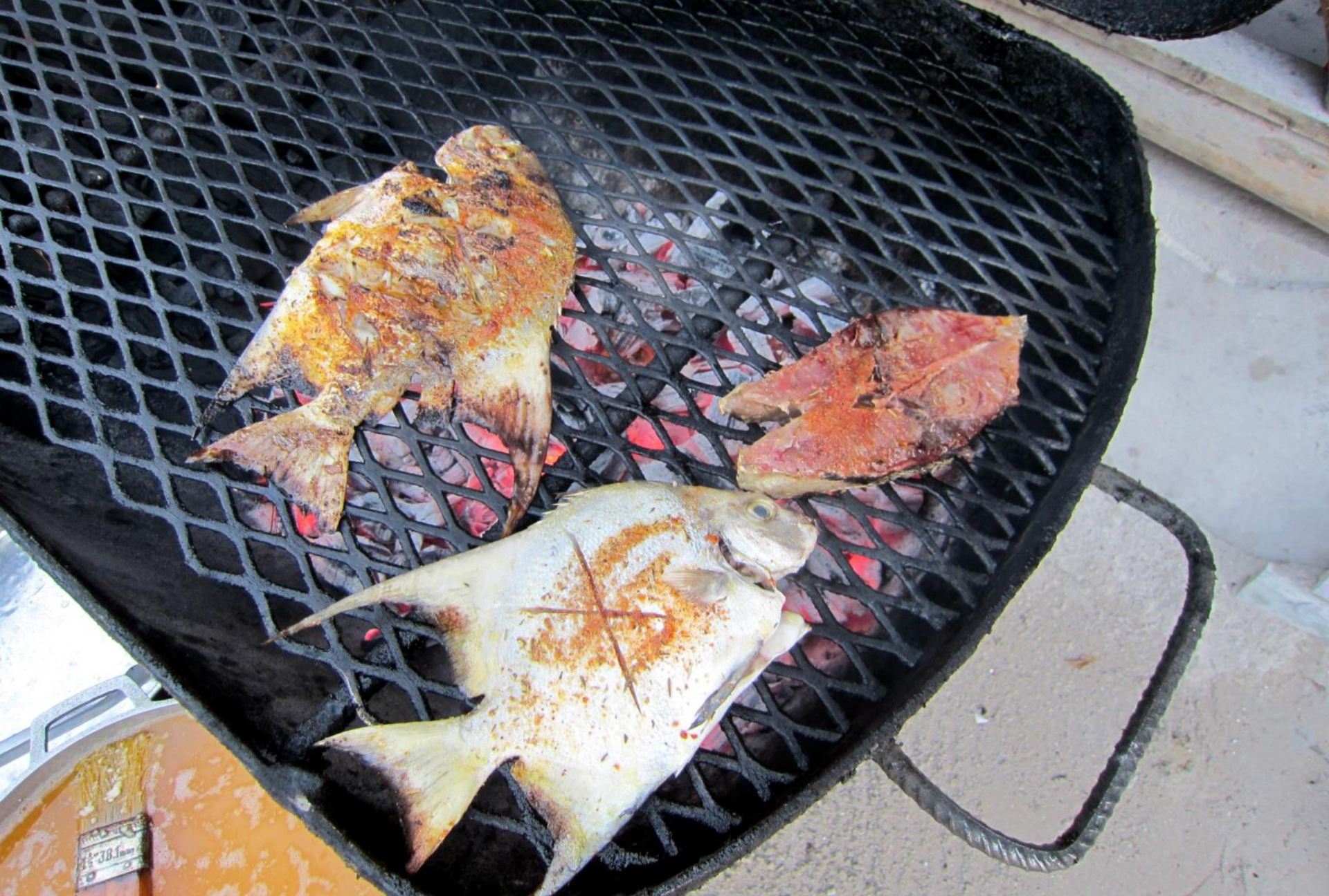
Fish on the grill