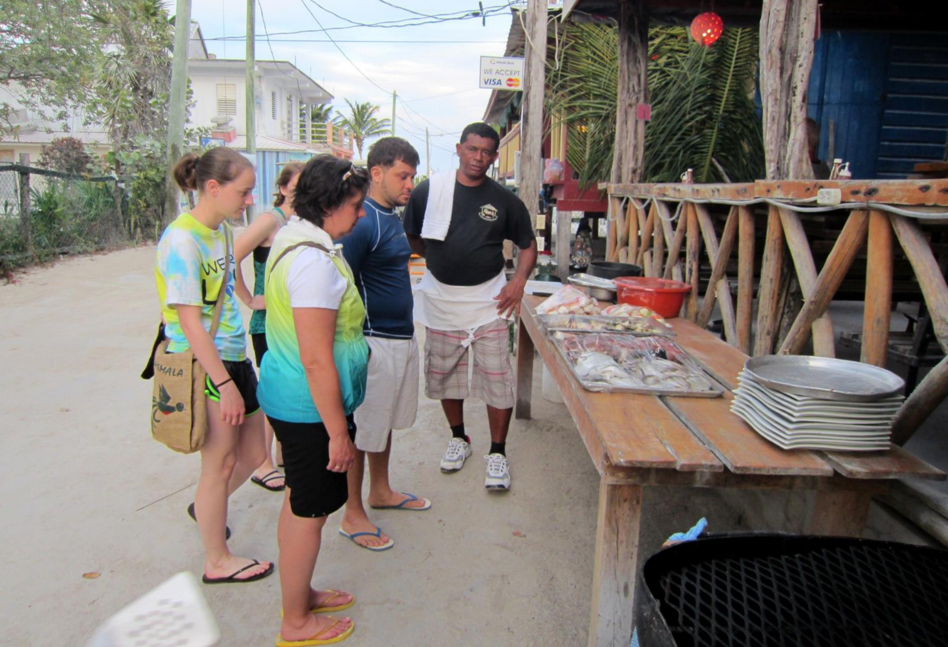
Checking out the fish for dinner