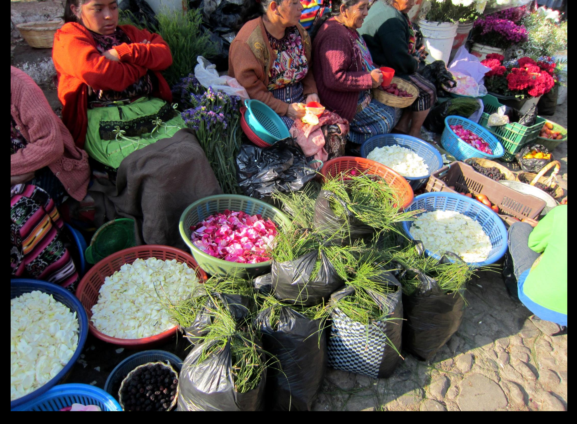
Pine needles and flower petals are placed on the floor of holy places