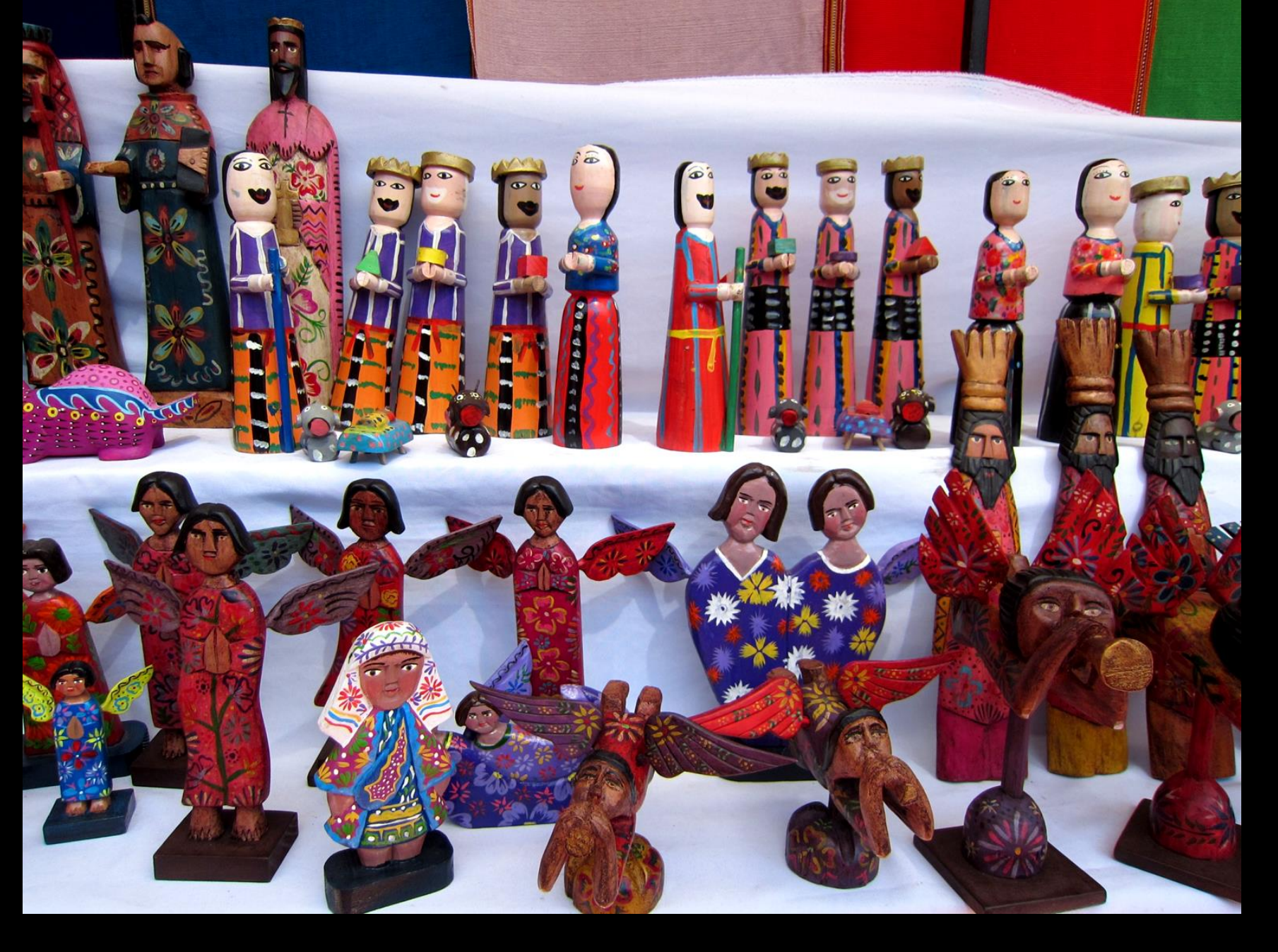
Some of the Guatemalan figurines are so similar to Kentucky primitive art.