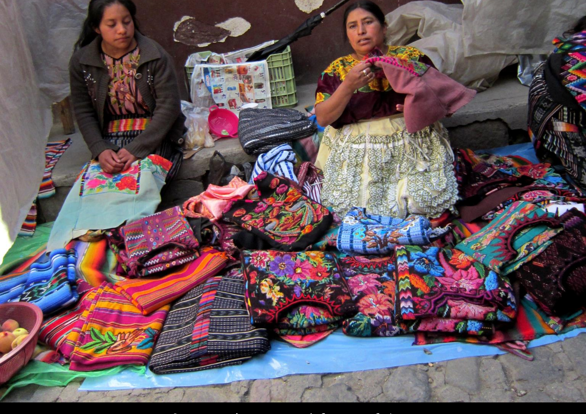
Guatemala is noted for its fabrics