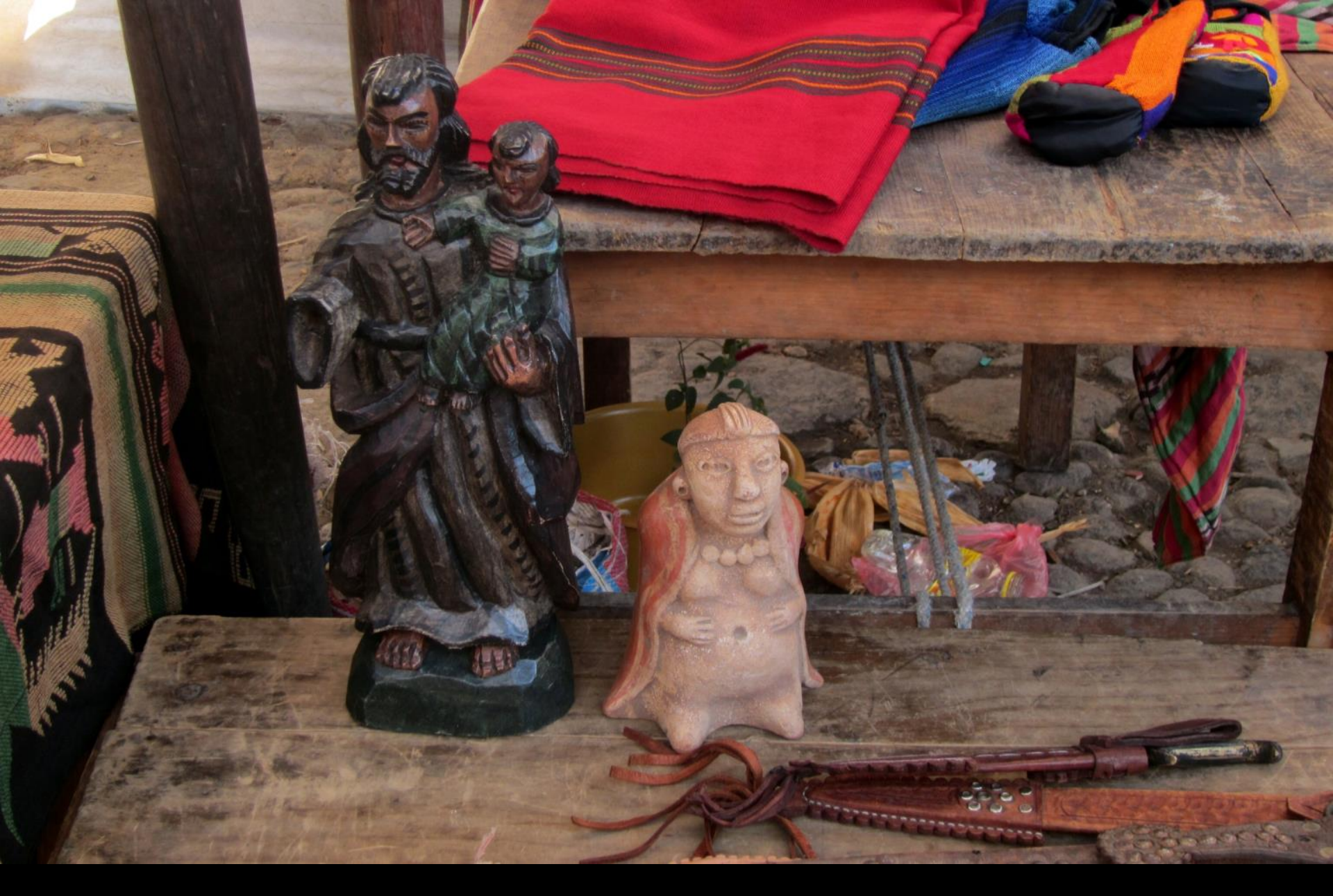
These figurines show the dichotomous nature and melding of the Catholic and Mayan religions.