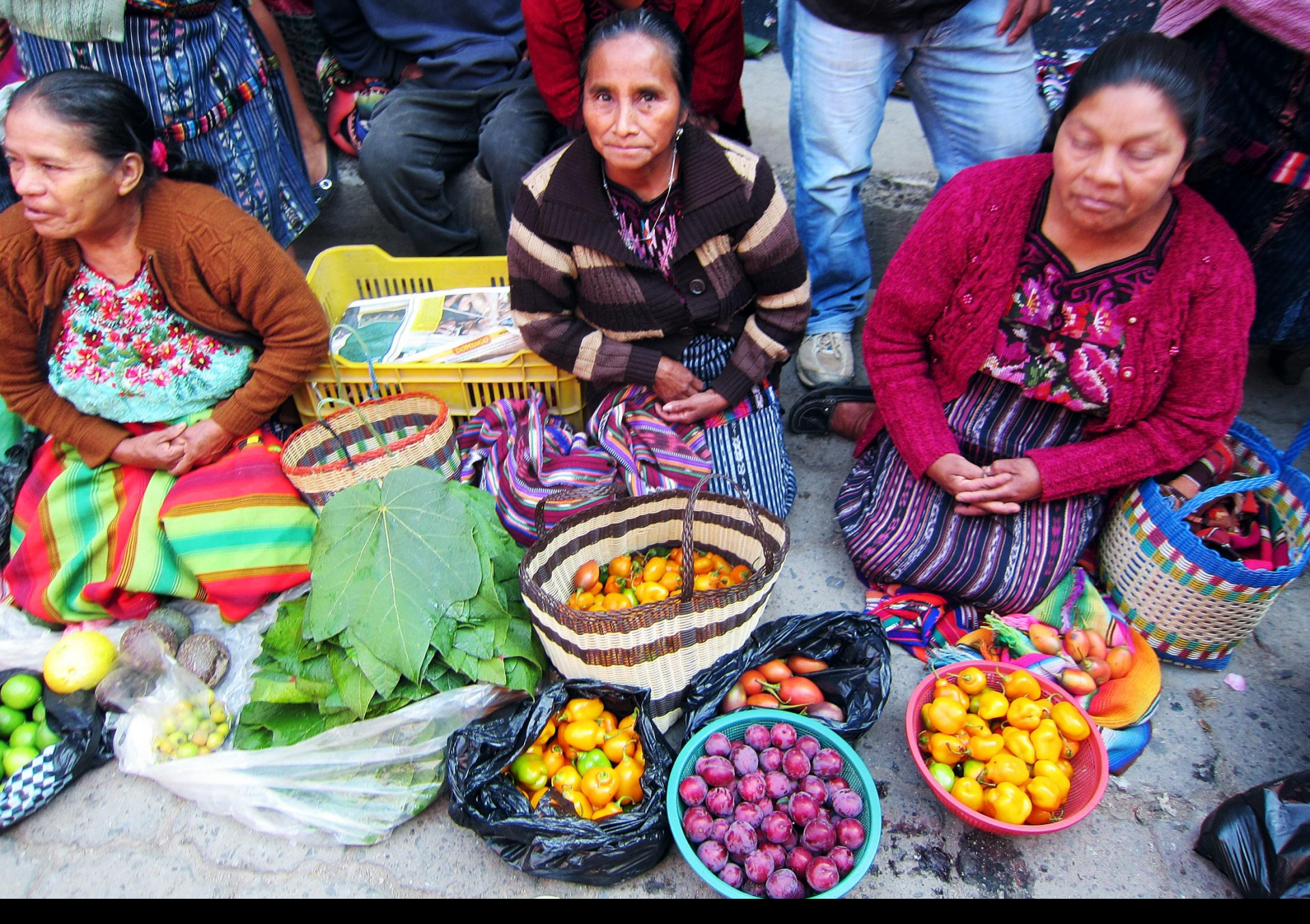
The produce market with fruits and vegetables