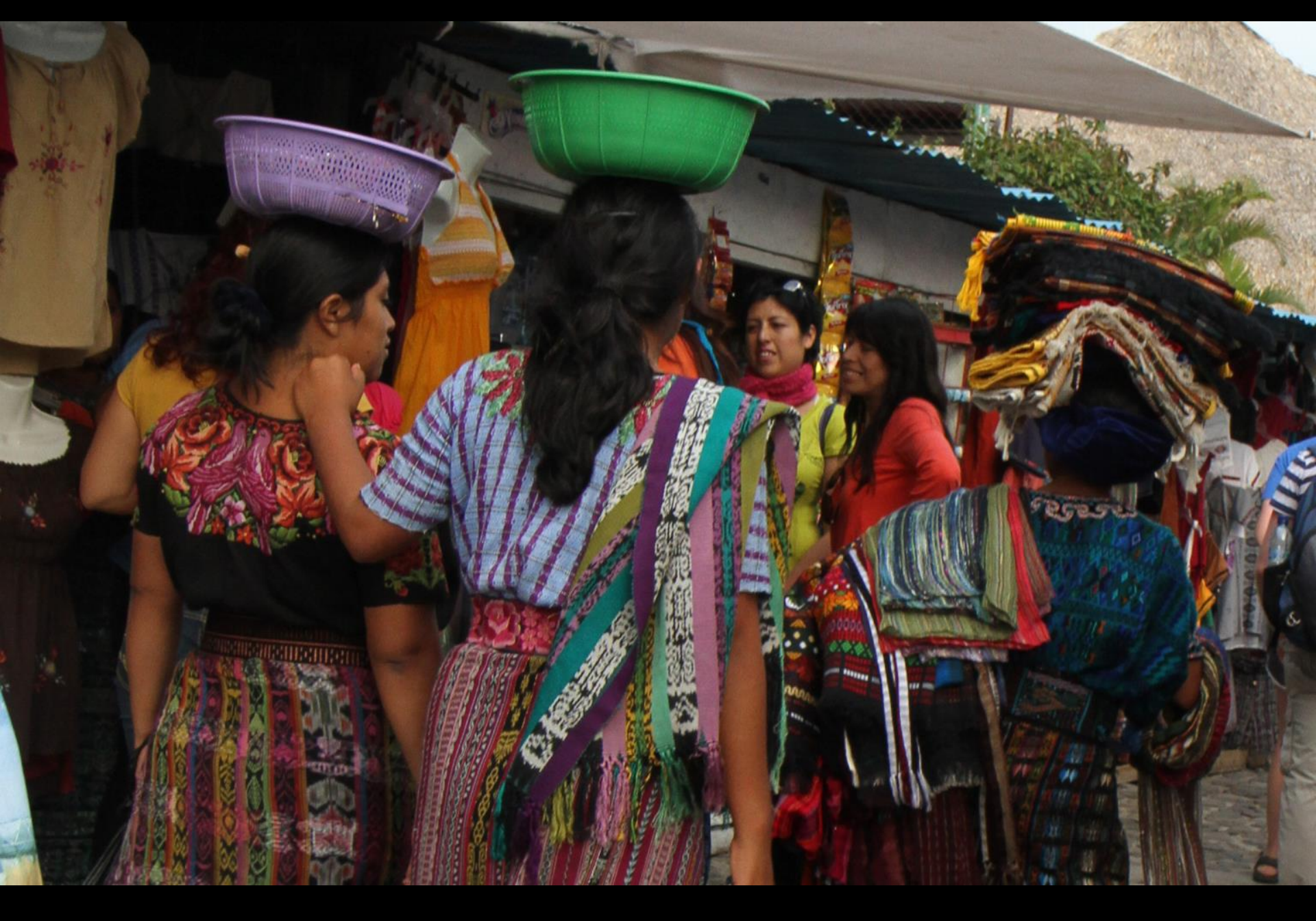
Many cultures use their heads to carry a variety of materials.