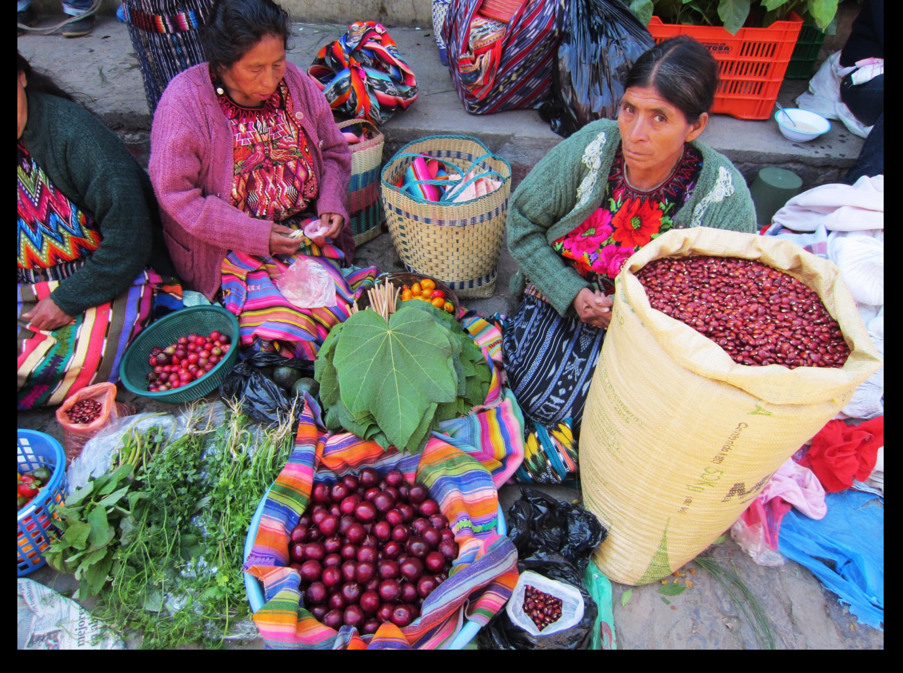
Many types of large leaves are used to wrap tamales