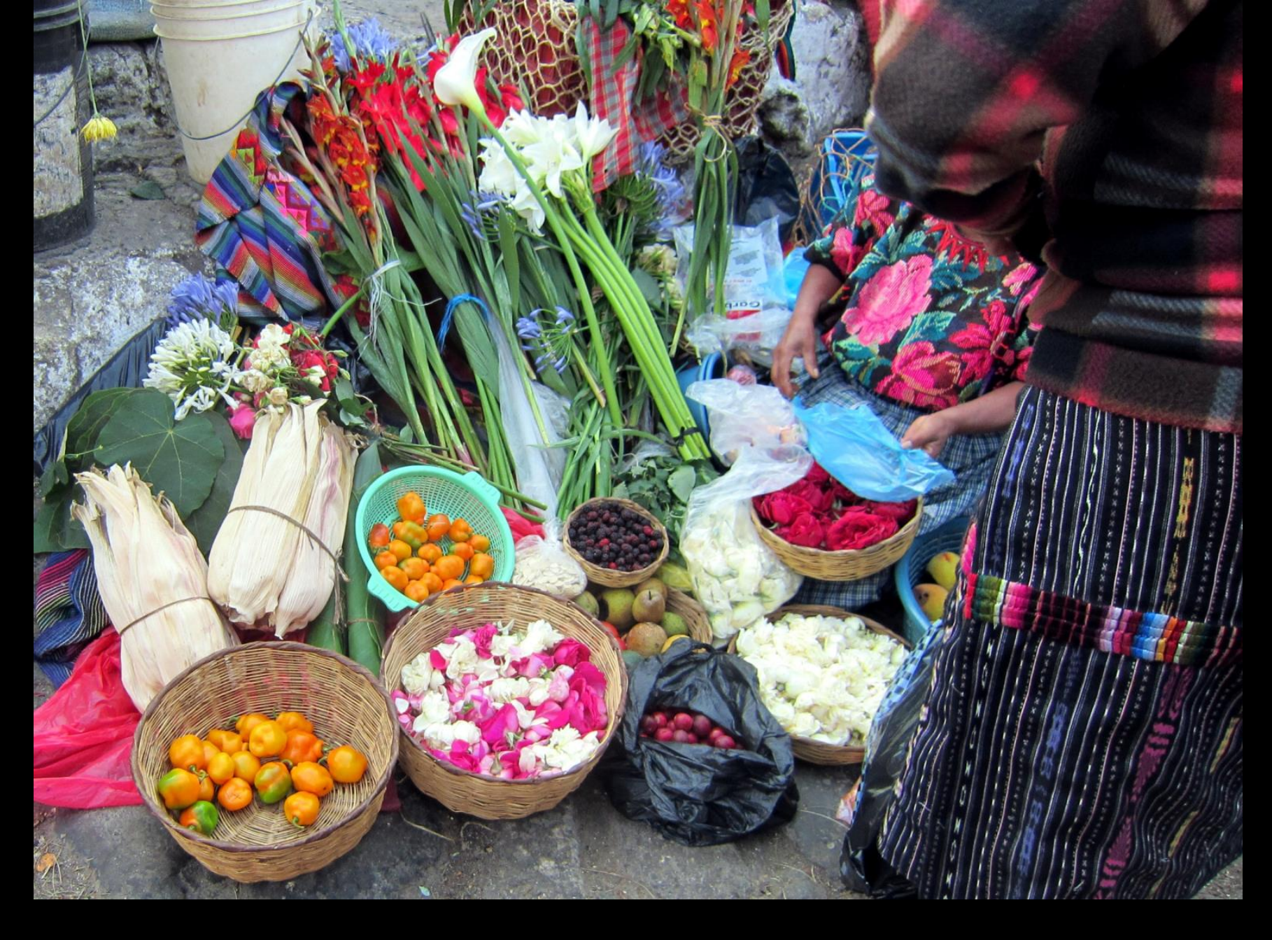
A mixture of cutflowers, petals, fruits and vegetables