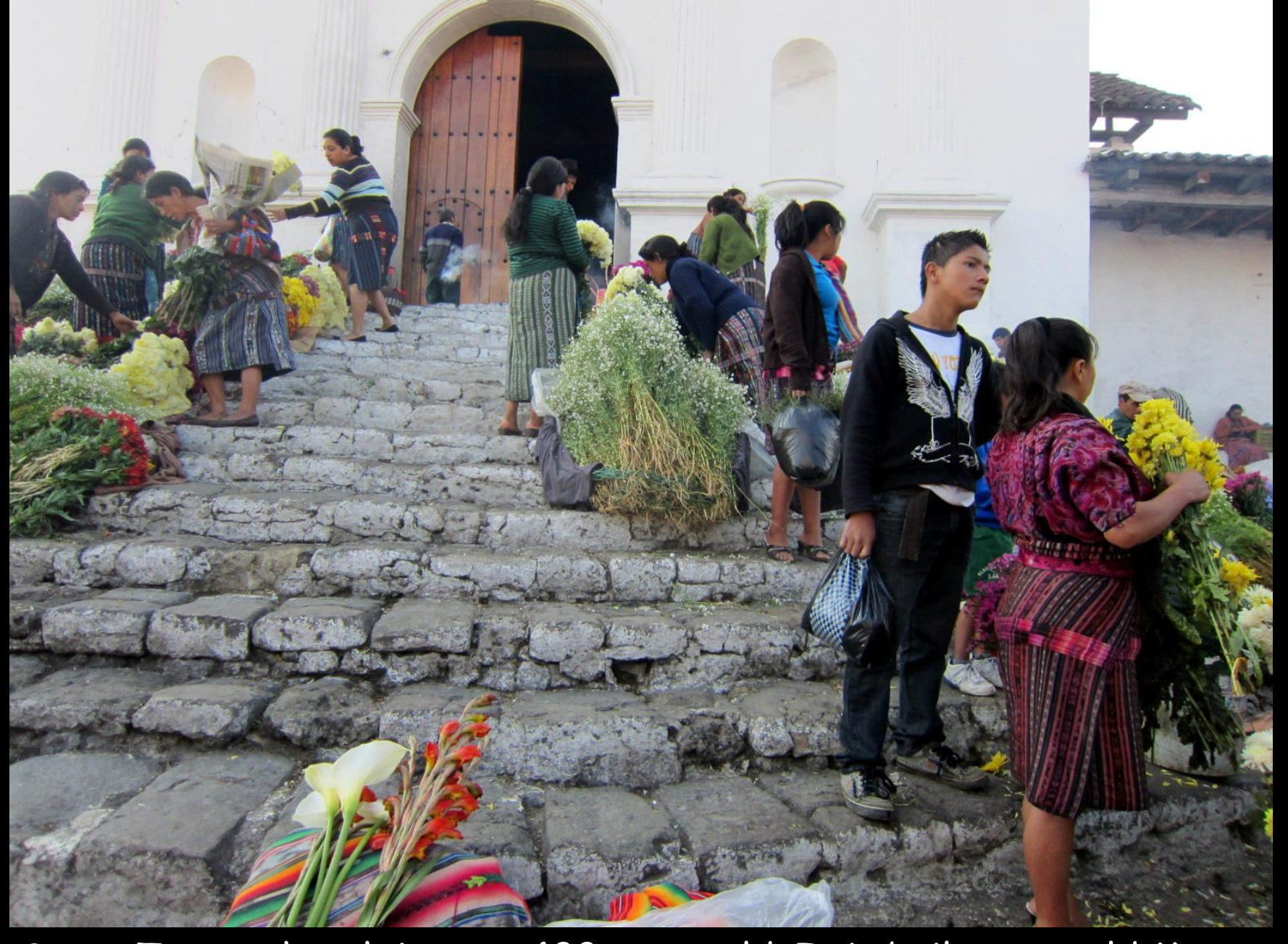
Santo Tomas church is over 400 years old. It is built on an old Mayan temple. The 18 steps represent the months in the Mayan calendar.