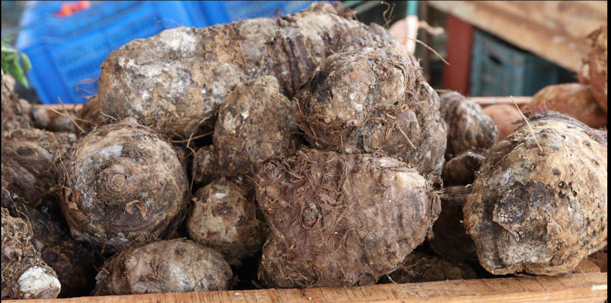
Taro ( Colocasia esculenta )