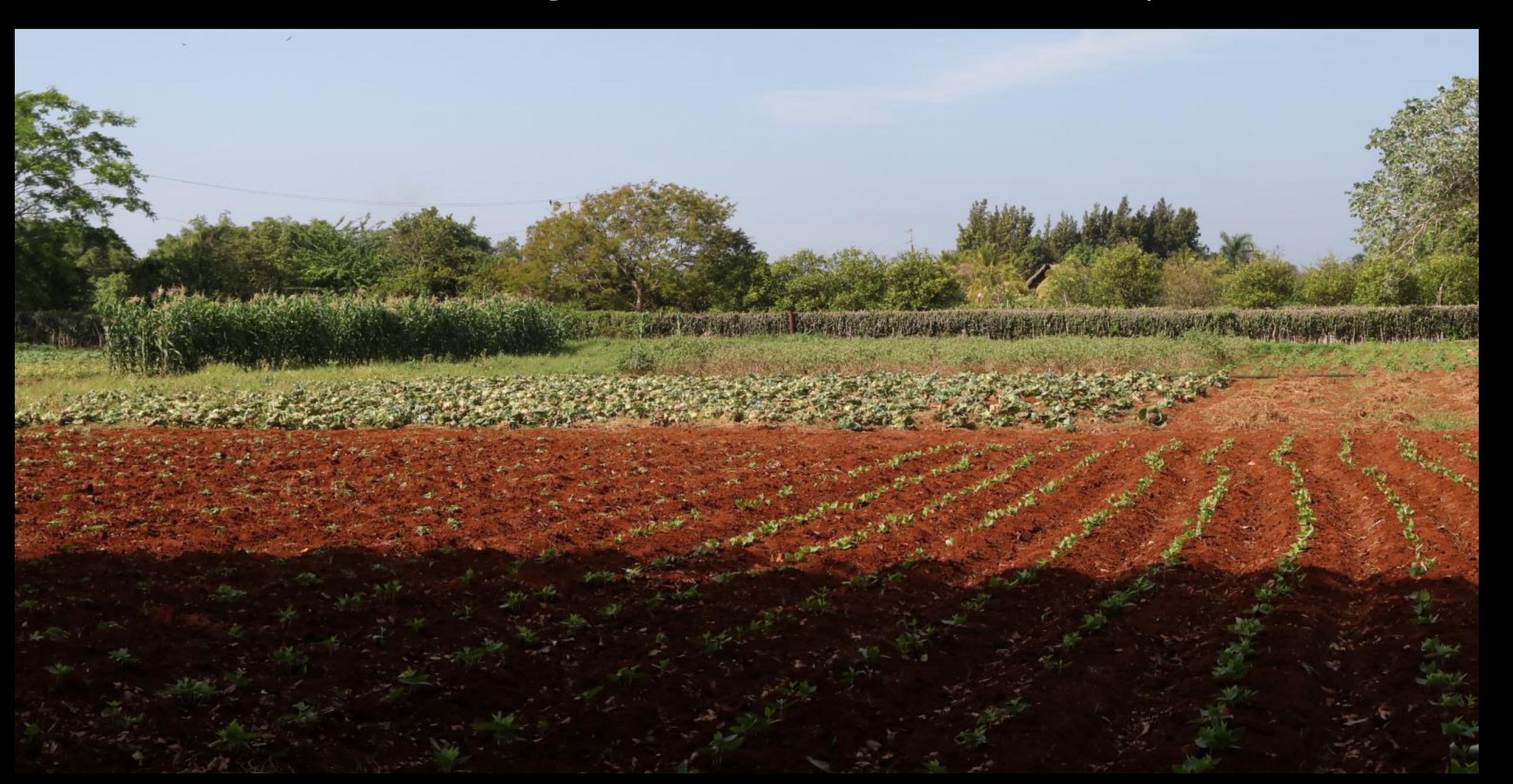
El Retiro was a large farm in Cardenas, Matanzas province.