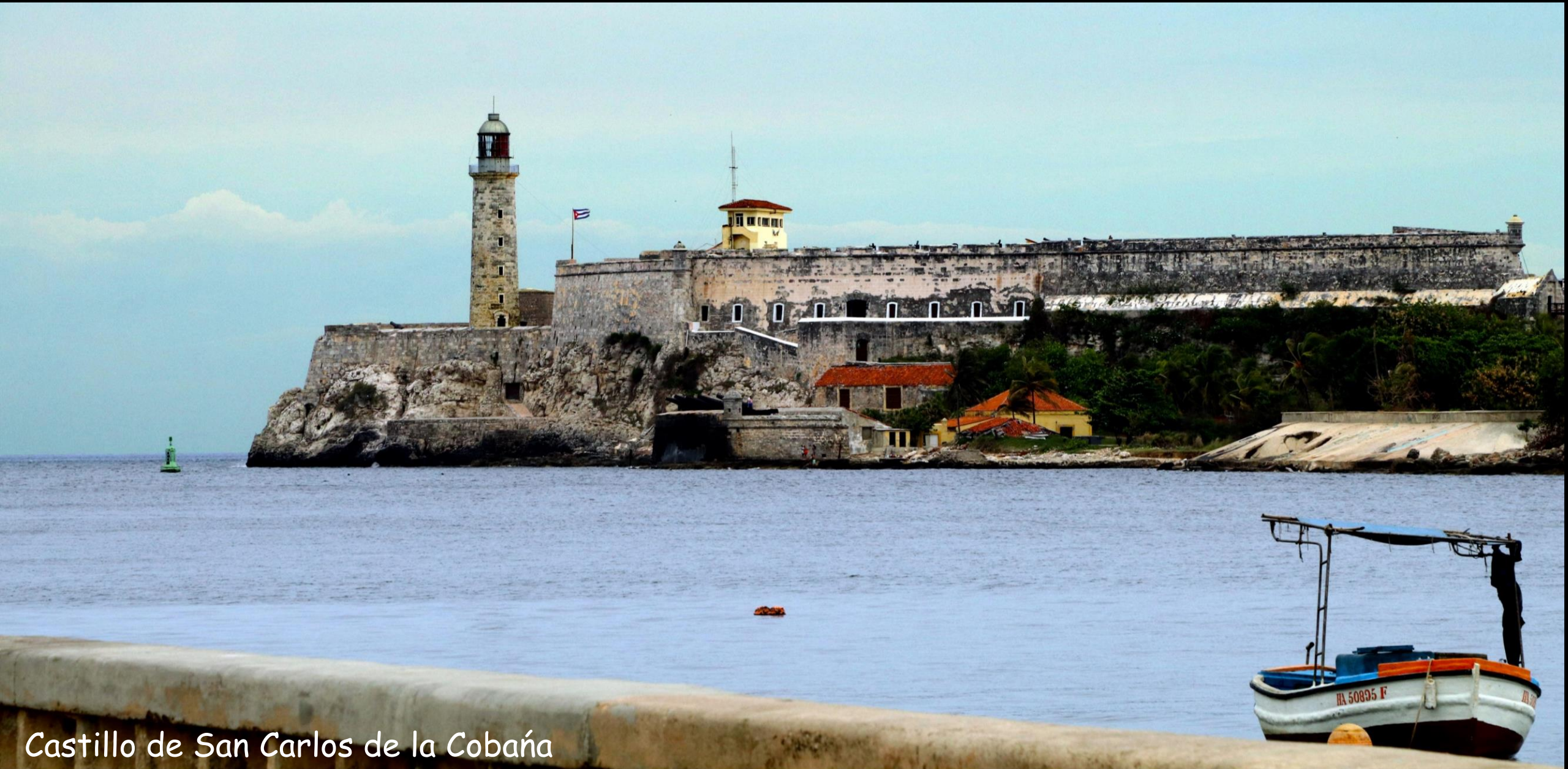
Castillo de San Carlos de la Cabaña

Havana was established as a Colonial port with harbor forts.