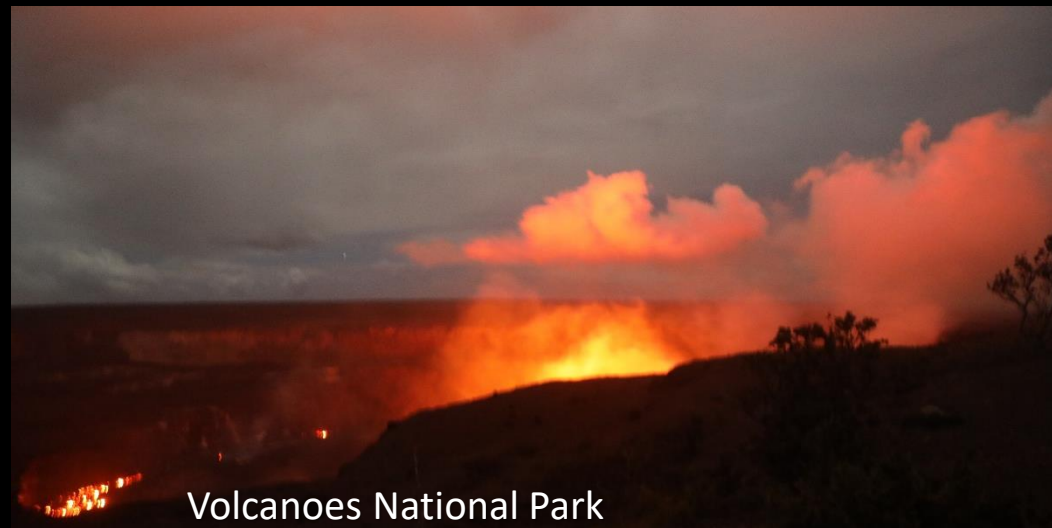
Volcanoes National Park