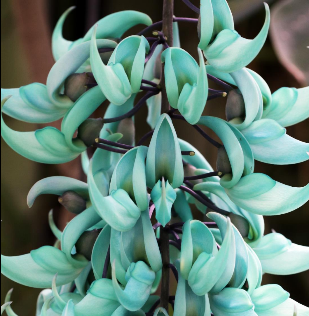
Green jade vine ( Strongylodon macrobotrys )