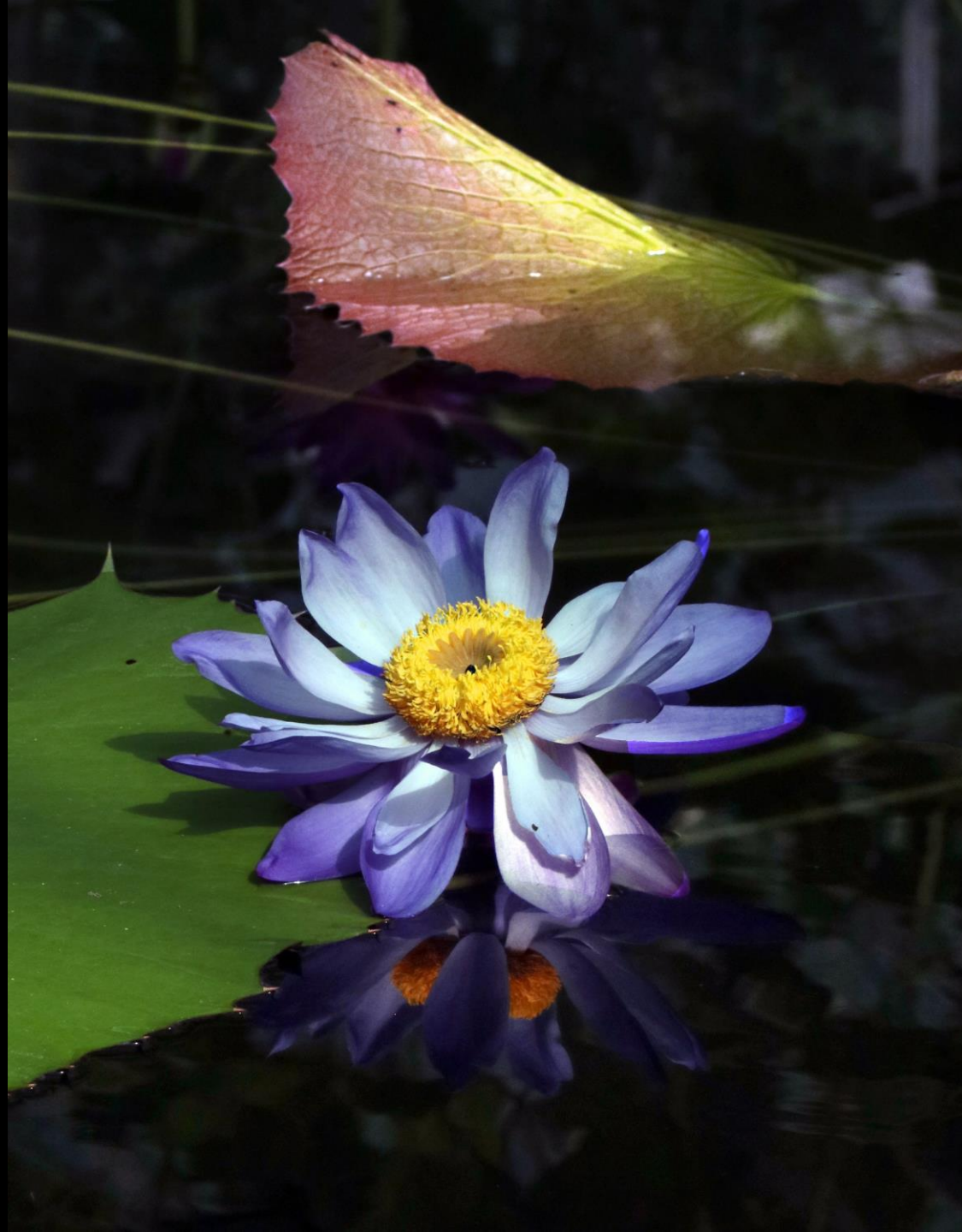
Nymphaea 'Kew's Stowaway Blues'