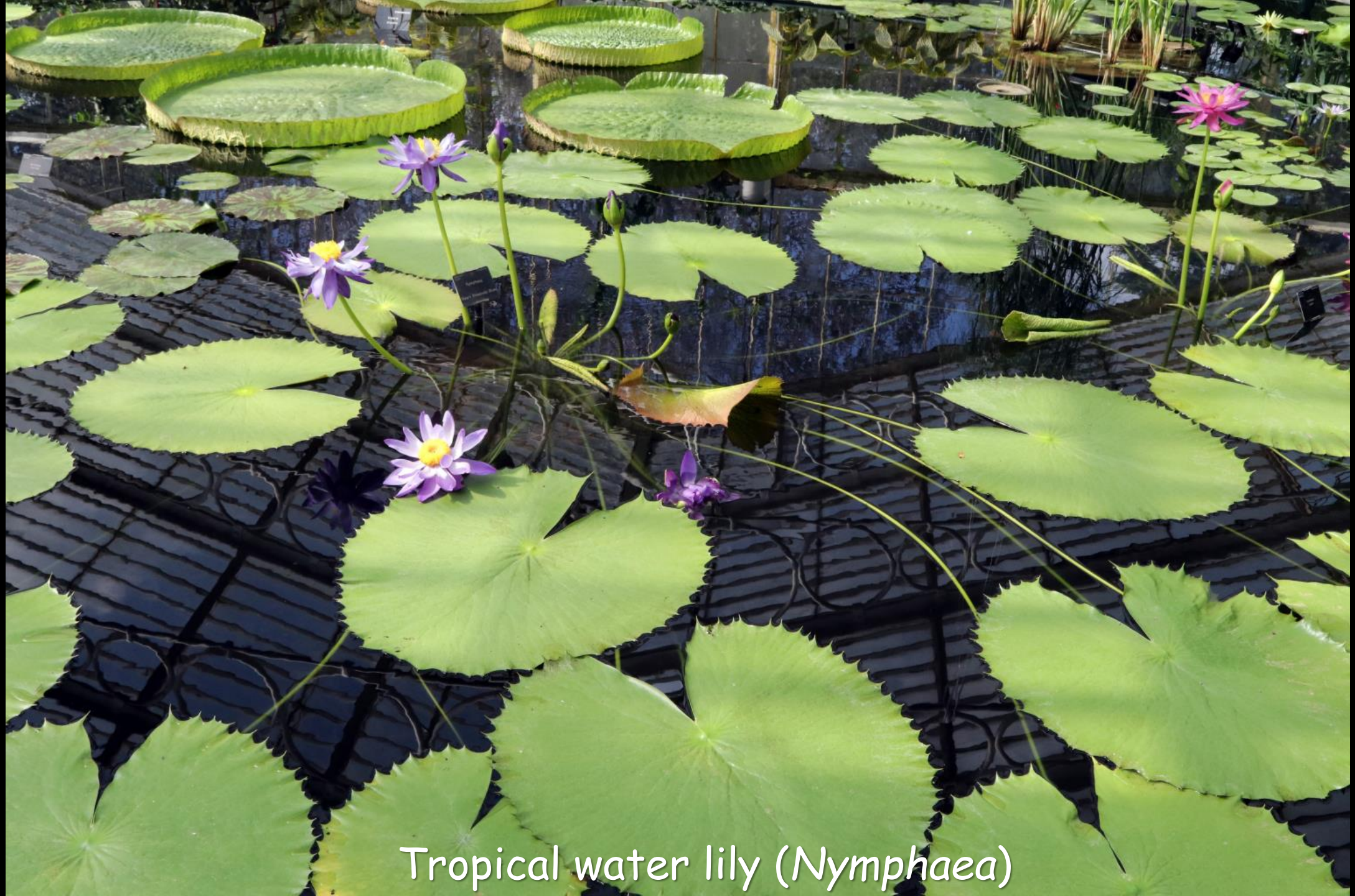
Tropical water lily ( Nymphaea )