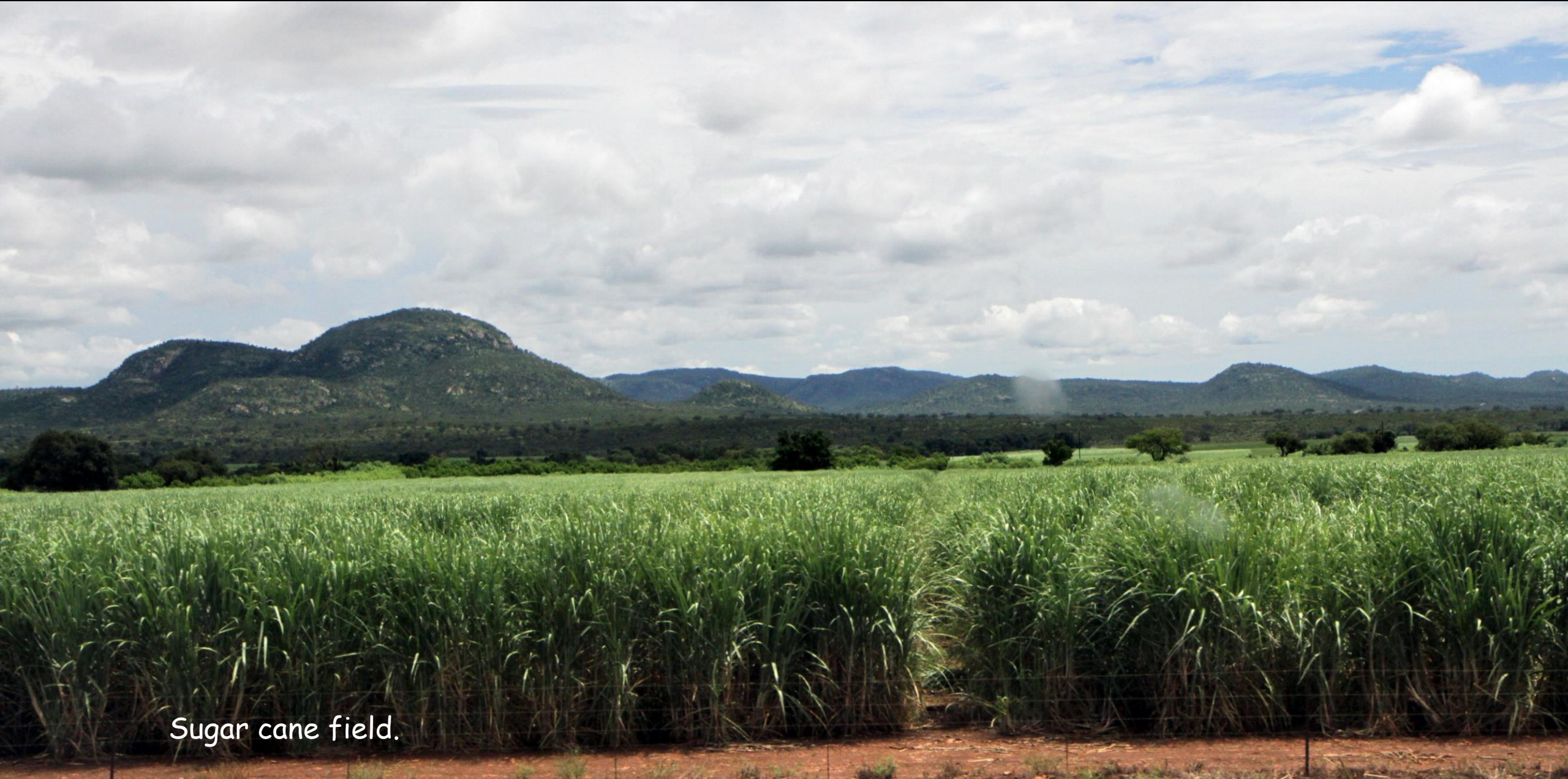
Sugar cane field.

Sugar has been historically the major agronomic crop for Cuba.