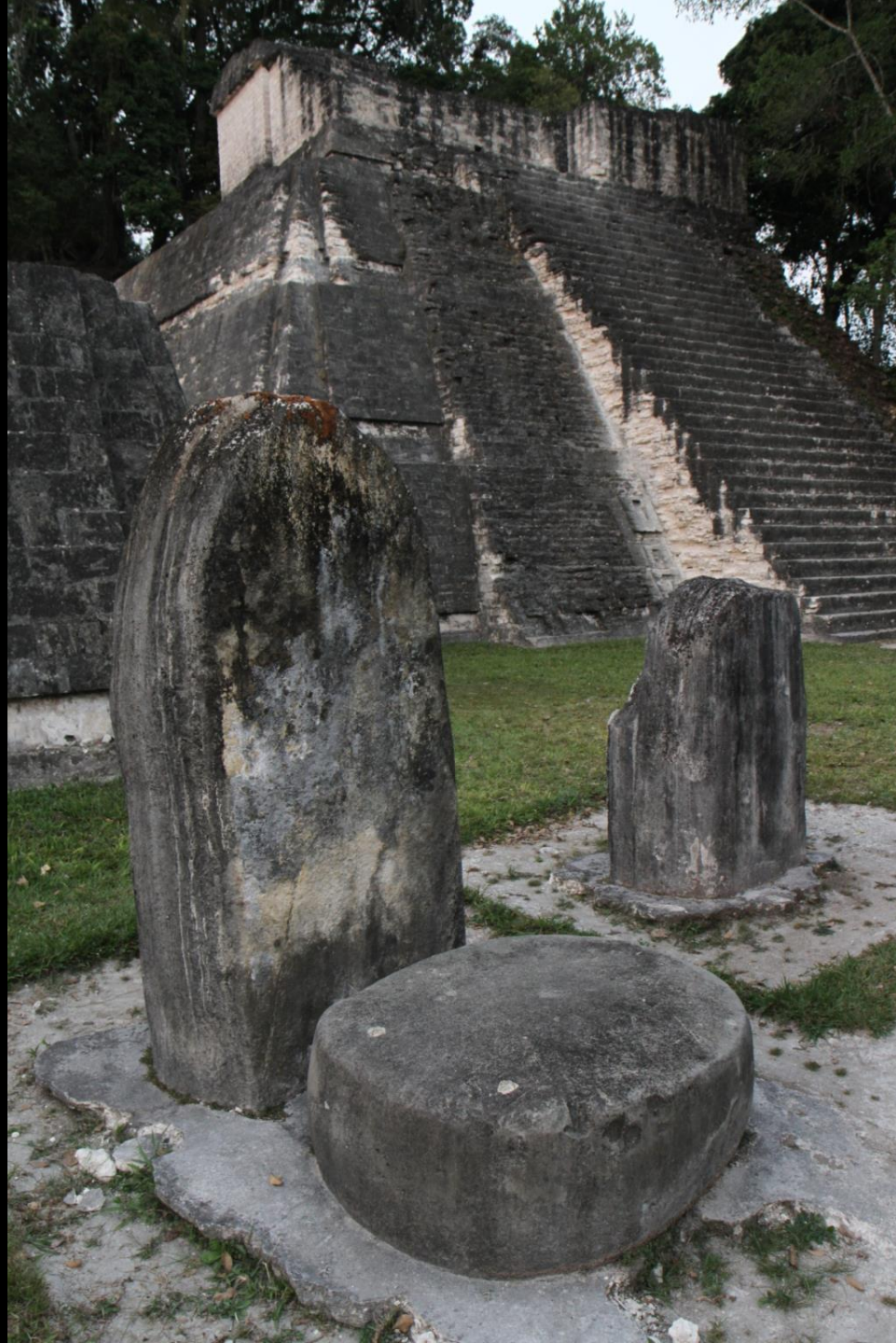
Altar and Stela