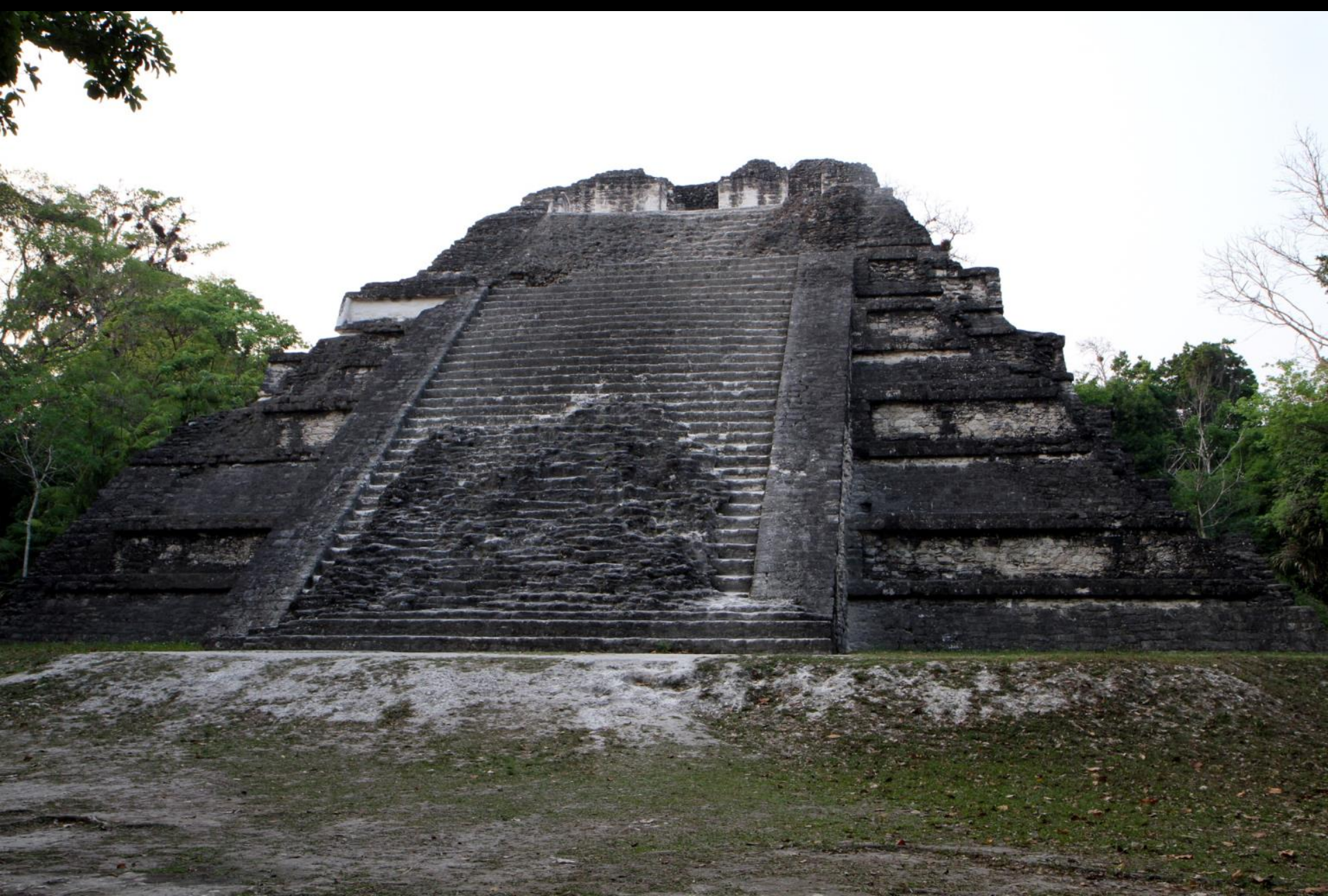
Lost World - Great Pyramid