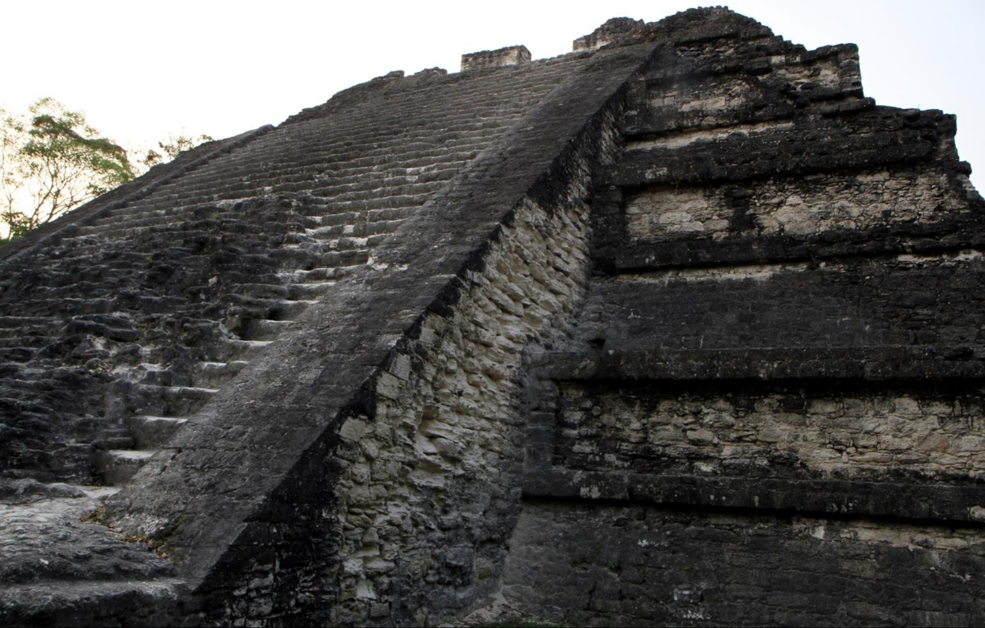
Lost World - Great Pyramid