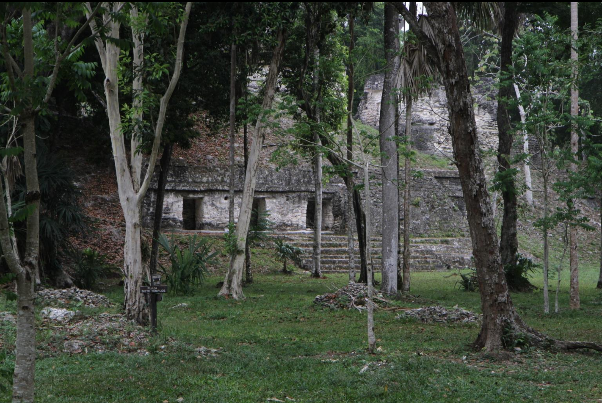
Temple VI - Inscriptions Temple