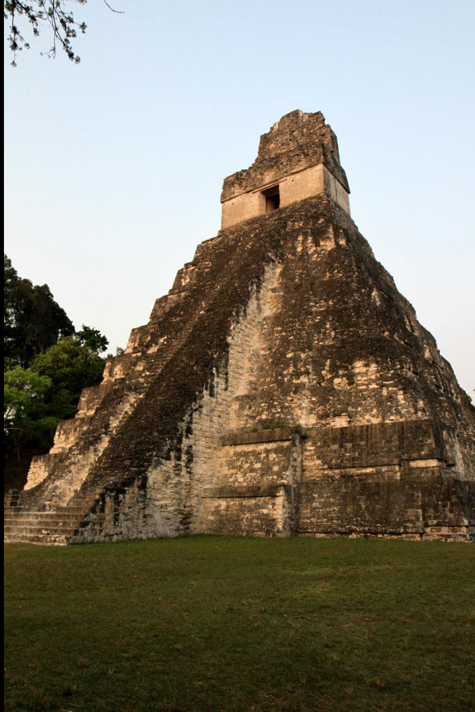
Temple I Great Jaguar