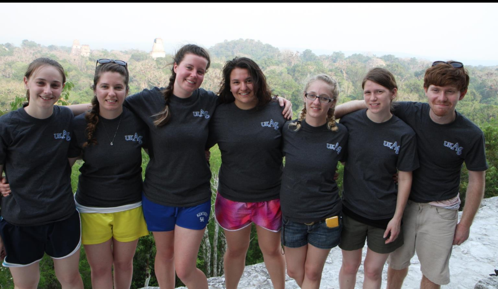
Group photo on steps of Temple IV