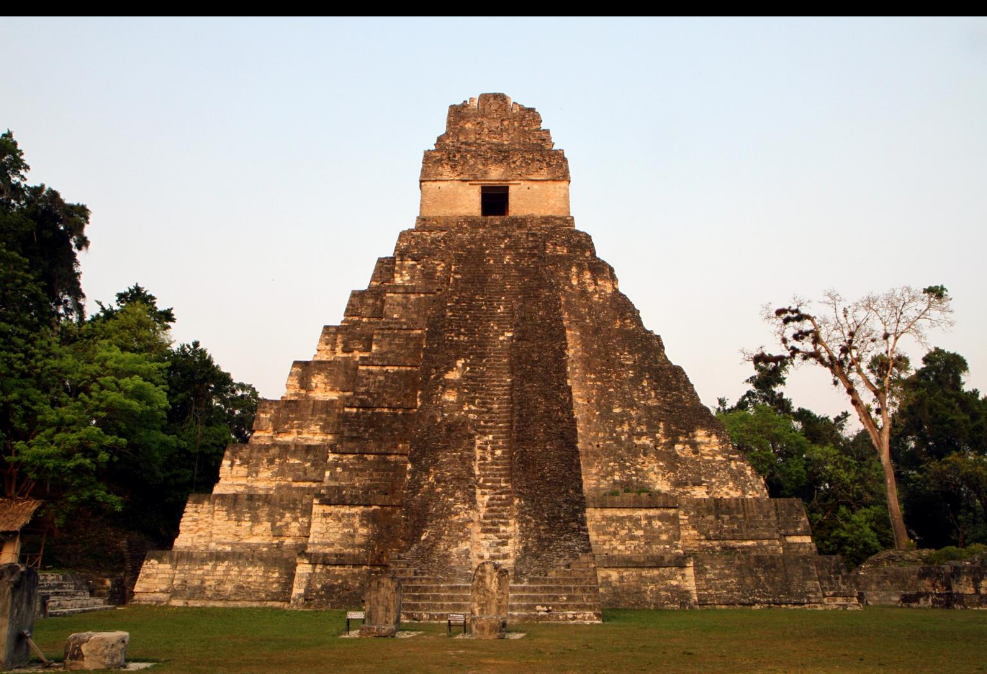
Temple I - Great Jaguar