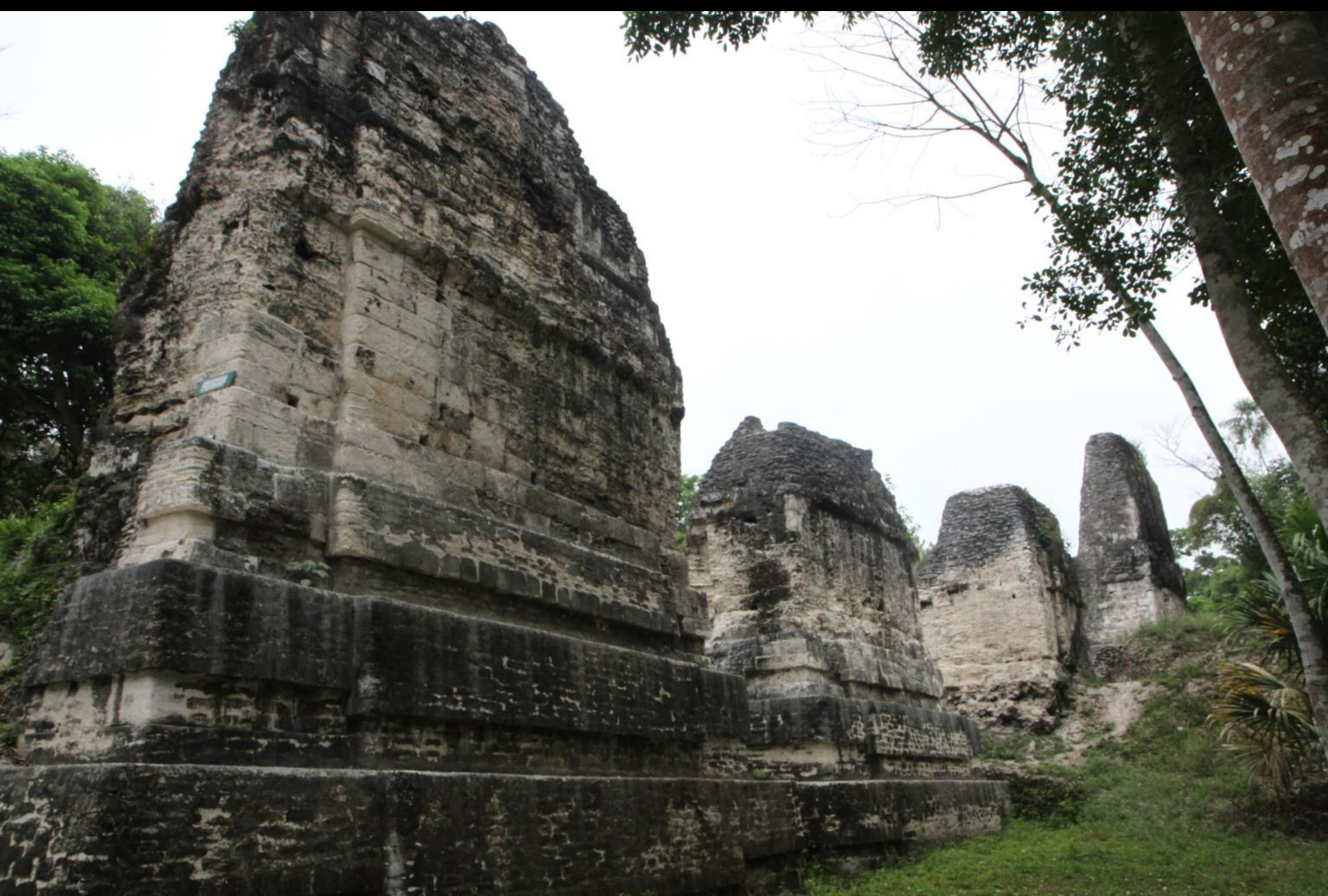
Plaza of the Seven Temples