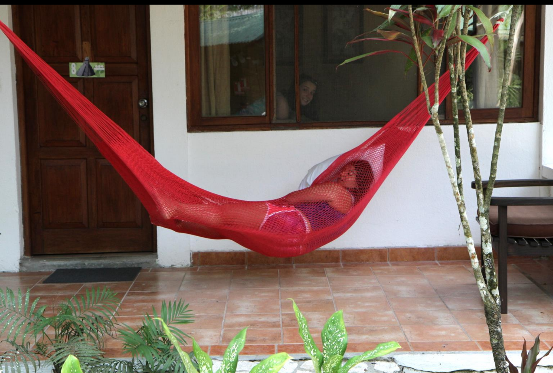
Cocooning at the Jaguar lodge in Tikal park