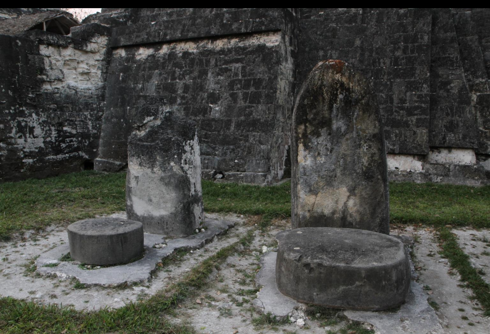
Altars and Stela