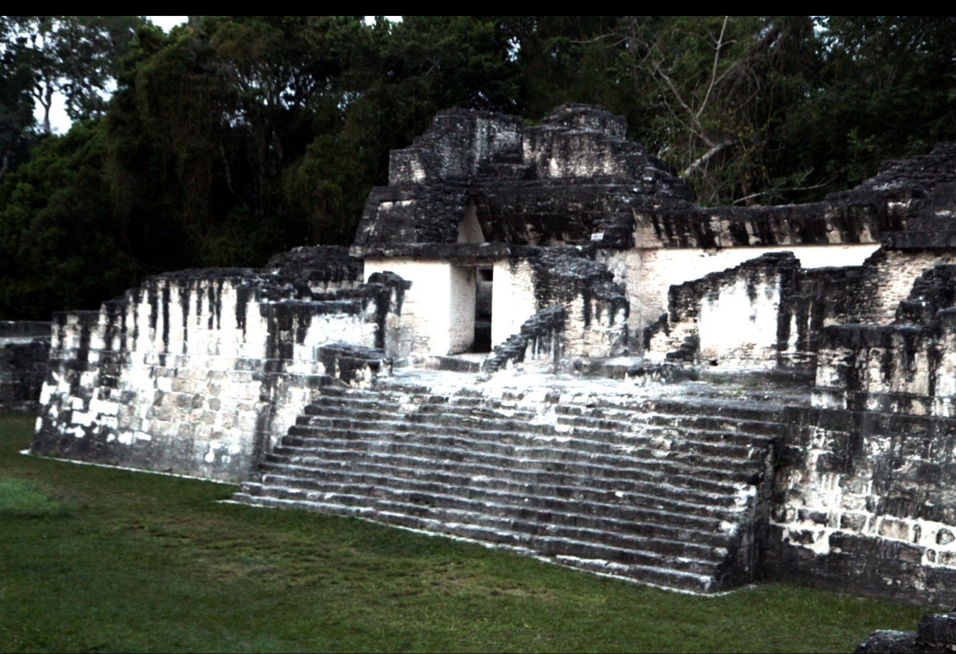
Central Acropolis - Caracol Palace