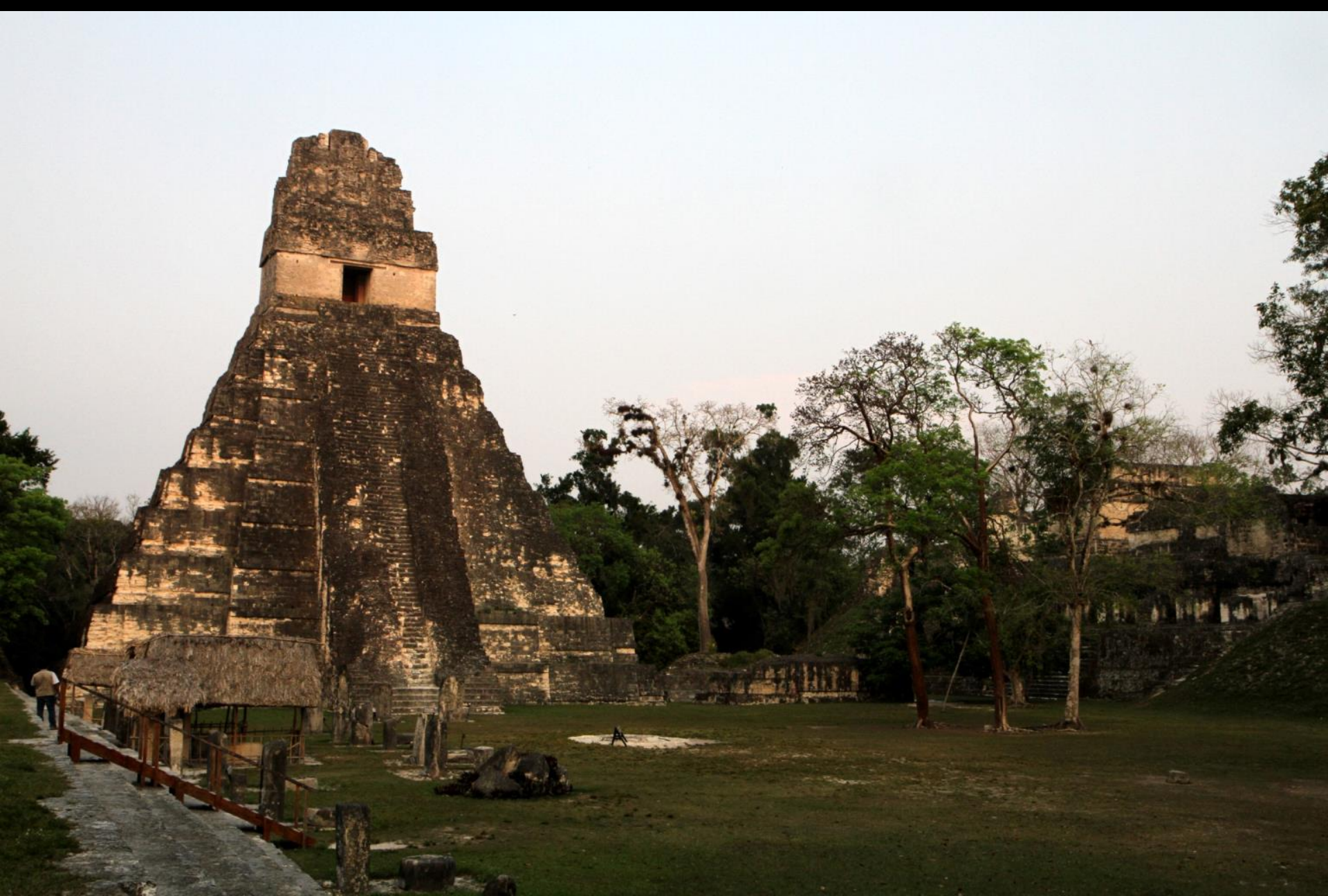
Great Plaza and Temple I