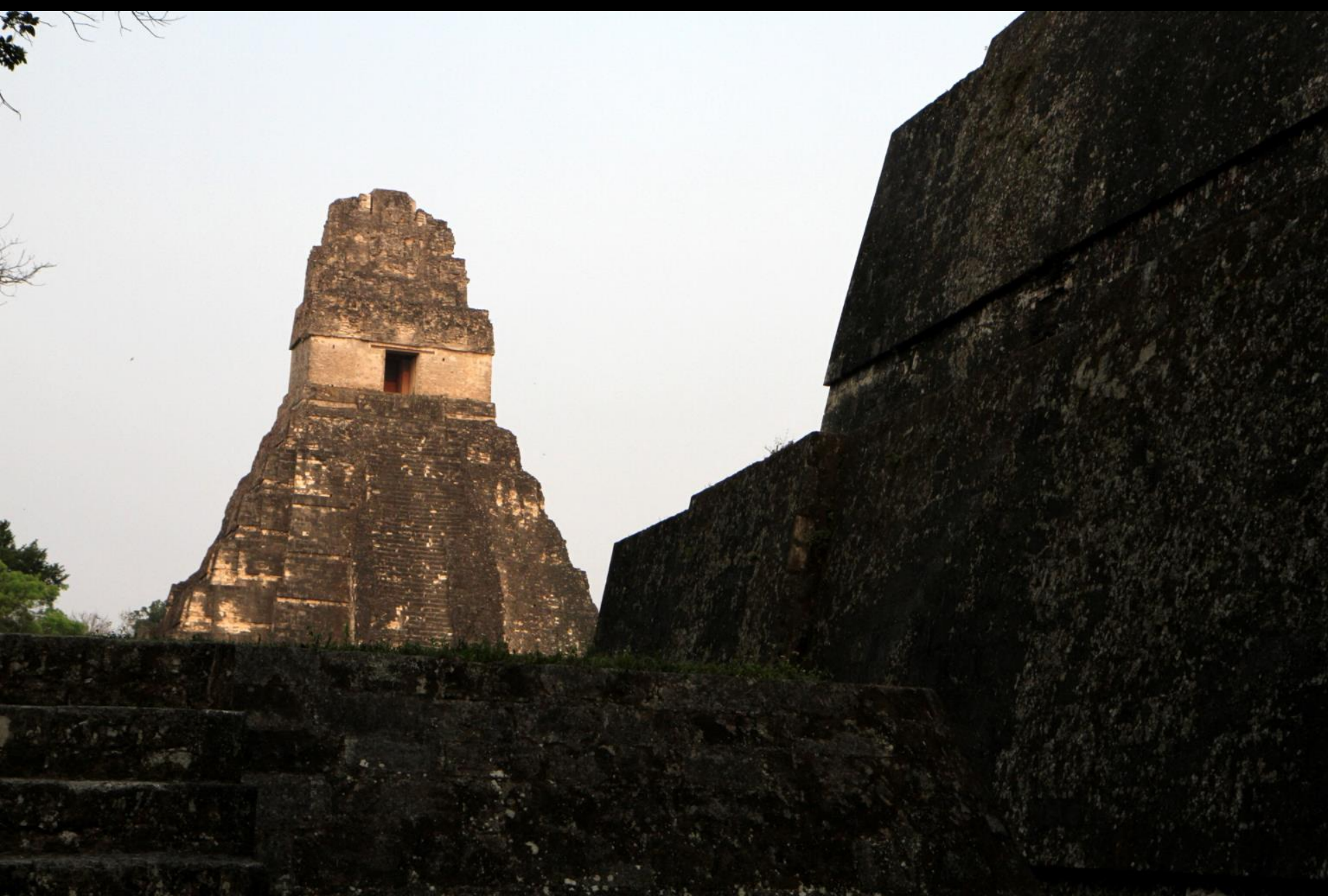
Temple I - Great Jaguar