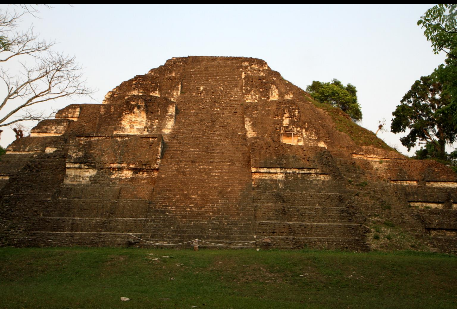
Lost World - Great Pyramid