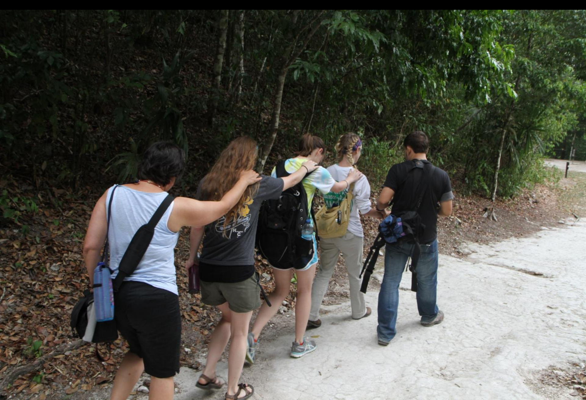
Eyes closed, walking to Temple V