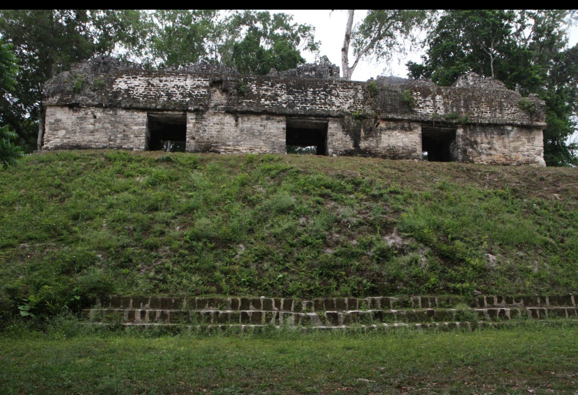
Temple VI - Inscriptions Temple