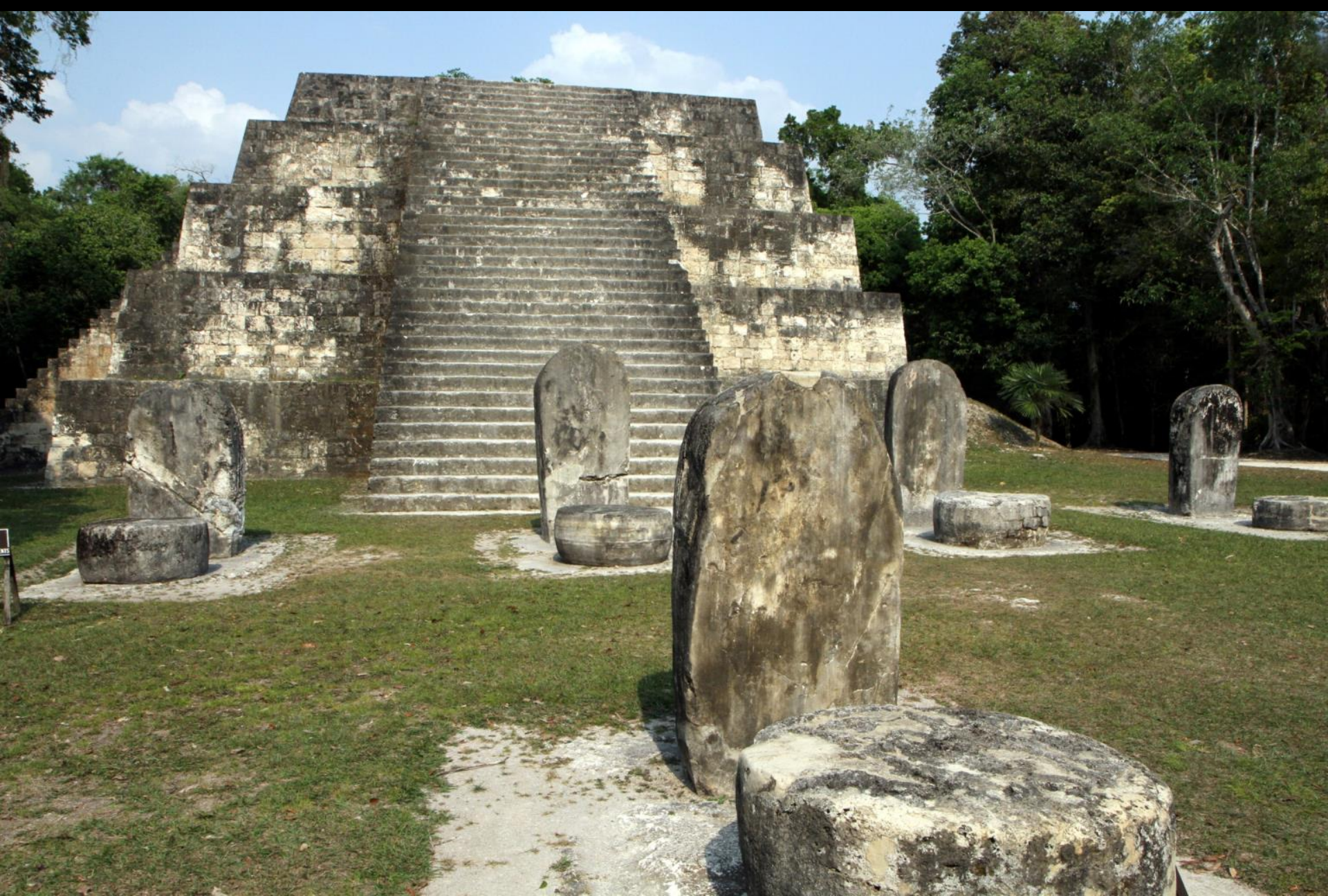
Complex Q - East Pyramid