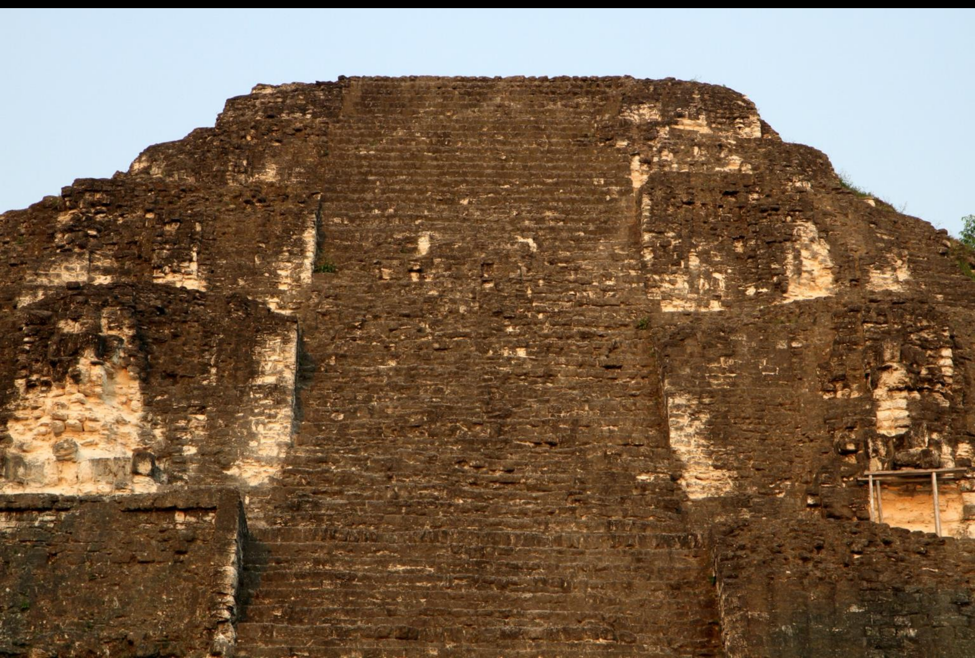
Lost World - Great Pyramid