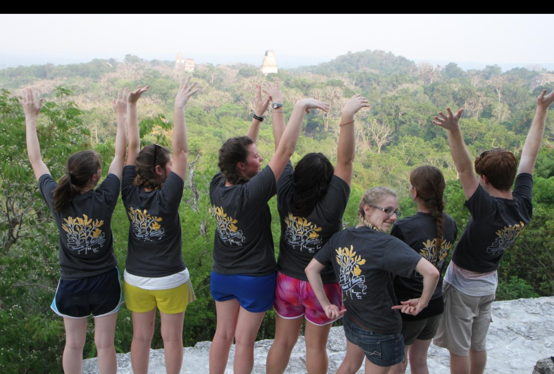
Hortclub attitude on steps of Temple IV