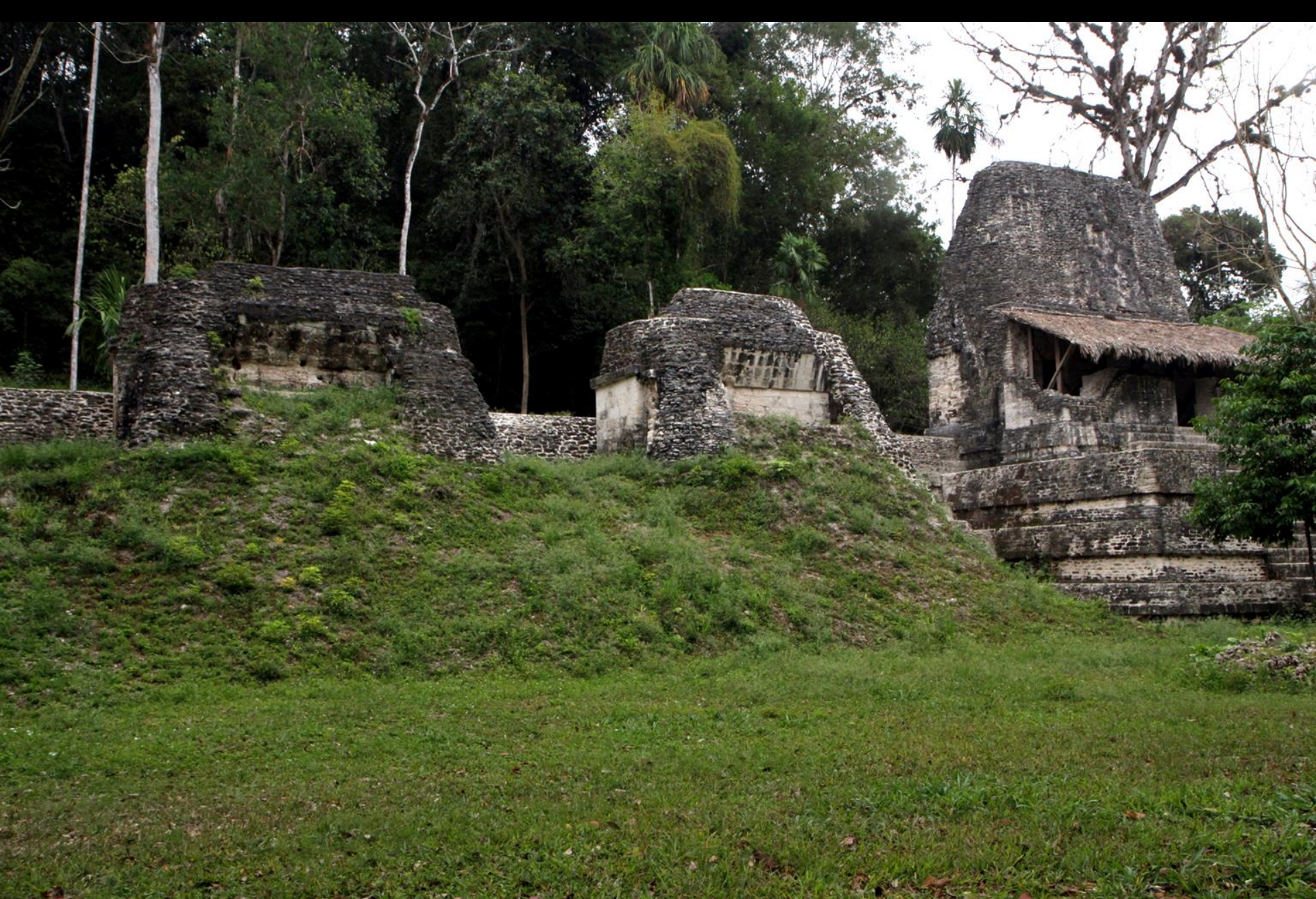
Plaza of the Seven Temples