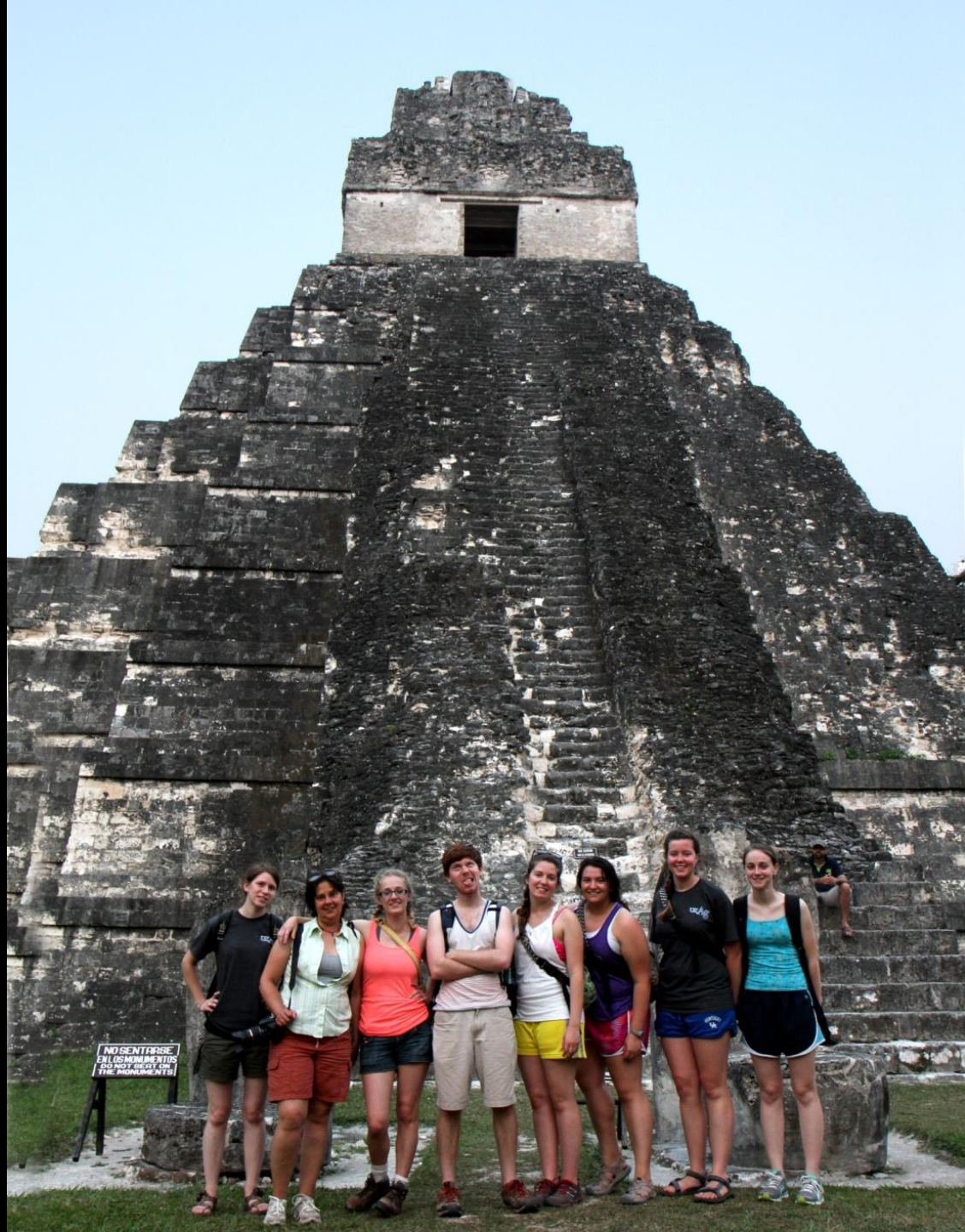
Group photo Temple I