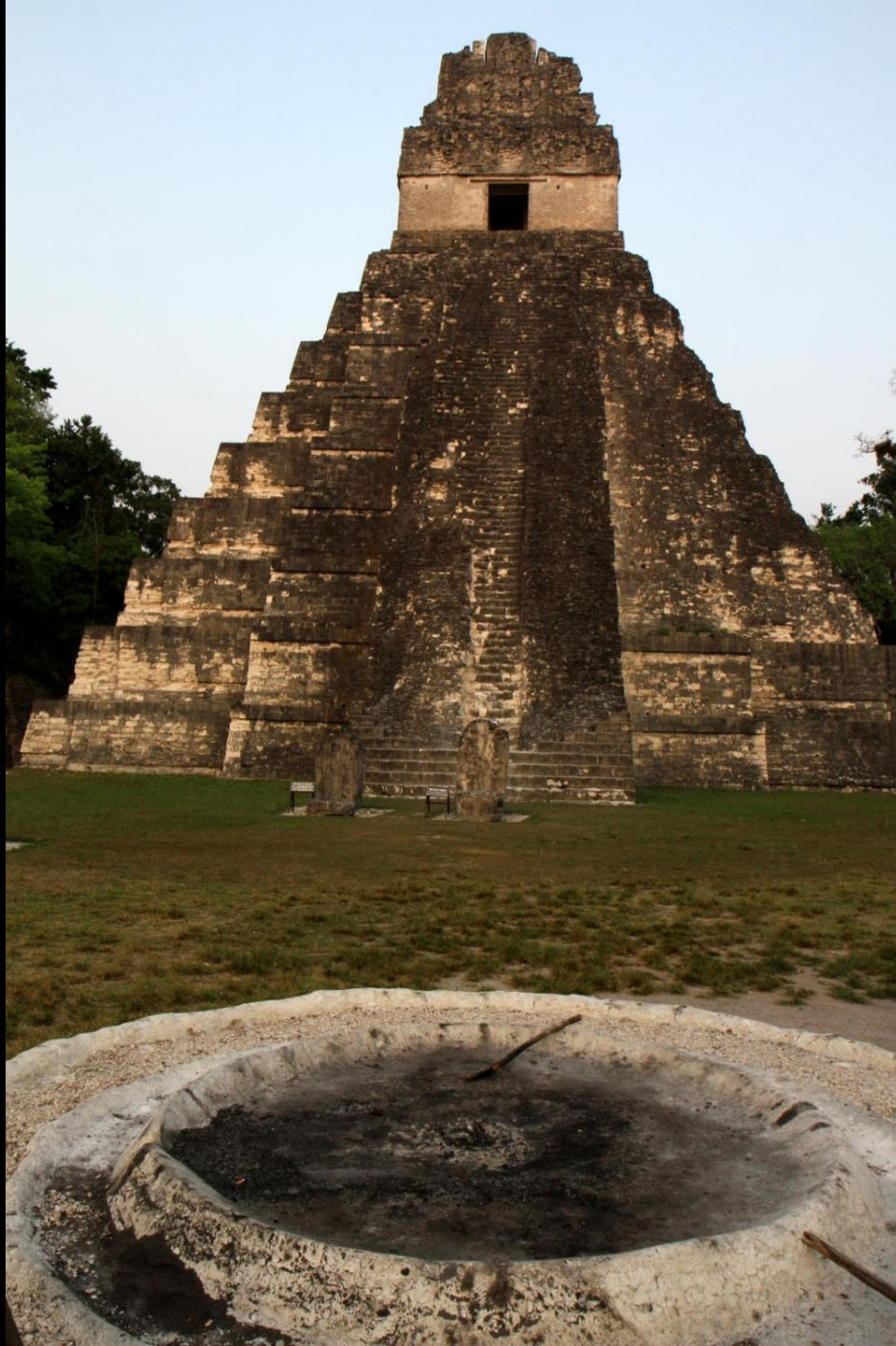
Temple I Great Jaguar