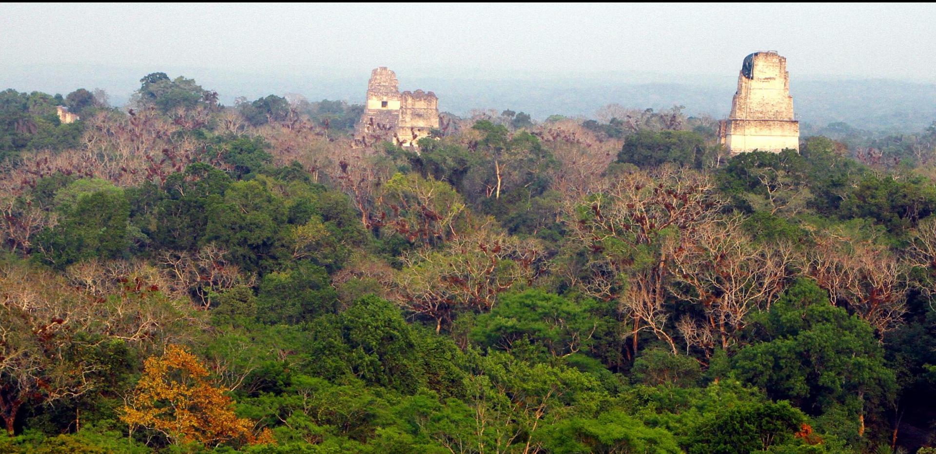
Temples I, II, and III from Temple IV