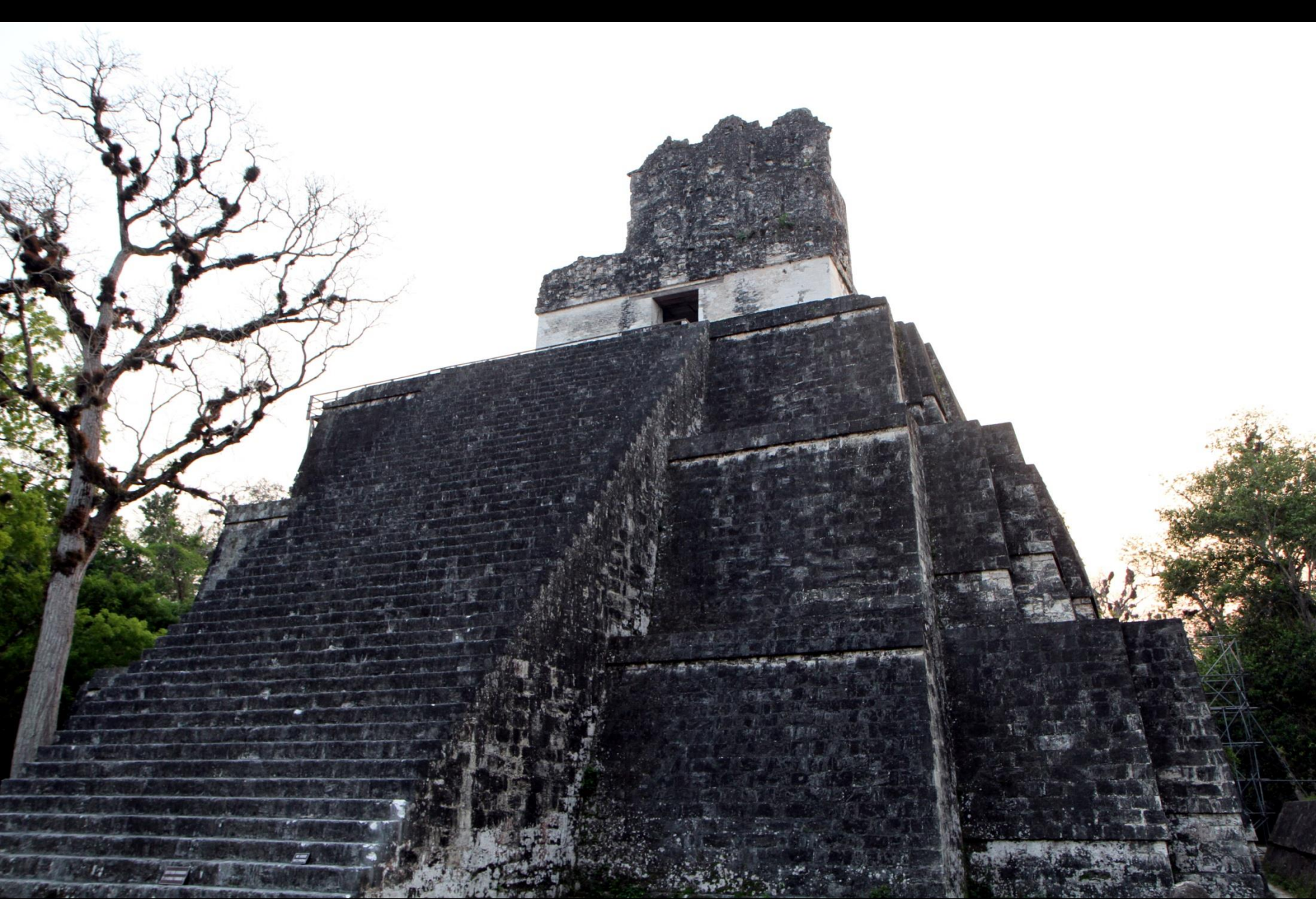
Temple II - Moon Temple