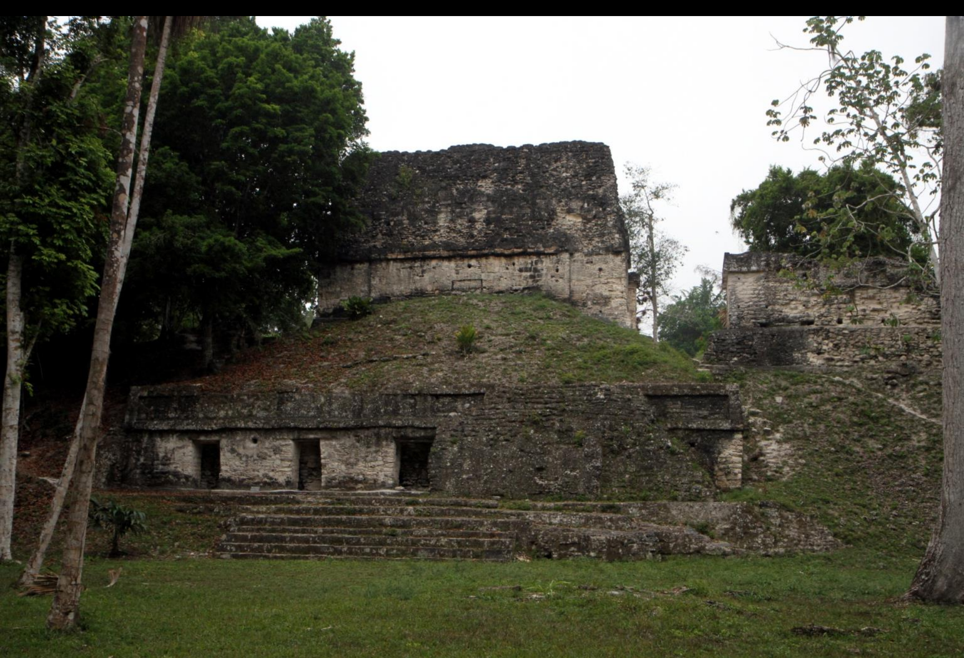
Temple VI - Inscriptions Temple