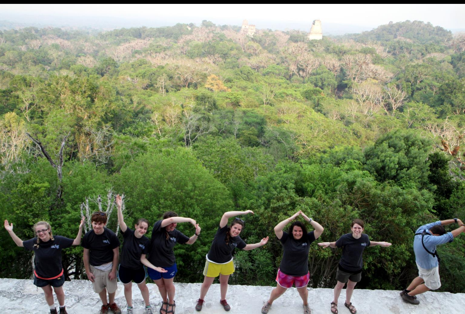
Wildcats on steps of Temple IV