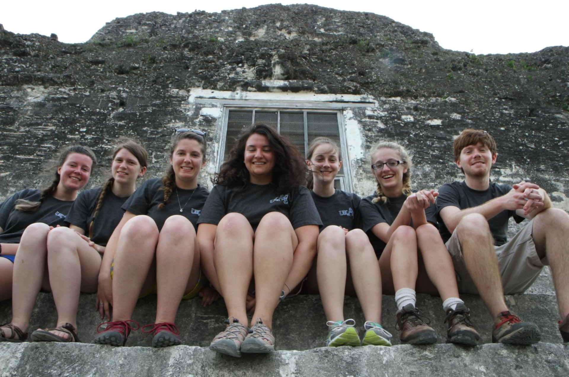
Group photo on steps of Temple IV