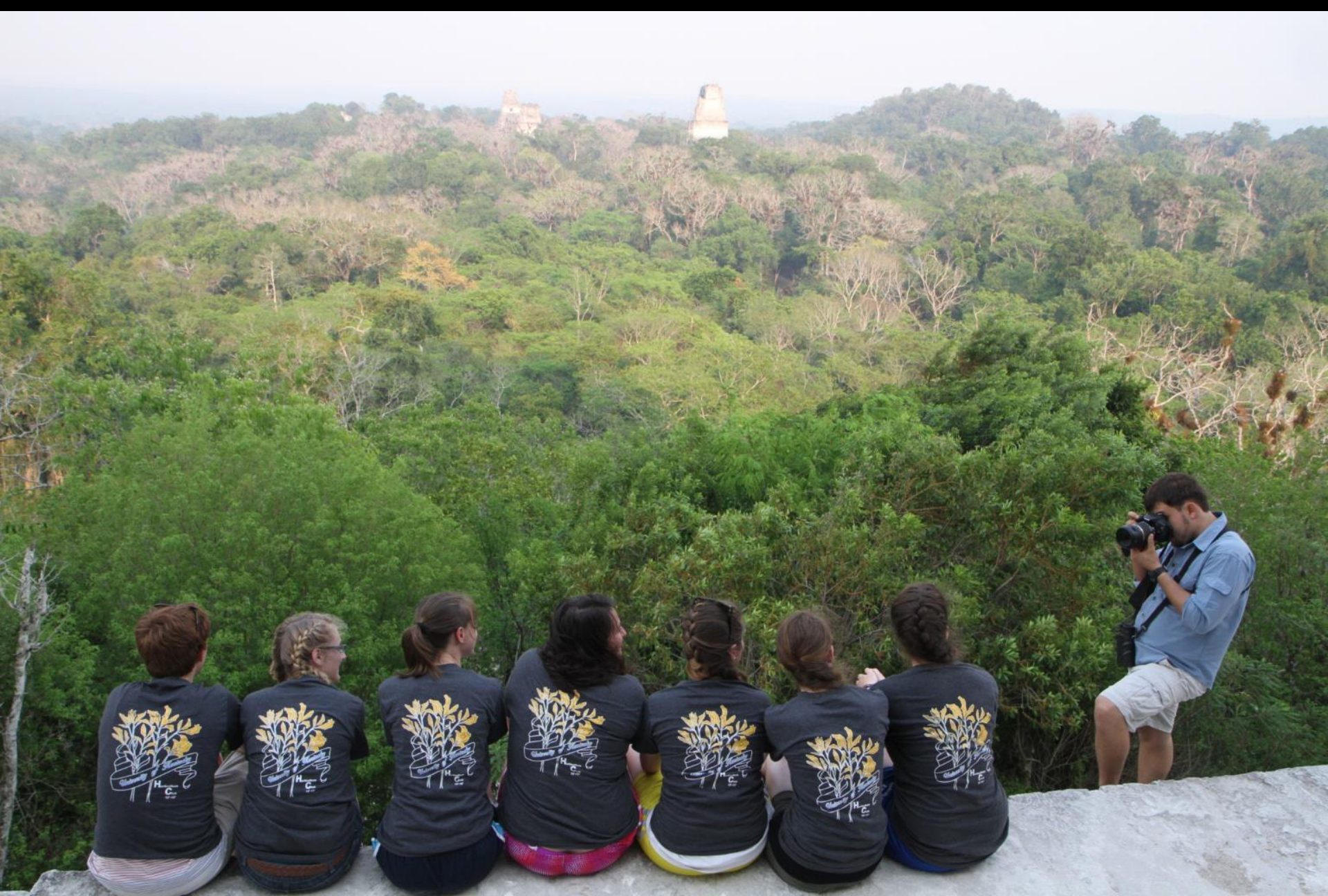
Group photo on steps of Temple IV