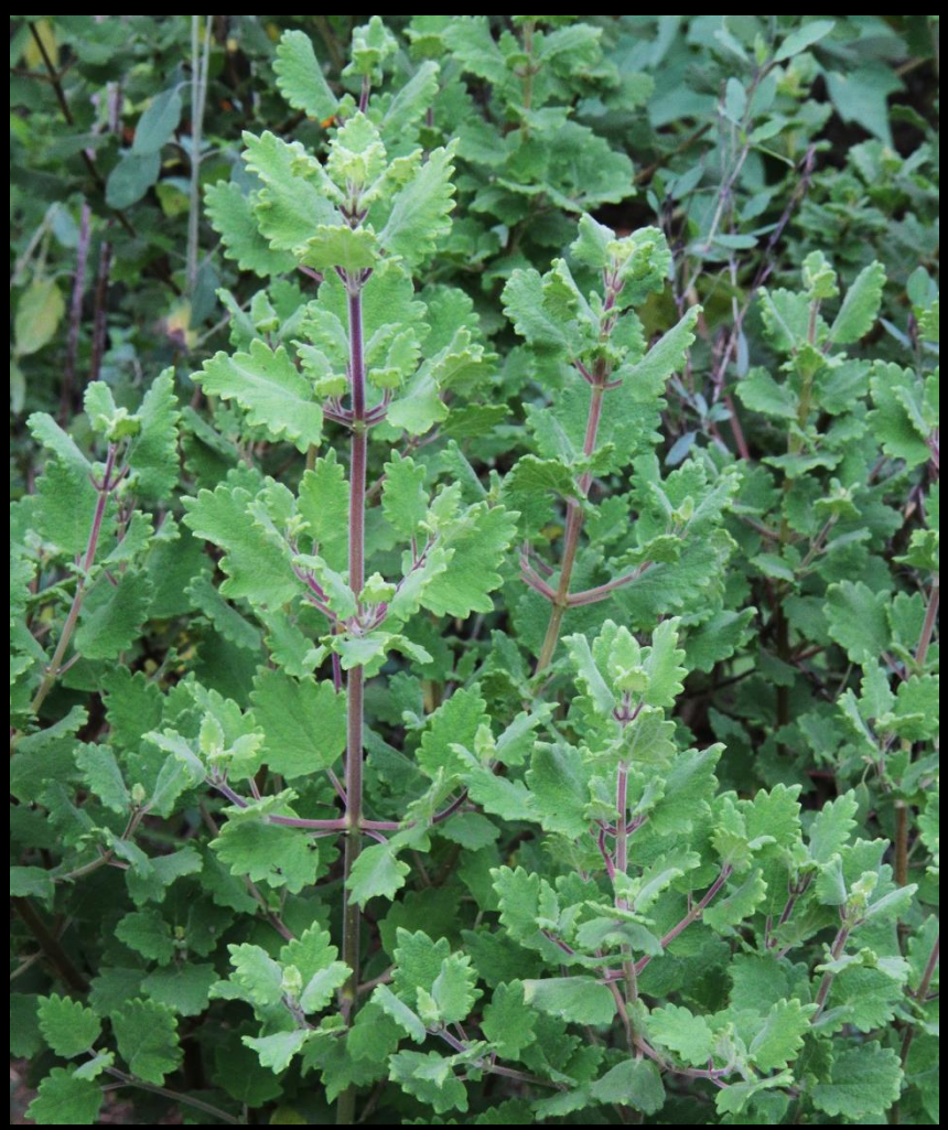
Musk bush ( Tetradenia riparia ) is an aromatic plant used as an insect repellant and for cold and flu.