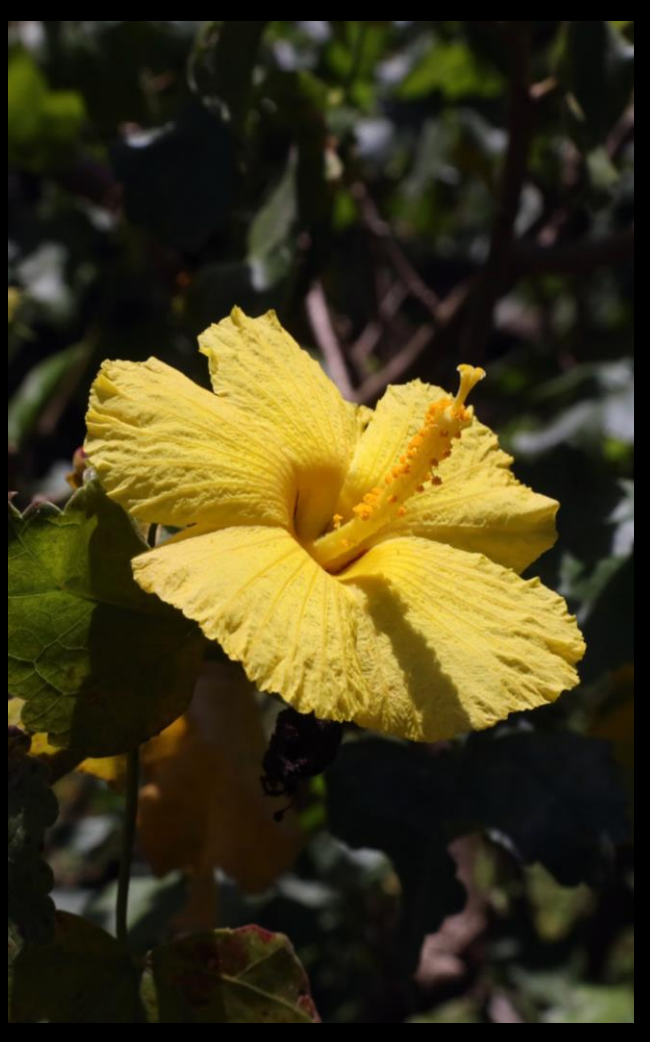
Mo'o hau hele (Hibiscus brackenridgei)