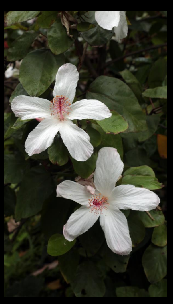
Koki'o ke'oke'o Hibiscus arnottianus