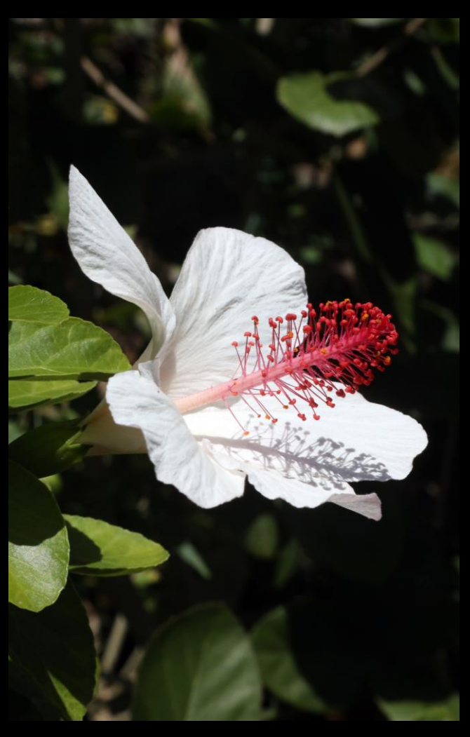
Koki'o ke'oke'o Hibiscus waimeae