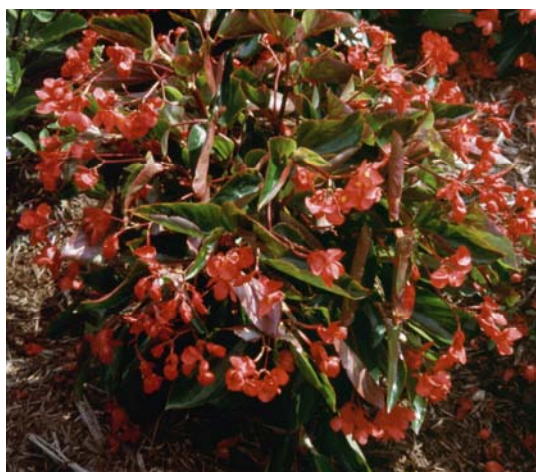
‘Dragon Wing’ Angel Wing Begonia