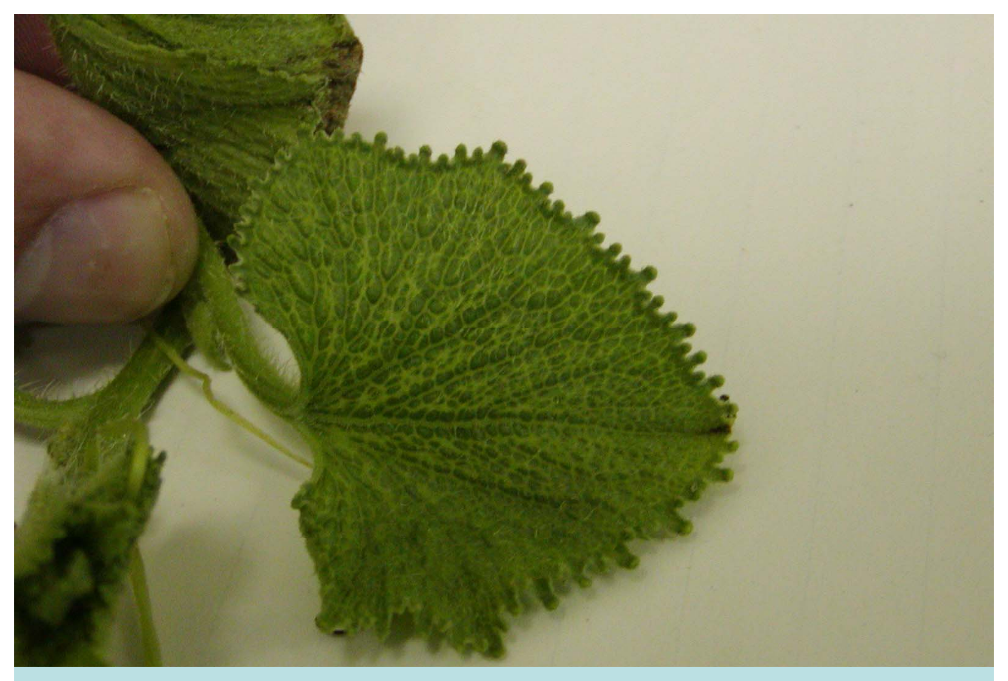
2,4-D drift injury in Cucumber