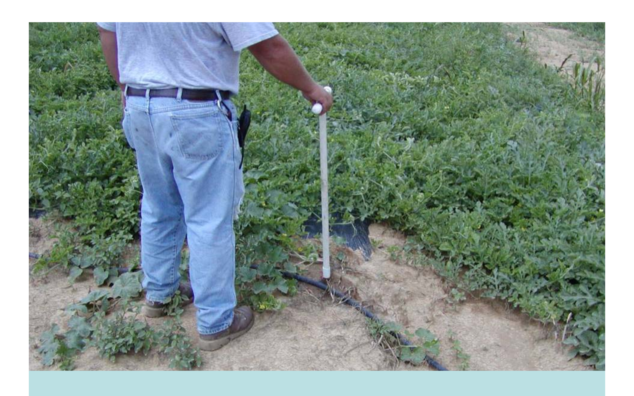
Irrigation Switch – no bending