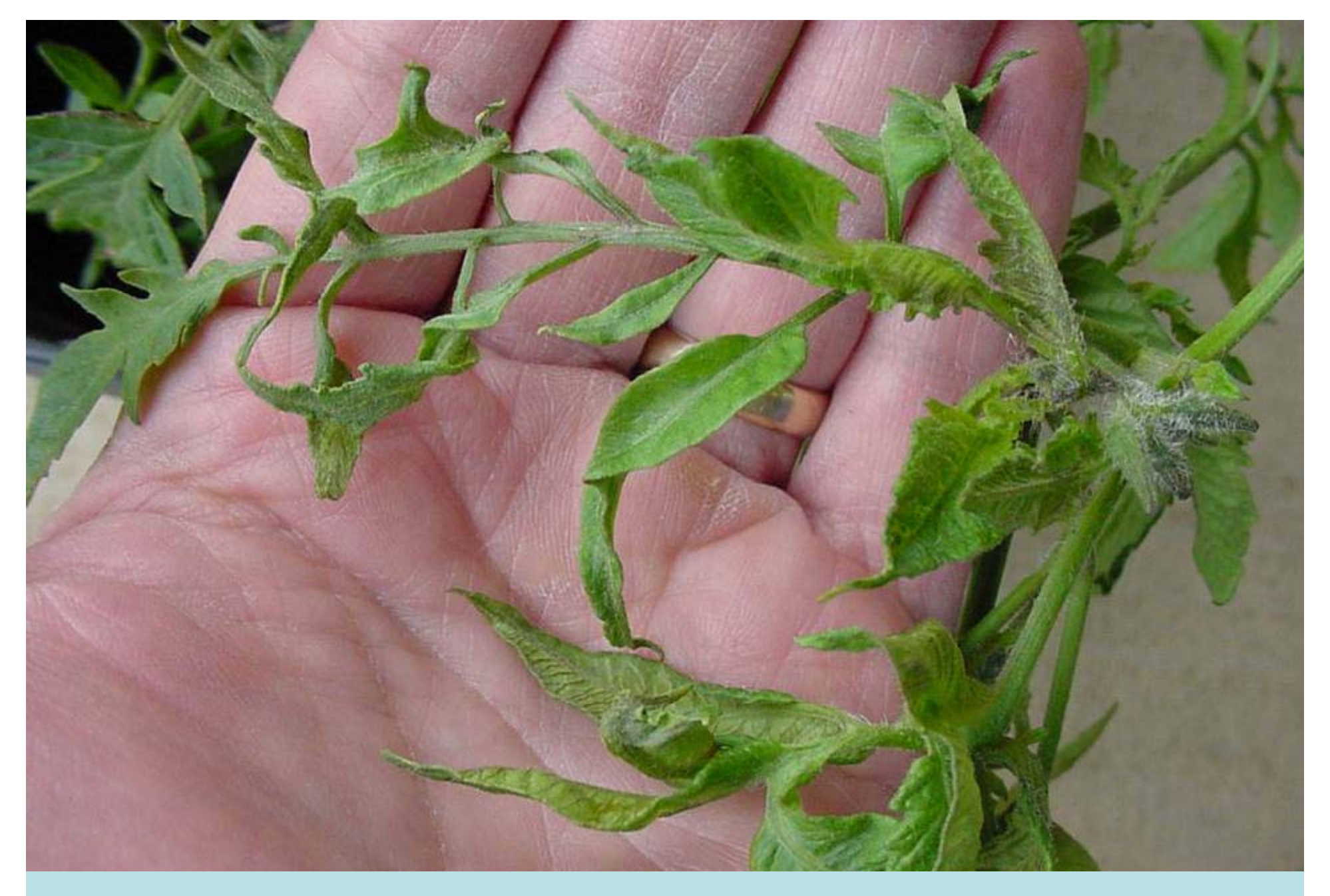
Dicamba drift injury in Tomato