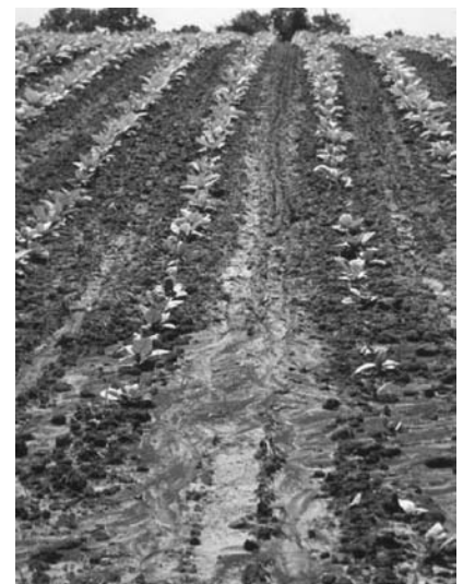
Figure 1. Severe gully erosion in conventionally prepared tobacco field.