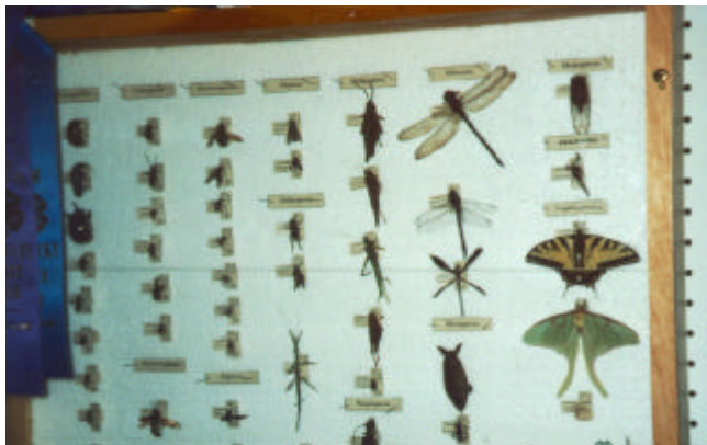
Blue ribbon insect collection from the Kentucky State Fair

available at your local library or at most large bookstores. Try to find books with good pictures that students can compare to the insects that they have collected. Older students should try to use an insect key for identification.