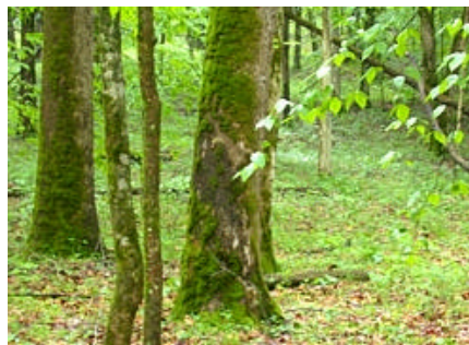
An upland forest at Mammoth Cave National Park: one of the habitats investigated during the Road Trip Across Kentucky

This summer, over two-dozen Kentucky science teachers and 4H agents took a Road Trip Across Kentucky to explore our state's tremendous ecosystem diversity. This week-long academy was designed and implemented by some of the finest environmental education experts in the state and took our teachers to Mammoth Cave, the Daniel Boone National Forest, and to several natural areas in between, providing a broad survey of Kentucky's physiographic regions.