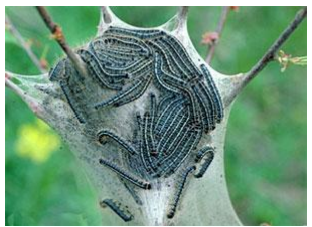
Eastern tent caterpillars

The Eastern tent caterpillar feeds on trees in the genus Prunus; black cherry is the preferred host. The hairy larvae are black with a white stripe down the center of the back. A row of pale blue spots along each side is bordered by yellowish orange lines. Full-grown larvae are about 2 ½ inches long. Defoliated trees normally leaf back out and suffer only minor growth loss.