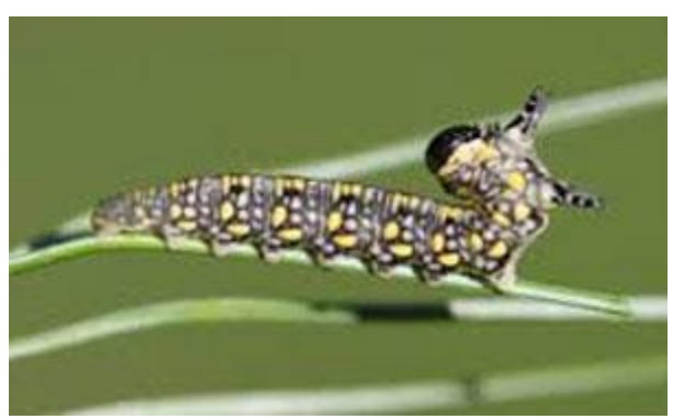
Introduced pine sawfly larva

Introduced pine sawfly has a black head and black body covered with yellow and white spots. The larvae prefer to feed on the needles of eastern white pine but also will eat Scotch, red, Austrian, jack, and Swiss mountain pine. Short leaf and Virginia pines have been attacked but usually are not heavily damaged.