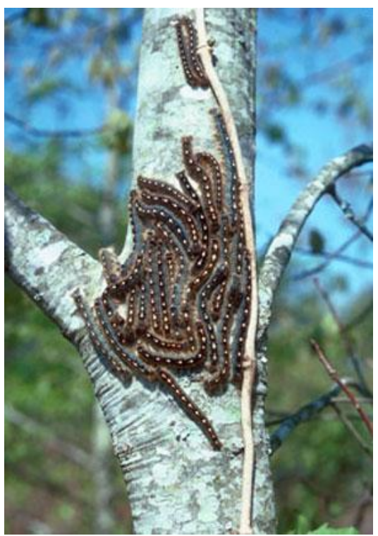
Forest tent caterpillars

Forest tent caterpillars are very similar to eastern tent caterpillars but have a row of light keyhole-shaped spots down the center of the back rather than a stripe. They feed on a wide range of trees including sweetgum, oak, birch, ash, maple, elm and basswood. Like the eastern tent caterpillar, there is one generation in the spring.