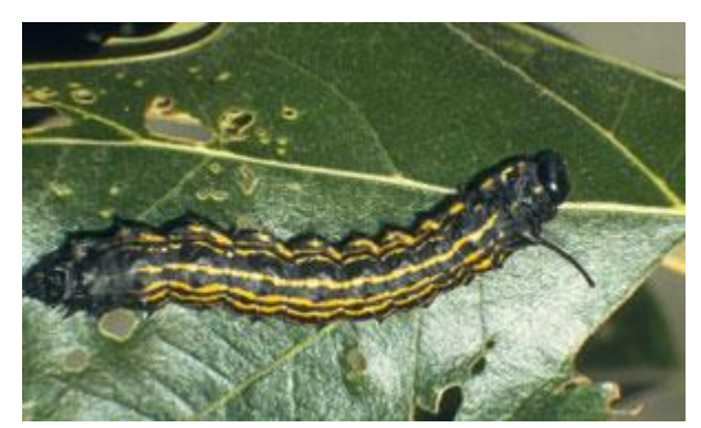
Orangestriped oakworm

Orangestriped oakworm is black with eight narrow yellow stripes along the length of the body. They have a distinctive pair of long, curved "horns" behind the head. They can rapidly strip leaves from small trees but the defoliation usually occurs late in the summer or into the fall, their economic impact is relatively minor.