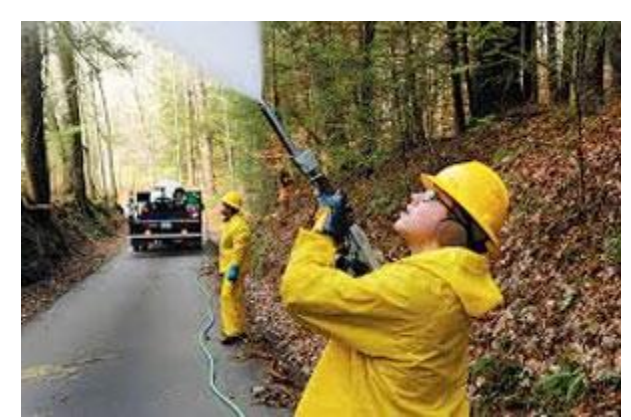
Spraying insecticidal soap to control hemlock woolly adelgid

Insecticidal soap sprays must come into direct contact with the target pest and often results are best against specific life stages. Timing and thorough spray coverage are essential for best results. If the vulnerable stage is active over a long period of time, several applications are needed to control most insects.