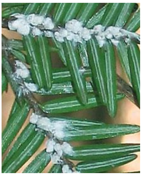
Hemlock woolly adelgid cottony egg sacs (nps.gov)

Established infestations of the hemlock woolly adelgid (HWA) were discovered at specific locations in Harlan, Letcher, and Bell counties in 2006. This native of Asia is a 1/32 inch long reddish purple insect that lives within its own protective coating. White, woolly masses that shelter these sap-feeding insects are at the bases of hemlock needles along infested branches. The presence of these white sacs, which resemble tiny cotton balls, indicate that a tree is infested.