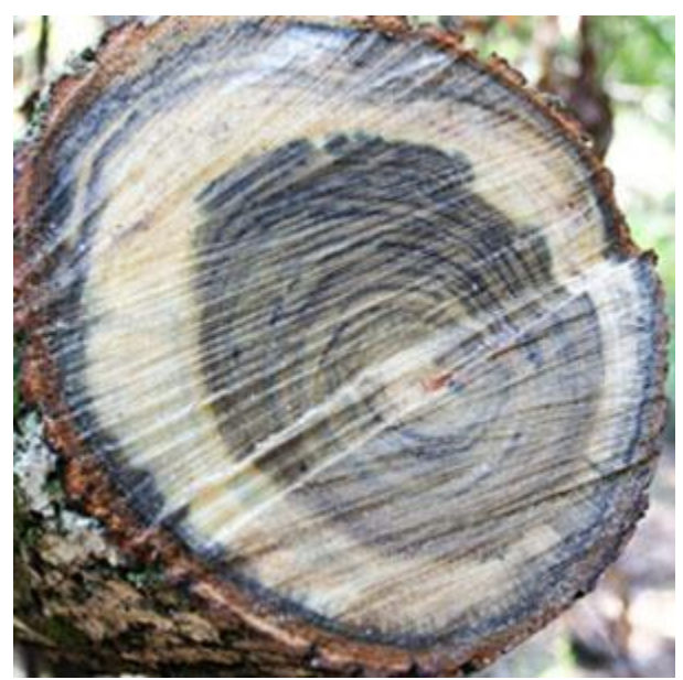
Stained sapwood is an indication of ambrosia beetle attack (entne.dept.ufl.edu)

Some bark beetles (ambrosia beetles) carry a fungus with them that grows within their galleries in the tree. These bark beetle larvae bore in the tree but feed on the fungal growth. The fungal growth clogs the vascular system of the tree and causes death.