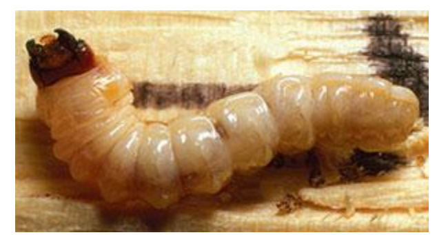
Pine sawyer larva – a round headed borer

Adult male (left) and female (right) of the pine sawyer, a round headed wood borer