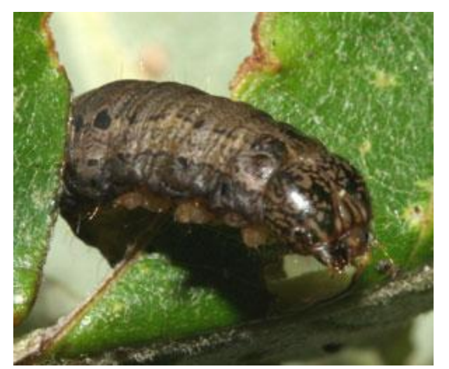
Common oak moth caterpillar

The Common oak moth caterpillar is brown with tan to black blotches on the sides; there are diamond-shaped markings and slanted lines on its back. This caterpillar moves in a looping manner and is about 1¼ inches long when mature. There is one generation each year with the caterpillars active from May to June. Common oak caterpillars seem to be able to feed on many kinds of oaks but prefer white oaks. In many cases, trees can be severely or completely defoliated. While a single defoliation should not adversely affect established, healthy trees, previous droughts or other stresses can increase the impact of this damage.