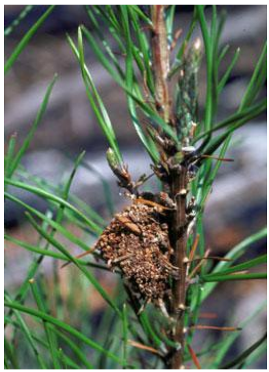
Pine webworm damage

Pine webworm larvae are yellowish brown with two dark brown longitudinal stripes on each side. Young 12 larvae mine needles, while older larvae live in silken tubes that extend through webs of globular masses of