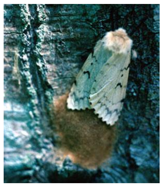
Gypsy moth female with egg mass

The gypsy moth is established in Ohio, West Virginia, Virginia, and Tennessee. Older larvae have yellow markings on the head, a brownish-gray body with tufts of hair on each segment, and a double row of five pairs of blue spots followed by a double row of six pairs of red spots on the back. Moths are harmless, but the caterpillars from which they develop are voracious leaf feeders of forest, shade, ornamental and fruit trees and shrubs. Large numbers of caterpillars can completely defoliate an area. A single defoliation can kill some softwoods, but it usually takes two or more defoliations to kill hardwoods.