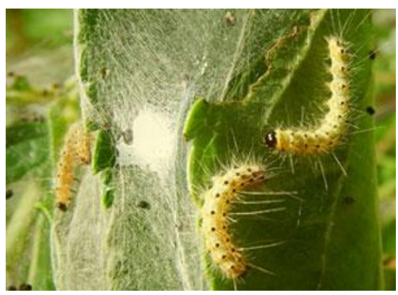
Fall webworm

Fall webworm is a hairy pale green to yellow caterpillar that is about one inch long when full grown. There are two or generations per year. Webworms enclose leaves and small branches in light gray, silken webs. They feed on more than 100 tree species.