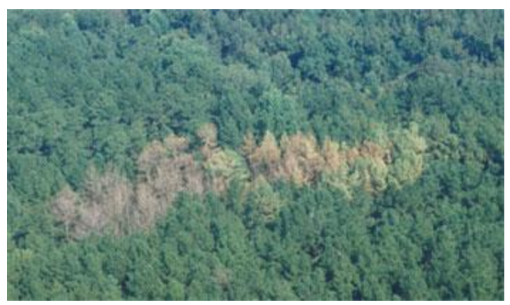
Trees typically die in a directional pattern from southern pine beetle attack

Bark beetles use trees as breeding sites and have an important natural role in killing weak or old trees or aiding the decomposition of dead wood. Odors from damaged trees attract bark beetles so initial attacks in an area often occur on stressed or injured trees. Beetles that develop in these trees emerge through small round holes in the trunk and move to other trees in the area.