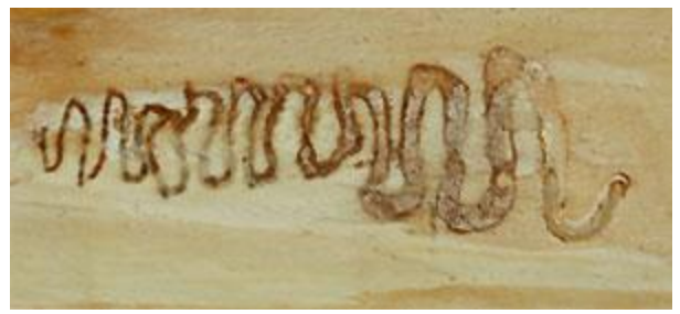
Distinctive serpentine gallery of the emerald ash borer

The emerald ash borer is a dark metallic green beetle about in color, 1/2 inch in length and 1/16 inch wide, that is May until late July. Larvae are creamy white in color and are found under the bark. The borer's host range is limited to species of ash trees. Usually, they go undetected until the trees show symptoms of infestation – typically the upper third of a tree will die back first, followed by the rest the next year. This is often followed by a large number of shoots or sprouts arising below the dead portions of the trunk. The adult beetles typically make a D-shaped exit hole when they emerge. Tissue produced by the tree in response to larval feeding may also cause vertical splits to occur in the bark. Distinct S-shaped tunnels may also be apparent under the bark.