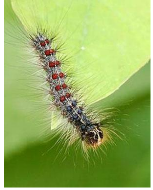
Gypsy moth larva