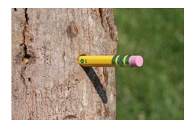
If a pencil can be inserted into an exit hole, it is a good indication that the hole was made by a cerambycid beetle (like the ALB) because the larvae feed deep in the xylem.

Asian longhorned beetle (ALB) is an invasive insect that feeds on a wide variety of trees in the US, eventually killing them. The beetle is native to China and the Korean Peninsula and is in the wood-boring beetle was discovered in Ohio in June 2011. Known hosts include trees in the following genera Ash ( Fraxinus ), Birch ( Betula ), Elm ( Ulmus ), Golden raintree ( Koelreuteria ), London planetree/ sycamore ( Platanus ), Maple ( Acer ), Horsechestnut/buckeye ( Aesculus ), Katsura ( Cercidiphyllum ), Mimosa ( Albizia ), Mountain ash ( Sorbus ), Poplar ( Populus ), and Willow ( Salix ).