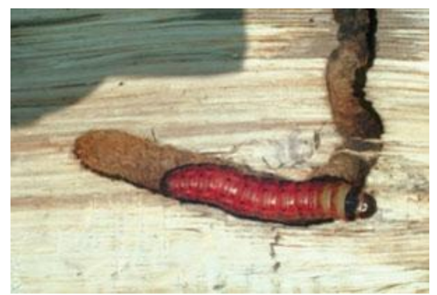
Attack by a carpenterworm, the larva of a moth, typically begins near a wound.

As with bark beetles, most borers are secondary invaders that attack bark and wood of trees that are seriously weakened, dying, or recently cut. Examples include carpenterworms, oak clearwing borers, metallic wood borers, and pine sawyers. Trees attacked by these pests are usually scattered so that most control measures are difficult and not economically feasible. Prevention is the best management practice to reduce losses to wood borers. Keeping trees healthy and vigorous will allow them to fight off invading borers.