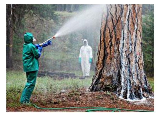
Preventive truck spray to protect against attack by wood boring insects

Insecticides used in bark beetle control do not penetrate the tree and kill the developing larvae so trees that have been successfully attacked by bark beetles cannot be saved by insecticide applications. However, uninfested high value trees, judged to be at high risk, can be sprayed with an insecticide as a preventative measure against attack. The area of the tree requiring insecticide treatment depends upon the insect species for which the application is being made. The appropriate area of the tree should be thoroughly wetted with the insecticide spray mixture.