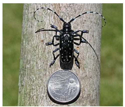
Asian longhorned beetle