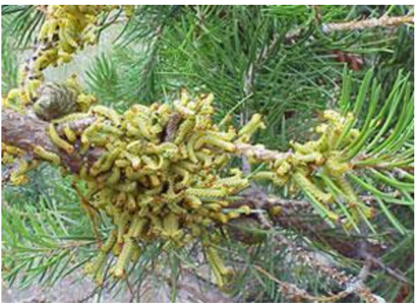
Redheaded pine sawfly larvae

Redheaded pine sawfly has a red head and a yellow-white body marked with six rows of black spots. The larvae are usually found on trees from 1-15 feet tall, where they feed gregariously on old and new needles and on tender shoots of these young trees.