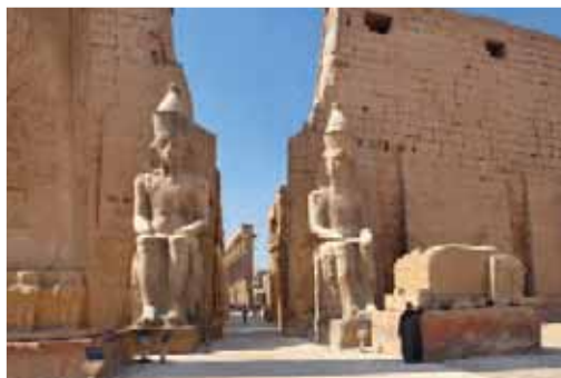
Temple of Luxor