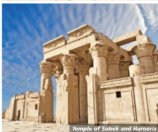
Temple of Sobek and Haroeris

After lunch on the ship, sail through Esna Lock, then enjoy free time onboard.