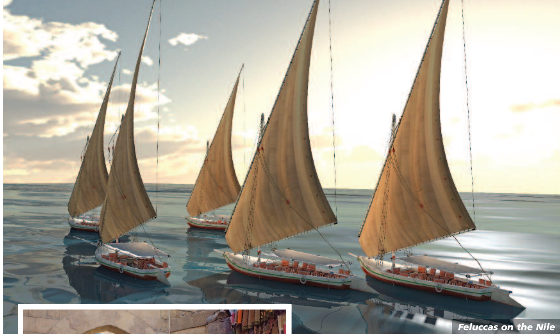
Feluccas on the Nile