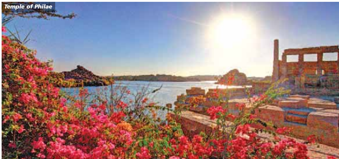
Temple of Philae