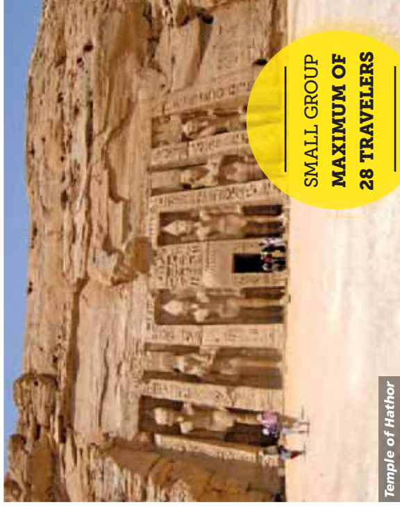
Temple of Hathor