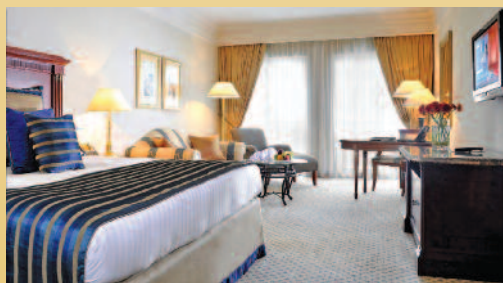
INTERCONTINENTAL CITYSTARS CAIRO | CAIRO