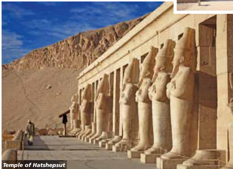
Temple of Hatshepsut