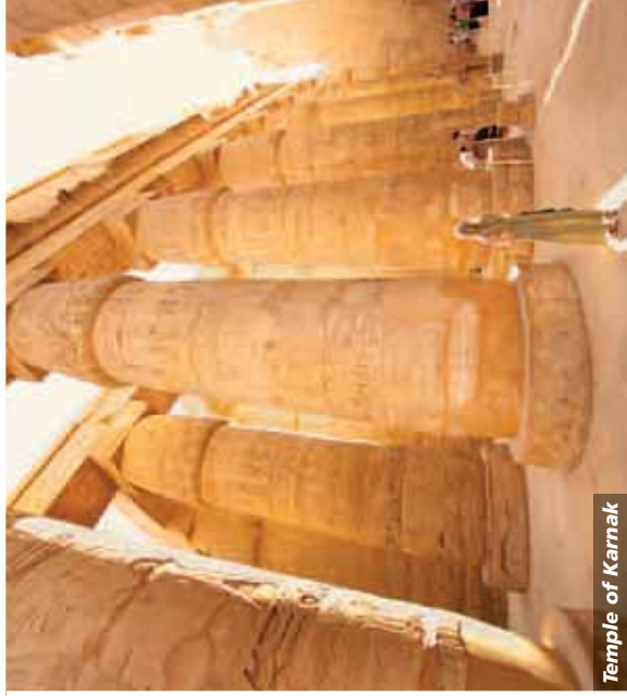
Temple of Karnak