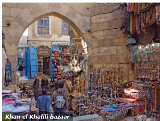
Khan el Khalili bazaar