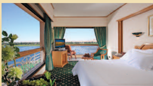
SONESTA ST. GEORGE HOTEL LUXOR | LUXOR