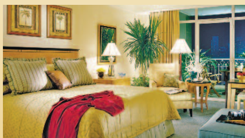
FOUR SEASONS HOTEL CAIRO AT NILE PLAZA | CAIRO