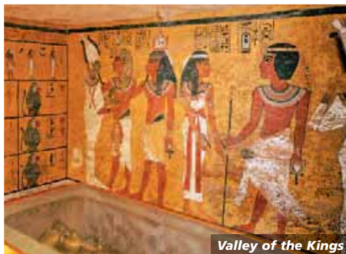
Valley of the Kings