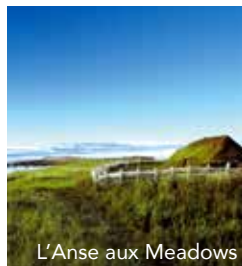
L'Anse aux Meadows