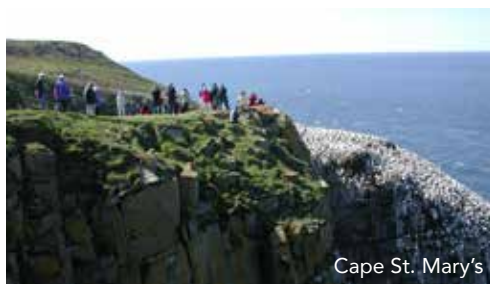
Cape St. Mary's