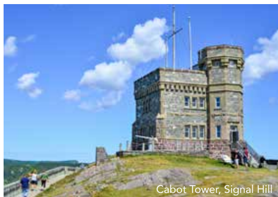
Cabot Tower, Signal Hill

Activity Level: The majority of the program's activities will take place outdoors and a fair amount of walking on varying terrain is to be expected. It is our expectation that guests on this program are able to walk a mile at a moderate pace, get in and out of a motor coach, and walk up a flight of stairs without assistance.