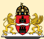
Budapest Coat of Arms

Budapest's majestic hills and artistic, bohemian avenues are sure to captivate you. Visit the stately, Gothic Revival-style Parliament Building, one of Europe's oldest legislative buildings and