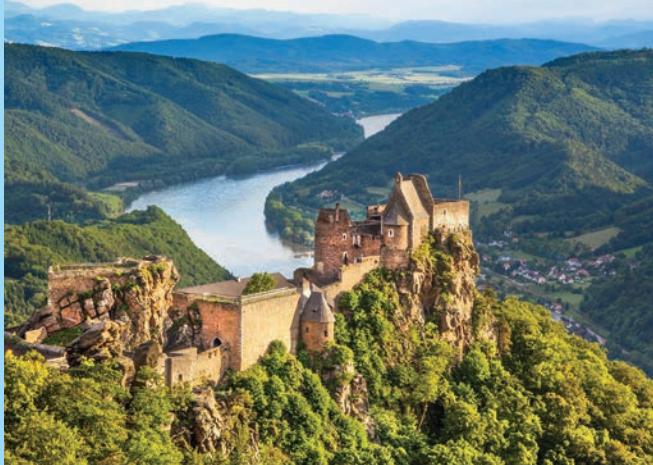
Cruise along the Danube River through the stunning natural beauty of the Wachau Valley landscape, a UNESCO World Heritage site.