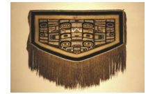
1900 Unknown artist Chilkat Ceremonial Robe KY 1895-Kentucky's population reaches 2 million