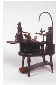
1880 Unknown artist Seated Man and Woman with Toy Paddle KY 1884-Safety Laws are developed for Coal and Iron Ore mines