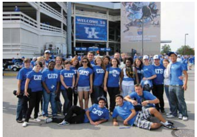
German Fulbright Diversity Institute participants attended the UK-UofL football game in September.