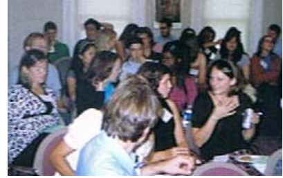
Alumni enjoy catching up with one another at the reunion.

Next, alumni gathered in small groups to discuss two important questions: "How can the Center better serve alumni?" and "How can the Center better utilize alumni?" Some suggestions that would serve both purposes included better advertising of Gaines Center events, some of which feature alumni (e.g. our Alumni Lecture series) and developing the alumni network via the Center's website. We are already at work on these suggestions and welcome more!