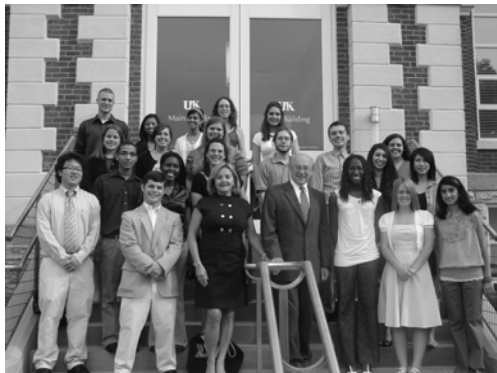
2009-2010 Chellgren Student Fellows