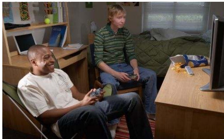
Roommates will complete a Roommate Agreement Contract with their Resident Advisor at the beginning of the Fall 2008 Semester.

Do you have an older sibling or friend who is already a student at the University of Kentucky? If so, you have likely already received lots of advice, tips, and information. If you are entirely new to the UK experience... don't worry! There are so many amazing people and resources, you will be a pro in no time! After all, knowledge REALLY is power! Start learning about your new campus home now!