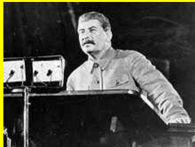
Putin addressing reporters.

"In a truly laissez fair system, the government should be able to do as it pleases, to take over whoever it wants, just like any other company. It's not like it has any inherent advantage in the free market!" shouted President Putin angrily at a throng of reporters, pounding his fist into the podium shortly before unveiling his new economic policy for Russia, tentatively titled the "Five-Year Plan."