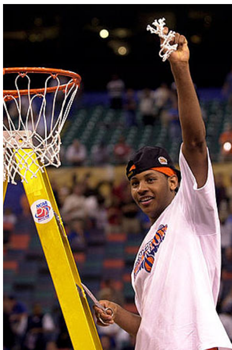
The Almighty basking in his victory.

“This loss was pretty disappointing for us,” added the Prince of Darkness speaking shortly afterward to reporters. “I really thought we had Kentucky in the bag until those exit polls started coming in. It’s hard, but you have to get over it. We’re just going to take it one day at a time, look at what worked and what didn’t and then try to make some adjustments. I mean if I can no longer tempt good Christian men and women into consensual lifetime commitments of monogamous homosexual