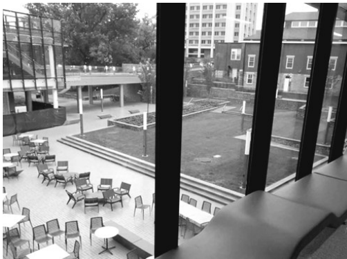
The Gatton Student Center includes large outdoor plazas—areas for study, socializing and relaxing.