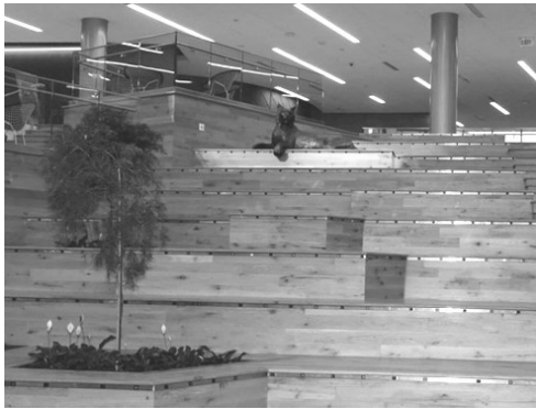
The social staircase design reflects the way water carves through Kentucky karst topography intimating how knowledge flows through the university.

den, and recreation area, a place that brings people together to cultivate relationships and meet new people, to work across differences and build community—bringing immeasurable benefit to the UK Campus.