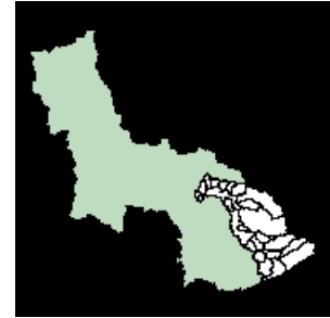
North Fork Region

Watershed is in PRIDE service region. PRIDE identified 138 straight pipes or failing septic systems in the watershed.