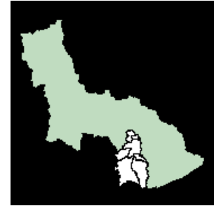
South Fork Region

Watershed is in PRIDE service region. PRIDE identified 302 straight pipes or failing septic systems in the watershed.