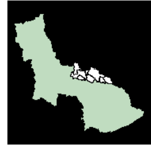
Red River Region

The Menifee County portion of the watershed is in the PRIDE service region.