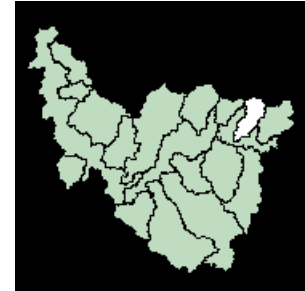
See the color map of this region on p. 133.