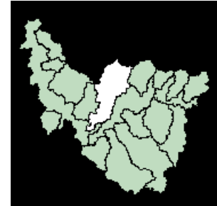
See the color map of this region on p. 133.