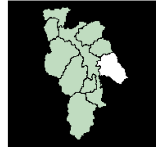
See the color map of this region on p. 137.