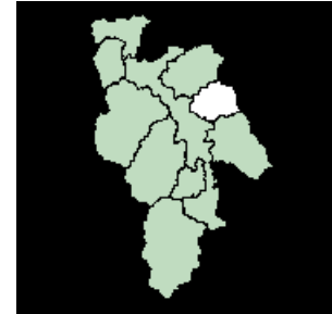
See the color map of this region on p. 137.