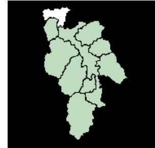
See the color map of this region on p. 137.