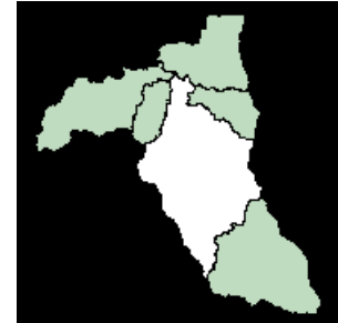
See the color map of this region on p. 139.