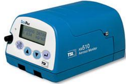
TSI SidePak AM510 Personal Aerosol Monitor

The equipment was set to a one-minute log interval, which averages the previous 60 one-second measurements. Sampling was discreet in order not to disturb the occupants' normal behavior. For each venue, the first and last minute of logged data were removed because they are averaged with outdoor and entryway air. The remaining data points were summarized to provide an average \text{PM}_{2.5} concentration within each venue. The Kentucky Center for Smoke-free Policy (KCSP) staff trained researchers from the Breckinridge County Health Department, who did the sampling and sent the data to KCSP for analysis.