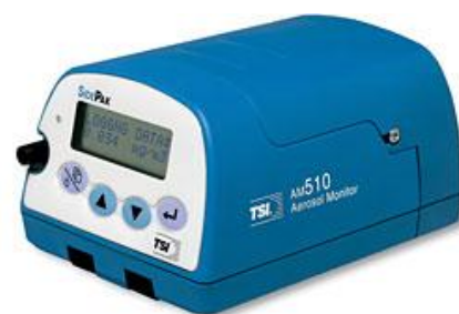
TSI SidePak AM510 Personal Aerosol Monitor

A TSI SidePak AM510 Personal Aerosol Monitor (TSI, Inc., St. Paul, MN) was used to sample and