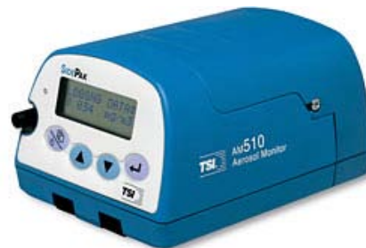
TSI SidePak AM510 Personal Aerosol Monitor

Between May 23, and June 2, 2010, indoor air quality was assessed in nine indoor hospitality venues located in Powell County. Sites were of various sizes; some