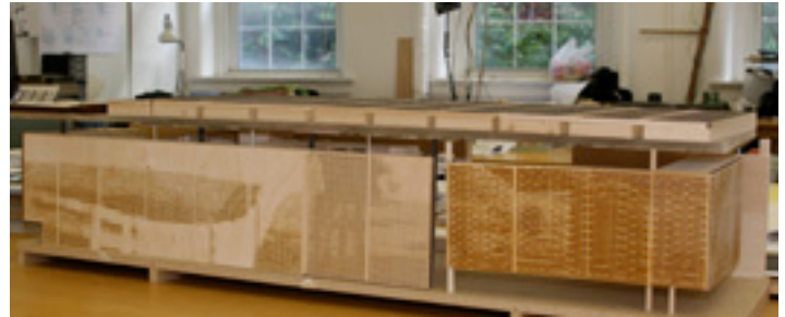
A model of the house renders a Kentucky landscape as a series of perforations in the siding

The house also references the historic Kentucky breezeway plan, which by design naturally creates airflow throughout the house from all directions. “The planning and orientation of our house allows the whole house to breathe and take advantage of all of the things in nature that are free such as the prevailing winds, solar orientation, and daylight harvesting,” said Luhan. But make no mistake, while this house references the past, it is very leading-edge and forward-looking.