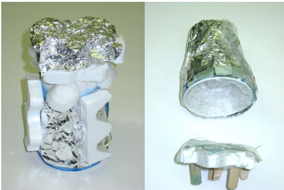
Figure 2: Student-designed dwellings for ice penguins.

Building supplies consist of common materials such as cotton balls, Popsicle sticks, aluminum foil, coffee cups, and foam packaging peanuts (Figure 2).