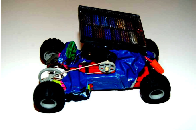
Figure 5. A student-designed solar car.

The design competition should take place outdoors in the sun, on a flat surface such as a sidewalk or running track. The teacher frontloads students with information about circuits, how solar cells work, how motors work, and how energy can be converted from one form to another with losses usually taking place. Students then test three different motors, three different solar panels, and different wheel-covering materials to select the best options for their car. The Lego parts are considered “free”, but students must purchase a motor, solar cell, and wheel coverings from a budget. In the process of building a solar car, many practical science concepts need to be mastered for building success. Students need to learn how to use a force meter, how to use a volt meter, and how to wire series and parallel circuits. Experimental methods and construction techniques are practiced as students test different design configurations in order to create a successful car. Students test their cars by seeing how much weight it can pull in a cart attached to the rear of their vehicle (Figure 6).