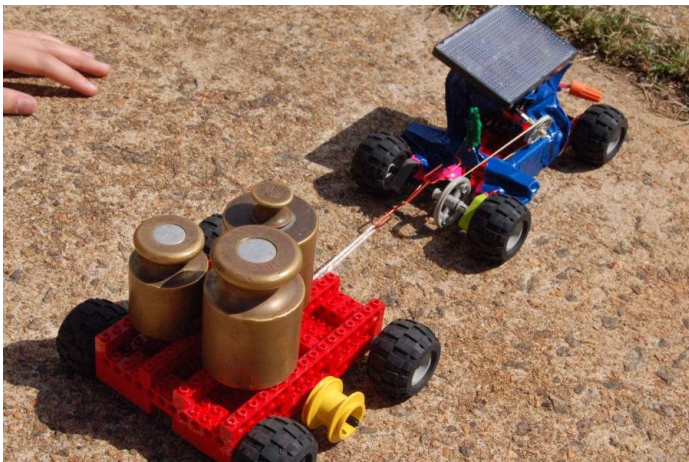
Figure 6. Student tests the solar car with a cart full of weights.

The design competition should take place outdoors in the sun, on a flat surface such as a sidewalk or running track. The teacher frontloads students with information about circuits, how solar cells work, how motors work, and how energy can be converted from one form to another with losses usually taking place. Students then test three different motors, three different solar panels, and different wheel-covering materials to select the best options for their car. The Lego parts are considered “free”, but students must purchase a motor, solar cell, and wheel coverings from a budget. In the process of building a solar car, many practical science concepts need to be mastered for building success. Students need to learn how to use a force meter, how to use a volt meter, and how to wire series and parallel circuits. Experimental methods and construction techniques are practiced as students test different design configurations in order to create a successful car. Students test their cars by seeing how much weight it can pull in a cart attached to the rear of their vehicle (Figure 6).