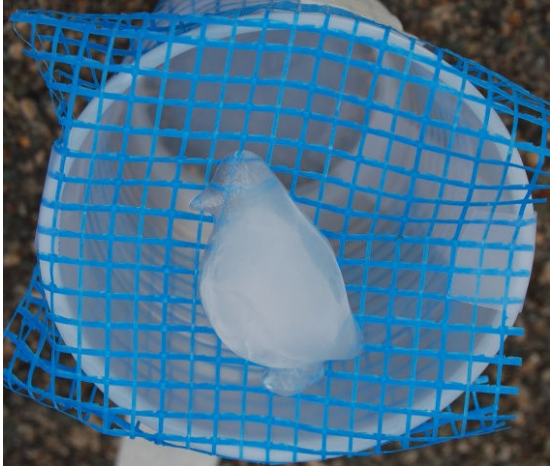
Figure 1: The penguin-shaped ice cube on blue mesh.

Building supplies consist of common materials such as cotton balls, Popsicle sticks, aluminum foil, coffee cups, and foam packaging peanuts (Figure 2).