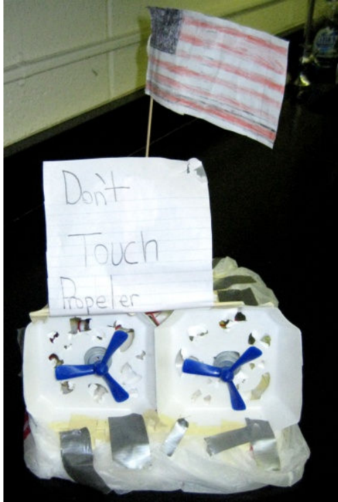
Figure 4. A student-designed hovercraft with warning sign.

The design competition can take place indoors on a flat surface such as a hallway or gymnasium. The teacher can either frontload students with information about circuit design, forces and motion, or the students can learn these concepts on a need-to-know basis. In the process of building a working hovercraft, many practical science concepts need to be mastered for building success. The teacher might perform demonstrations about Newton's Laws, teach students about the difference between parallel and series circuits, and demonstrate how to strip wire and properly connect devices. Experimental methods and construction techniques are practiced as students test different design configurations in order to create a successful craft. In addition to building a working hovercraft, students keep design diaries in which they record questions asked and answered, sketches and designs attempted, failures and successes, and the final design drawing. The goal is for students to apply the learning and behavioral objectives in the process of designing, constructing, re-designing, and testing their hovercraft.