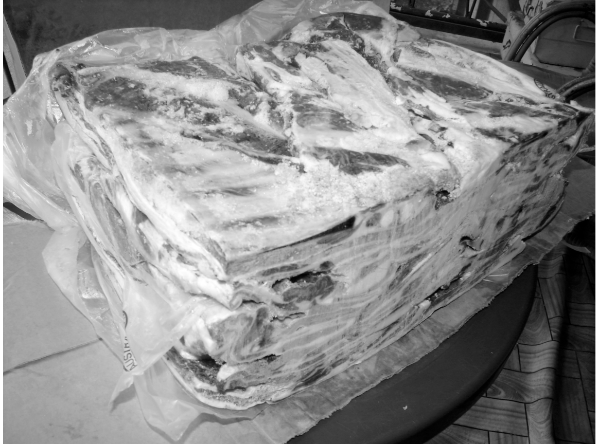
Figure Two: Lamb/Mutton Flaps, Just Out of the Half-Carton (picture credit, Nancy Sullivan).

Many health professionals think this trade in flaps has had a role in creating unhealthy Pacific-Island bodies. Most agree that diets high in animal fats contribute to obesity, hypertension, heart disease, and diabetes. And they agree that, while these diseases have been on the rise world wide, they have risen dramatically in some Pacific-Island countries. 9 In fact, health statistics do reveal an alarming picture in Tonga and a serious picture in Fiji. PNG is something of a mixed case: while over-nourishment in urban areas among the relatively affluent is increasing, undernourishment in rural areas and among the urban poor, especially as concerns lack of protein, is a serious problem. 10