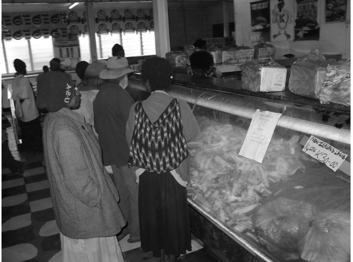
Figure Three: Waiting to Buy Lamb/Mutton Flaps in Goroka.